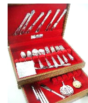
Lot # 443