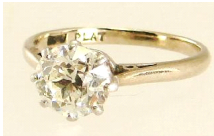
Lot # 428