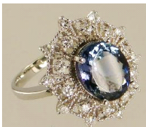
Lot # 431