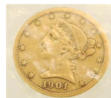
Lot # 645