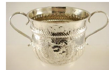
Lot # 439