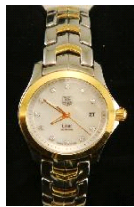
Lot # 652