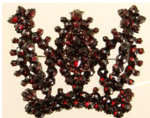
Lot # 452