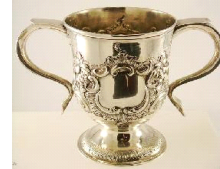
Lot # 434