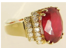
Lot # 455