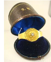
Lot # 418