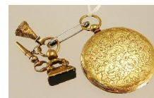
Lot # 666