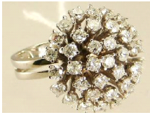
Lot # 427