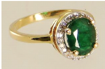
Lot # 429