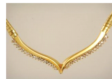
Lot # 489