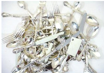
Lot # 552

551 Lot of sterling silver souvenir spoons. $25 - $50