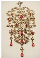
Lot # 432