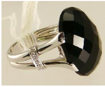
Lot # 579