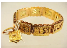
Lot # 454