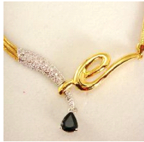
Lot # 480