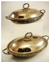
Lot # 447