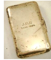
Lot # 433