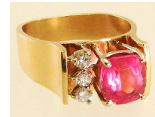
Lot # 420