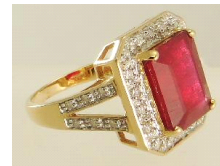
Lot # 457