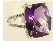
Lot # 487