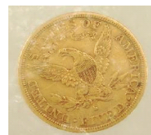
Lot # 646