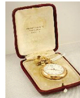
Lot # 665