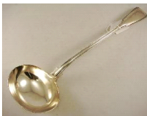
Lot # 408