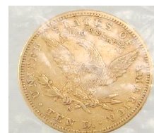
Lot # 649