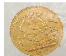
Lot # 647