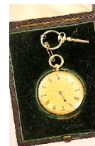
Lot # 664