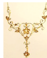
Lot # 531