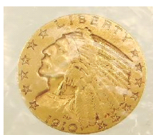
Lot # 644