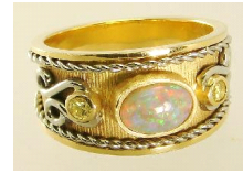
Lot # 482