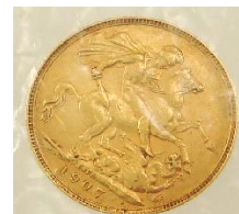
Lot # 648