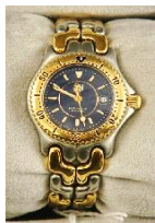
Lot # 654