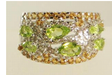
Lot # 483