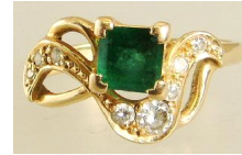
Lot # 487