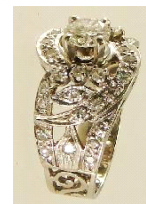
Lot # 518