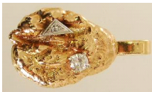
Lot # 512