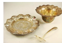
Lot # 735