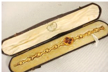
Lot # 456