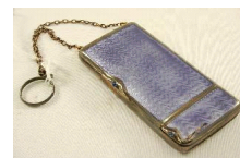
Lot # 789