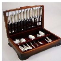
Lot # 621