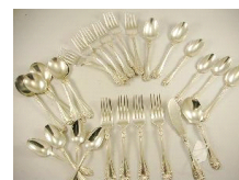
Lot # 739