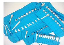
Lot # 740