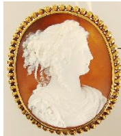
Lot # 457