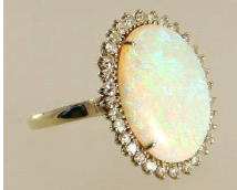
Lot # 426