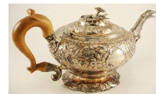
Lot # 445