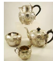
Lot # 440