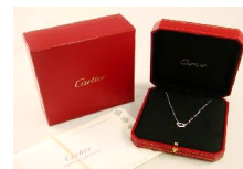
Lot # 517