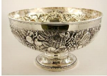
Lot # 402