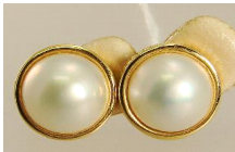
Lot # 576