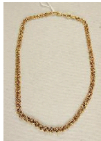
Lot # 481