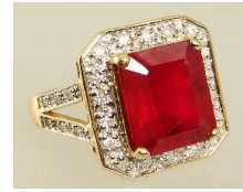
Lot # 486