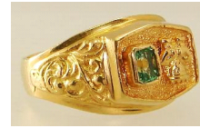
Lot # 458