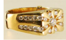
Lot # 459