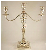
Lot # 413