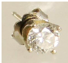
Lot # 549