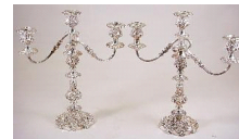
Lot # 465