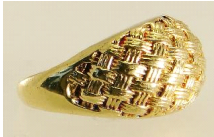
Lot # 453