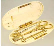
Lot # 795