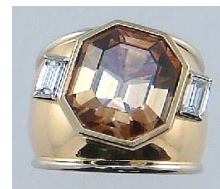
Lot # 516