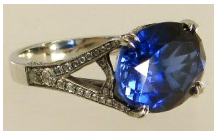
Lot # 429