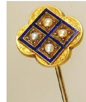
Lot # 460