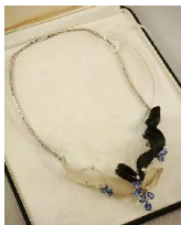
Lot # 484