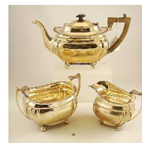
Lot # 562