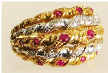
Lot # 427