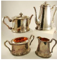
Lot # 401