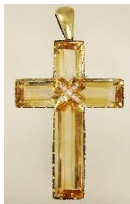
Lot # 430