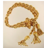
Lot # 423