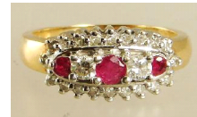
Lot # 488