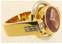
Lot # 425