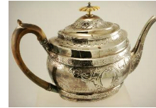
Lot # 436