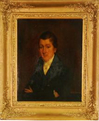
Lot # 275