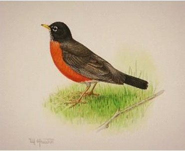
Lot # 161