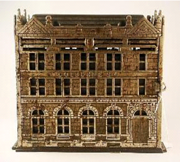
Lot # 199