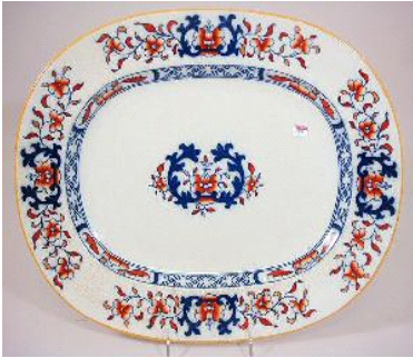
Lot # 234