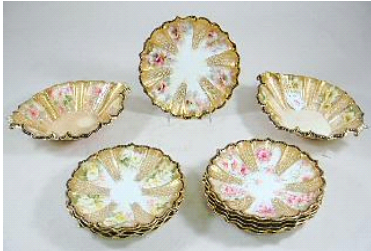
Lot # 297

293 Two 19th century Mason's ironstone pitchers. $40 - $60 294 Cut crystal decanter. $50 - $75 295 19th century hand painted covered tureen. $50 - $100 296 Inlaid mahogany secretaire desk. $300 - $500