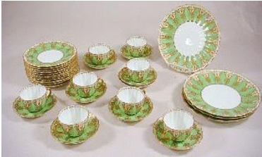
Lot # 24

24 Lot of Doulton Burslem gilded china dinnerware. $100 - $200