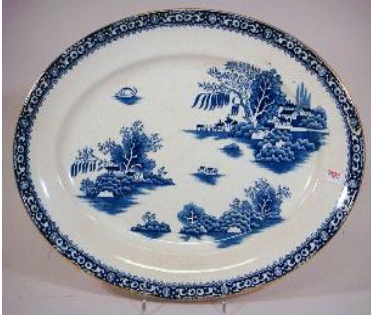
Lot # 305