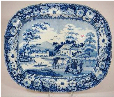
Lot # 361