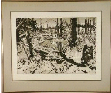
Lot # 73

72 Slate top three drawer low cabinet. $75 - $150