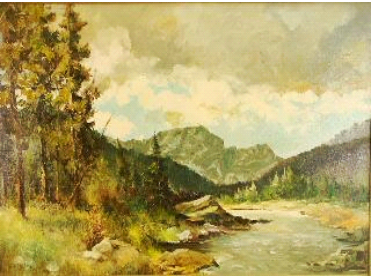
Lot # 67