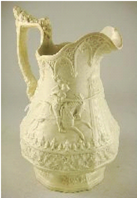
Lot # 130

130 19th. century W.Ridgway Son & Co. cream ceramic jousting decorated jug, height 7 1/2 in.