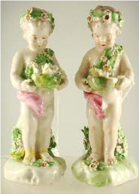
Lot # 328