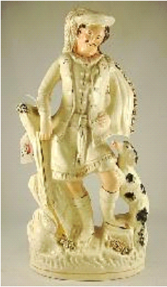
Lot # 177