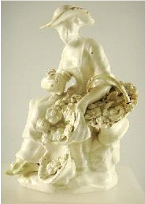
Lot # 332