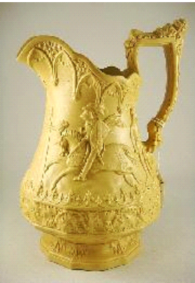
Lot # 131

131 19th. century W. Ridgway Son & Co. beige ceramic jousting decorated jug, height 9 3/4 in.