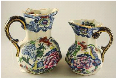
Lot # 293

289 Persian carpet, approx. 12'7" x 8'7". $250 - $350 290 Six Chinese Export "Famille Rose" decorated china plates. $75 - $100 291 Oak finished china cabinet. $250 - $350 292 Watercolour possibly signed W.H. Penesay, 11 in. x 26 in. "Thames- Greenwich". $200 - $300