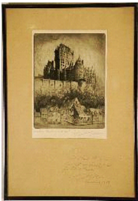
Lot # 77

76 Pair of gilt framed Dutch lithographs. $25 - $50