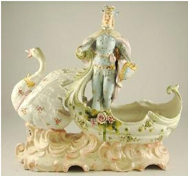
Lot # 283

282 China decorated and floral painted vase with three ring handles, height 9 1/2 in. $25 - $50