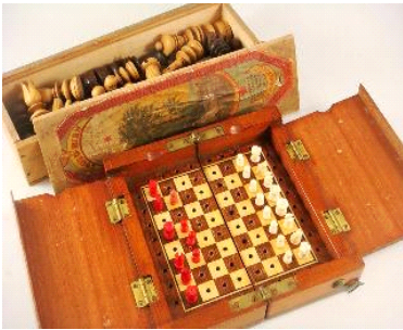
Lot # 58