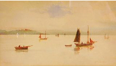
Lot # 46

45 Set of four Edwardian carved walnut side chairs. $75 - $100