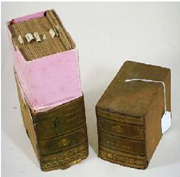
Lot # 286

283 Large china figured swan bowl, length 9 1/2 in., height 9 in. $100 - $150 284 Victorian porcelain figurine, 6", "Tea for Three". $75 - $125 285 Lot of Belleek "black mark" china. $75 - $100