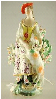
Lot # 330

330 Early china figurine of a standing lady with dog and flowers, height 5 1/4 inches.