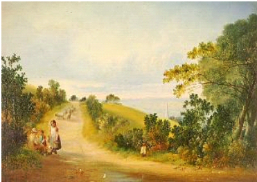
Lot # 354