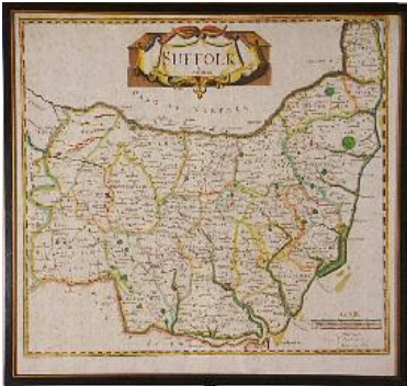
Lot # 347

346 Early coloured map of London from "Civitates Orbis Terrarum" (Braun & Hogenberg), 15" x 20 1/2". $150 - $300