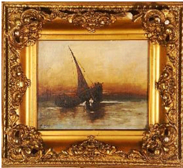
Lot # 326