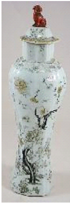
Lot # 318