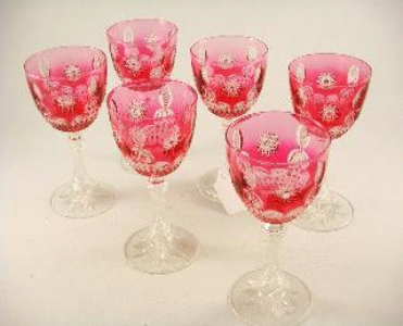
Lot # 343