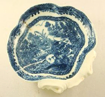
Lot # 342