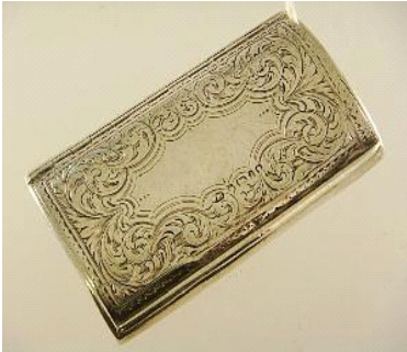
Lot # 2