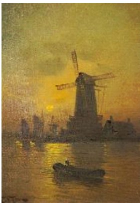
Lot # 352

351 Edwardian inlaid mahogany secretaire bookcase. $400 - $600