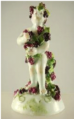
Lot # 331

331 European china figurine of a standing putti with grapes, height 4 3/4 in.