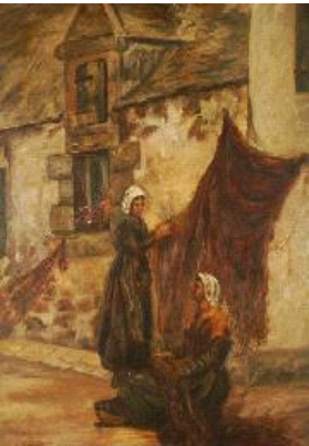
Lot # 132

132 Unsigned oil on canvas, 25 in. x 16 in., "Cleaning The Nets".