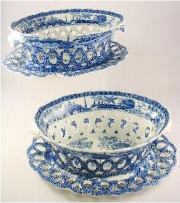
Lot # 309