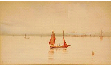
Lot # 109