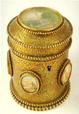
Lot # 261