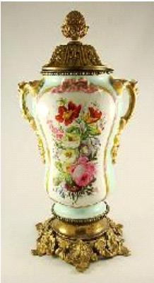
Lot # 369

368 19th century French Louis XVI style giltwood mirror. $1,500 - $1,750