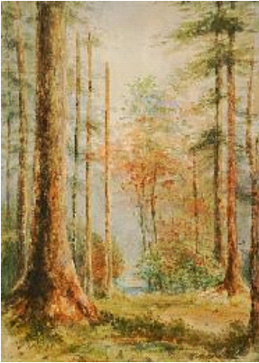
Lot # 165