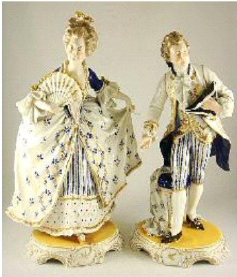
Lot # 210

209 Pair of late 19th. century side chairs with upholstered seats. $25 - $50