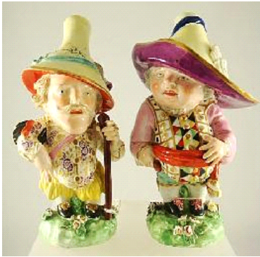
Lot # 366