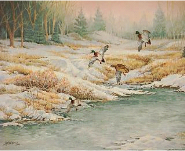
Lot # 314