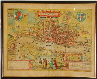
Lot # 346

345 18th century carved mahogany Chippendale style framed mirror. $250 - $350