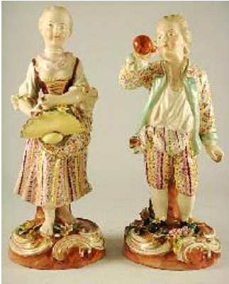
Lot # 333