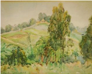
Lot # 358