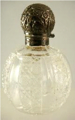
Lot # 248