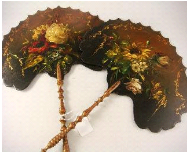
Lot # 349

348 Oil painting on board signed Morelli, 21 in. x 16 1/2 in., "Girl Sewing". $100 - $200