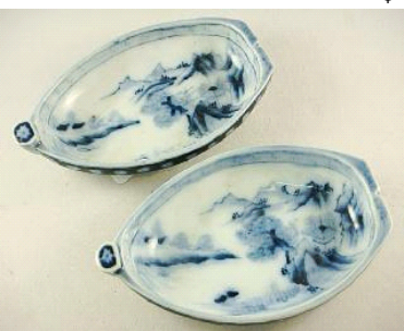
Lot # 84

83 Oriental early dragon decorated china blue and white vase, 11" in height. $250 - $350