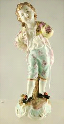
Lot # 329