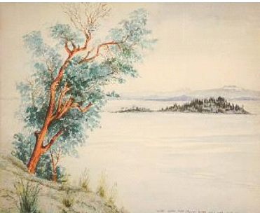
Lot # 160