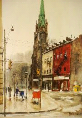
Lot # 14