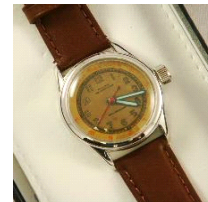
Lot # 510