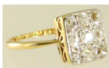
Lot # 580