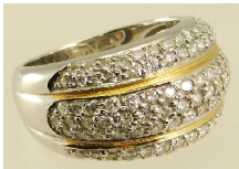
Lot # 501