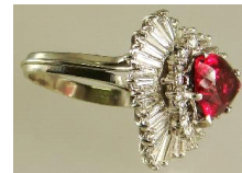
Lot # 438