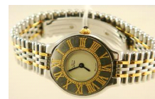
Lot # 511