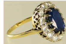
Lot # 436