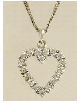
Lot # 473