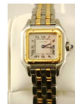
Lot # 513