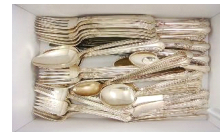
Lot # 696