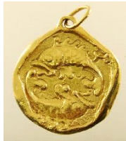
Lot # 431