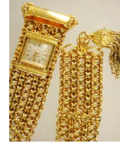
Lot # 421