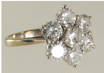
Lot # 429