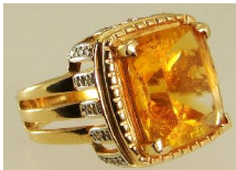
Lot # 476