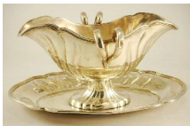
Lot # 412