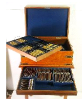
Lot # 792