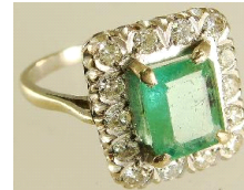
Lot # 435