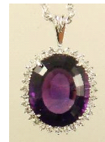
Lot # 439