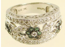
Lot # 474