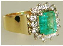
Lot # 440