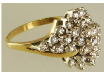
Lot # 675