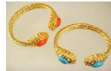
Lot # 464