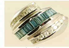
Lot # 480