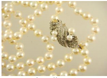
Lot # 751