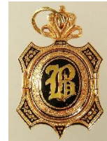
Lot # 466