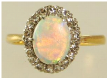
Lot # 475