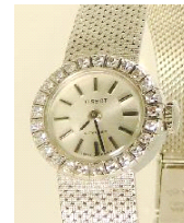
Lot # 791