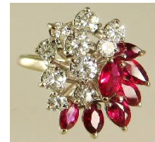
Lot # 437