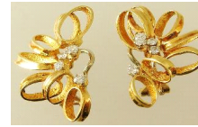
Lot # 462