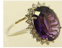
Lot # 434