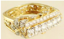
Lot # 502