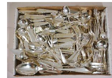
Lot # 488