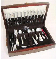
Lot # 666