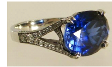
Lot # 480A