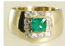
Lot # 509