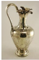
Lot # 492