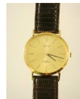
Lot # 512