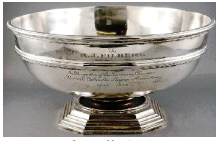
Lot # 401