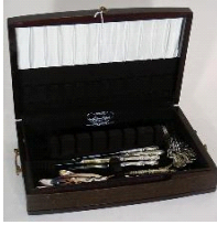
Lot # 702