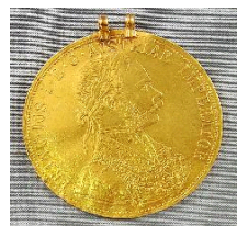
Lot # 428