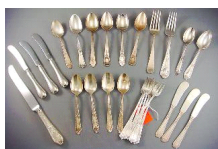
Lot # 575