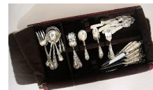
Lot # 547