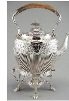
Lot # 415