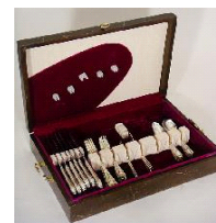
Lot # 589