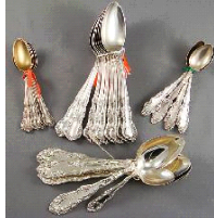
Lot # 634