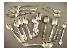
Lot # 580