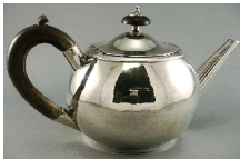
Lot # 405