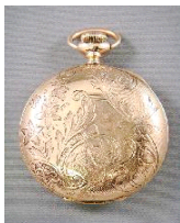
Lot # 685