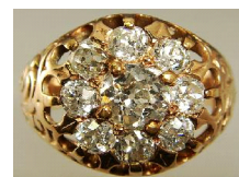
Lot # 471