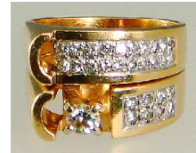
Lot # 434