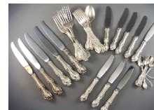
Lot # 696