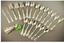
Lot # 668