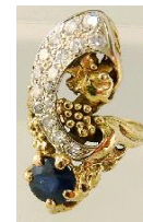
Lot # 473