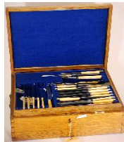
Lot # 639