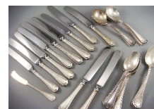
Lot # 592