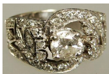
Lot # 502