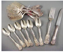
Lot # 633