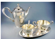
Lot # 538