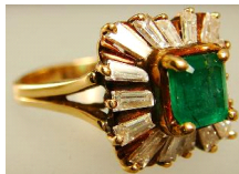
Lot # 426