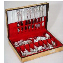
Lot # 419