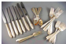
Lot # 638