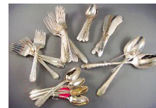
Lot # 699