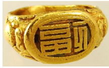
Lot # 424