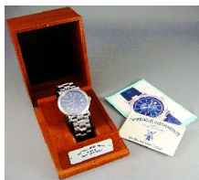
Lot # 602