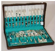
Lot # 408