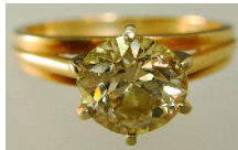
Lot # 425