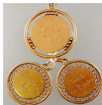
Lot # 463