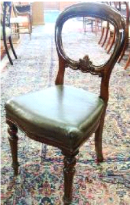
Lot # 70

69 Victorian mahogany dining table with 2 leaves. $800 - $1,000