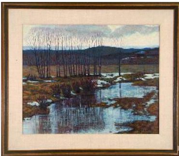
Lot # 138