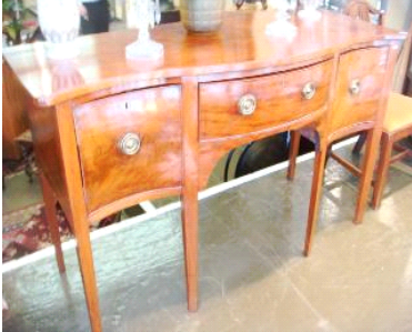
Lot # 187

186 Kirman rug, approx. 7'4" x 4'5". $300 - $500