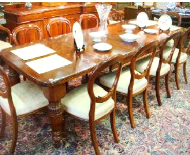
Lot # 83

82 Drawing signed I. Hoffer, 9 1/4 x 11 inches, "The Cabin". $25 - $50