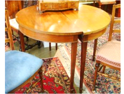
Lot # 92