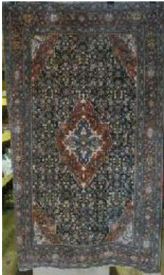
Lot # 42

41 German walnut wall barometer, Ph.C. Schindler, Neuwied. $75 - $125