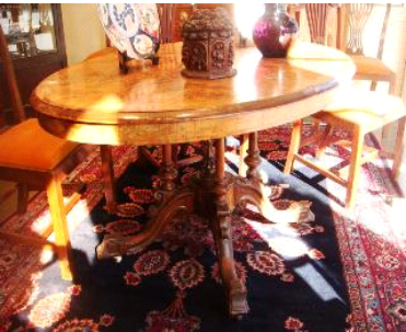
Lot # 184

184 Victorian inlaid burr walnut loo table.