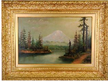
Lot # 161