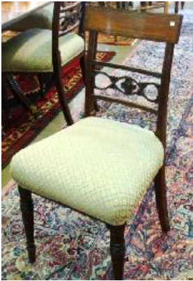
Lot # 31

30 Georgian style mahogany triple pedestal dining table. $800 - $1,200