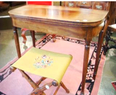
Lot # 142