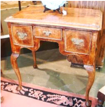
Lot # 140