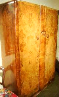
Lot # 38

37 Art Deco burr walnut vanity. $200 - $400