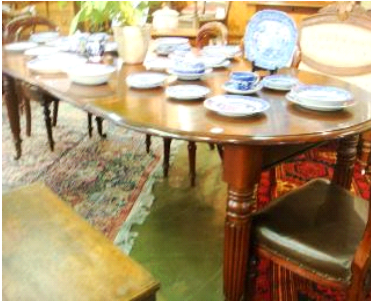
Lot # 69

68 Lot of "blue willow" patterned china. $125 - $175