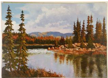
Lot # 133