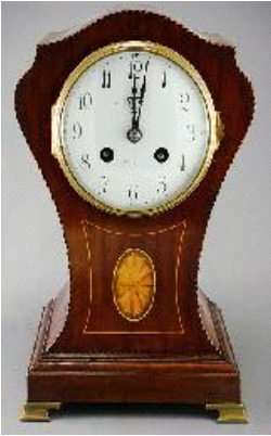
Lot # 176

175 Pair of brass candlesticks with brass shades. $75 - $100