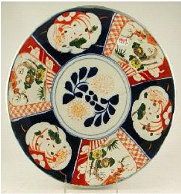
Lot # 181