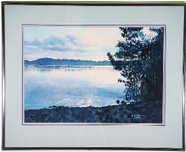
Lot # 58

57 Pair of late 19th. century carved oak side chairs. $25 - $50