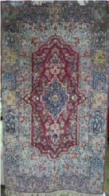
Lot # 186

186 Kirman rug, approx. 7'4" x 4'5". $300 - $500