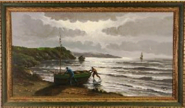
Lot # 36

35 19th century needlework upholstered side chair. $25 - $50