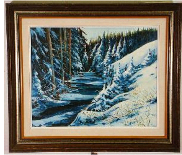
Lot # 165