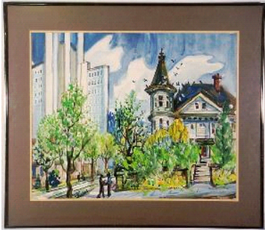
Lot # 151

150 Victorian burl walnut etagere. $250 - $350