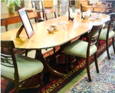
Lot # 30

29 19th century lustre decorated china tea wares. $50 - $100