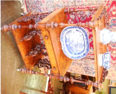
Lot # 150

149 Blue and white china platter, jug and bowl. $30 - $60