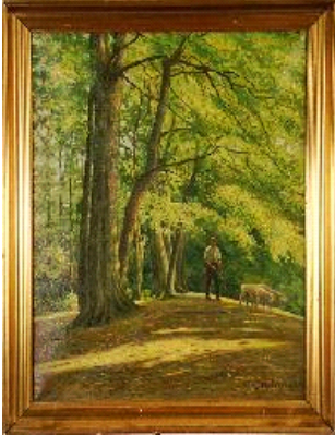
Lot # 122

121 Mahogany bookcase with astral glazed doors. $200 - $300