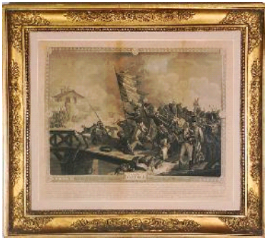
Lot # 52

52 Pair of late 18th. century French Napoleon prints- "Bataille de Wagram"& "Bataille d'Arcole". $75 - $150