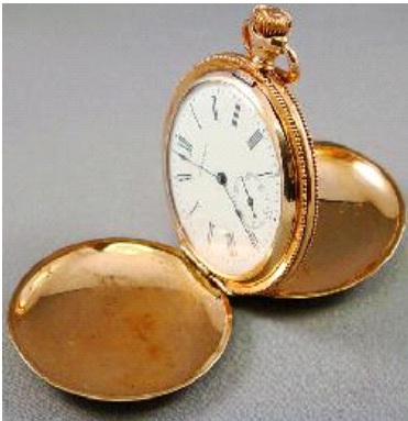
Lot # 103