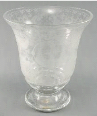
Lot # 155