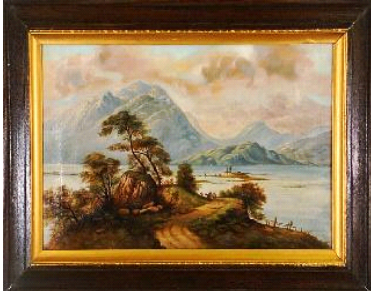
Lot # 53

52 Pair of late 18th. century French Napoleon prints- "Bataille de Wagram"& "Bataille d'Arcole". $75 - $150