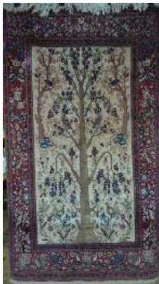
Lot # 1

1 Pair of Isphahan "Tree of Life" pattern rugs, approx.7'2" x 4'6" & 6'9" x 4'7".