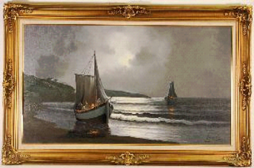
Lot # 132

132 Oil on canvas signed K.Souren, 21 in. x 39 in., "Sail Boats in Moonlight". $150 - $250