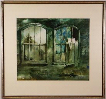
Lot # 152

151 Watercolour signed Gordon Kit Thorne 17 1/2 in. x 23 in., "Nicola & Robson Vancouver 1974". $50 - $100