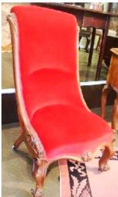
Lot # 137