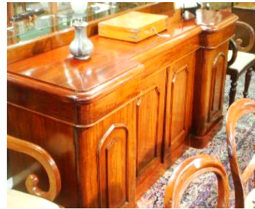
Lot # 87