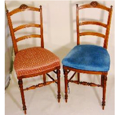
Lot # 88