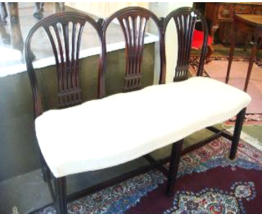
Lot # 146