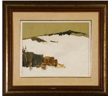
Lot # 166