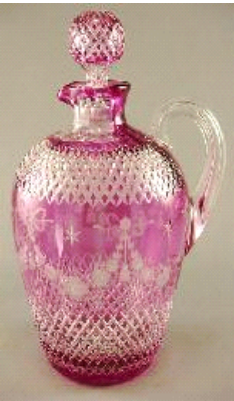
Lot # 156