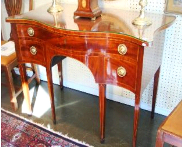
Lot # 189

188 Early Victorian upholstered corner chair. $75 - $125