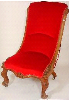
Lot # 137