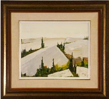
Lot # 168

83 Victorian mahogany dining table with 3 leaves and a crank. $1,000 - $1,500