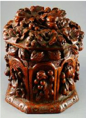
Lot # 182

182 German Black Forrester-Style carved tobacco box.