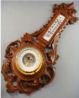
Lot # 41

40 Late 19th century walnut pier mirror. $200 - $400