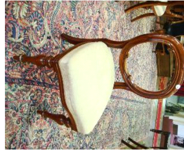
Lot # 84