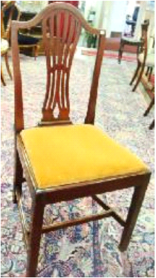
Lot # 185

185 Set of eight Georgian style mahogany dining chairs.