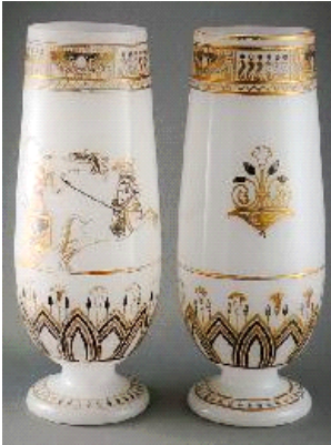
Lot # 153