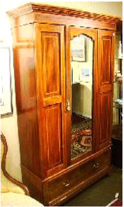
Lot # 59

59 Inlaid mahogany armoire with mirrored drawer. $200 - $300