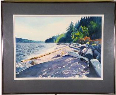
Lot # 56

55 19th century hand painted candleabra with a dish. $50 - $75