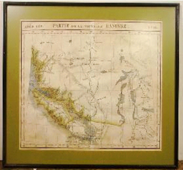
Lot # 129

128 Early mahogany drop leaf gate leaf table. $150 - $250