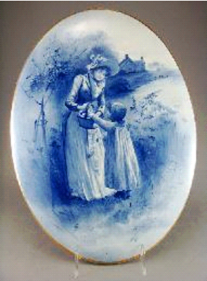
Lot # 158