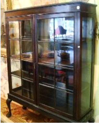
Lot # 121

153 Pair of Victorian glass vases decorated in an Egyptian style, height 12 inches. $100 - $150