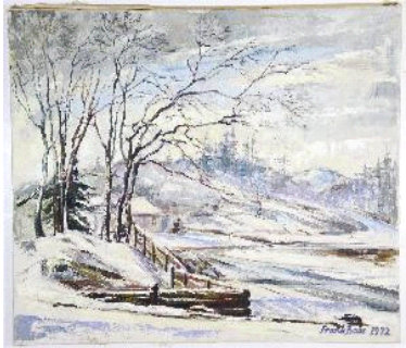
Lot # 51