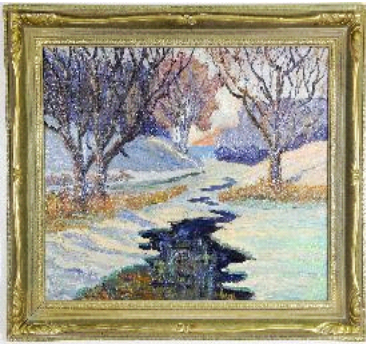
Lot # 117

116 Pen drawing signed Geoffrey Rock, 8 1/2" x 11 1/2", "W. 6th East Birch". $75 - $125