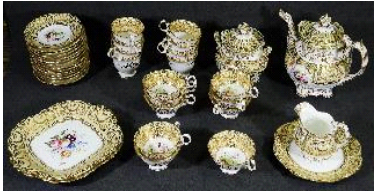
Lot # 181