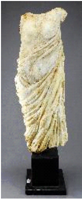
Lot # 106

105 Graphite on paper signed H.(Heather) Cragg, 1974, "Interior Figure". $50 - $75