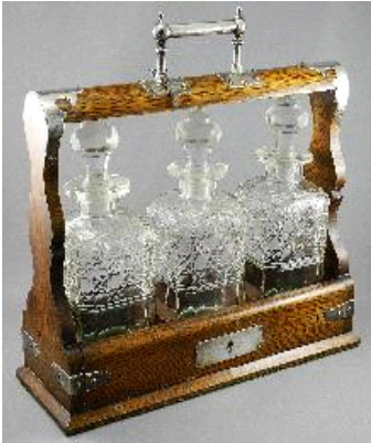
Lot # 170