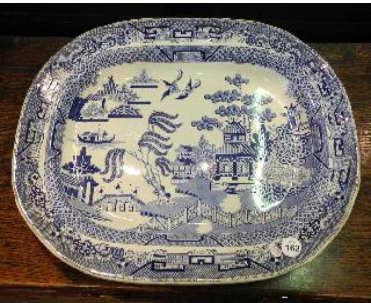
Lot # 99

93 Pair of Rococo Revival ormolu three branch wall sconces. $200 - $300 94 Late 19th. century upholstered wire back settee. $200 - $300 95 Set of 5 carved oak dining chairs. $200 - $300 96 Carved oak writing desk. $200 - $300 97 Floral decorated triptych mirror. $100 - $200 98 Small oak chest. $40 - $60