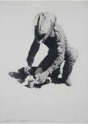
Lot # 255

254 Victorian parlor chair with fruit decoration. $150 - $250