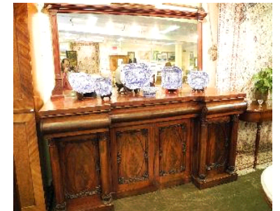
Lot # 133