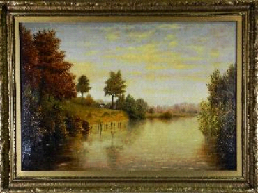
Lot # 231