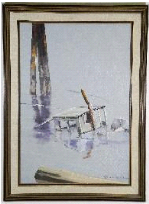
Lot # 146