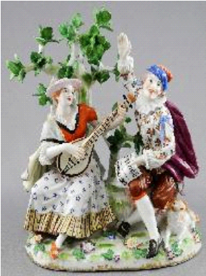
Lot # 291