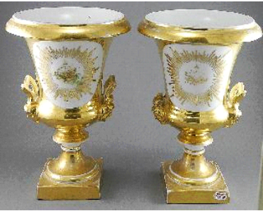
Lot # 149