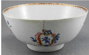
Lot # 239