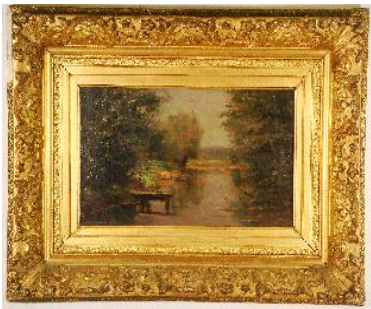
Lot # 260

259 Oil on canvas signed Oscar DeLall, 16 in. x 20 in., "Ste.Adele Quebec- Winter Landscape". $100 - $150