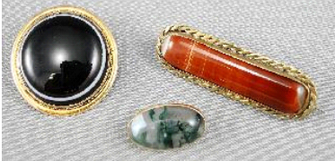
Lot # 199