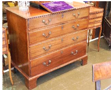
Lot # 246