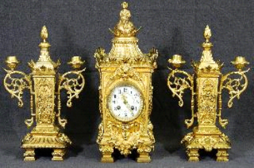
Lot # 236