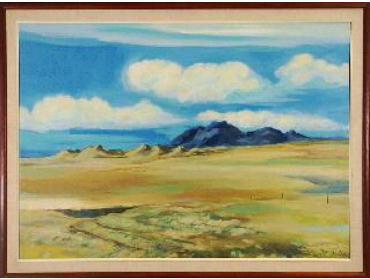
Lot # 229