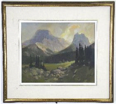
Lot # 38