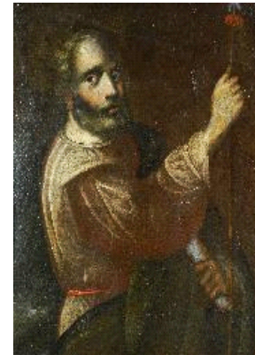
Lot # 131