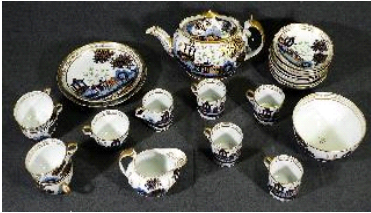
Lot # 1