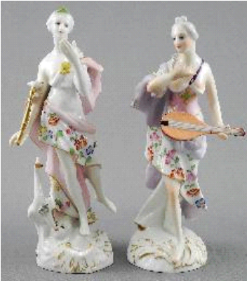
Lot # 289