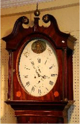
Lot # 206