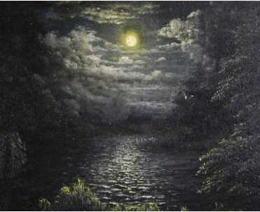
Lot # 147