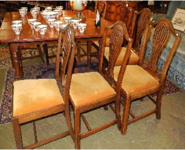
Lot # 164

164 Set of eight Georgian style mahogany dining chairs. $500 - $750