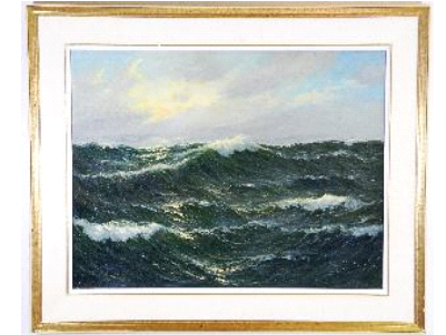
Lot # 132