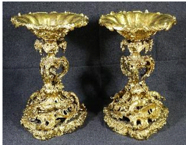
Lot # 242