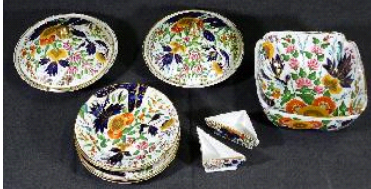
Lot # 219

218 Pakistani Boukara carpet. $200 - $300