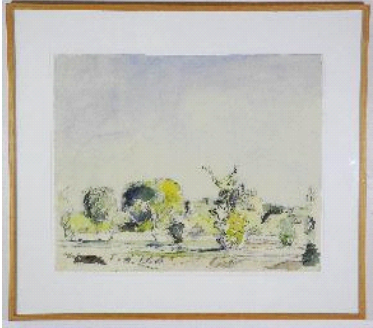
Lot # 37