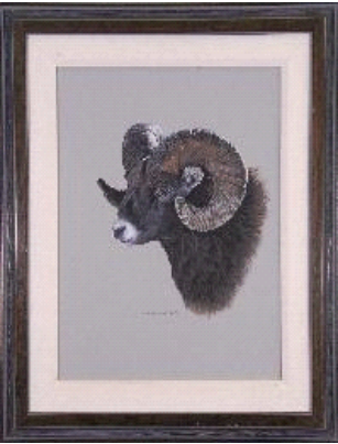
Lot # 235