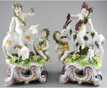
Lot # 292