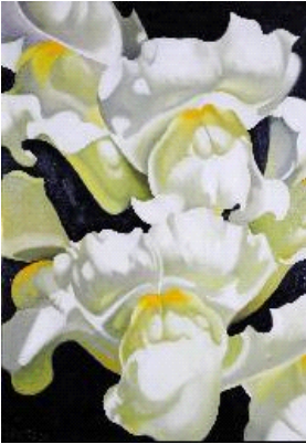
Lot # 252

251 Carved mahogany pedestal stand. $150 - $300