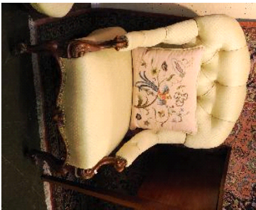
Lot # 261

260 Oil on canvas signed Van Der Ven, d.1909, 11 1/2 x 18", "River Landscape". $250 - $500