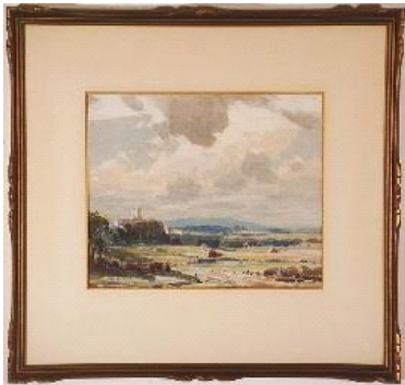
Lot # 263

261 Early Victorian upholstered parlor chair. $150 - $250 262 Oil on canvas unsigned, 20" x 30", "Landscape". $50 - $100