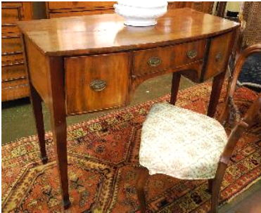
Lot # 163

162 Pair of Dresden floral painted scallop shaped dished, length 9in. $50 - $75