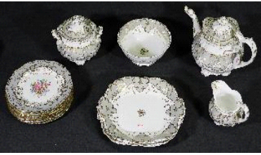
Lot # 165

164 Set of eight Georgian style mahogany dining chairs. $500 - $750