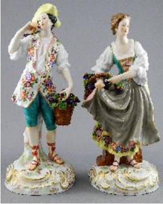
Lot # 286