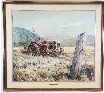
Lot # 216

215 Two pierced china jardinières. $30 - $60