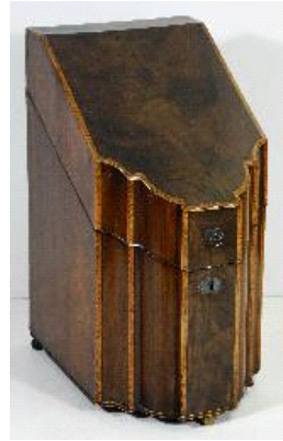
Lot # 243