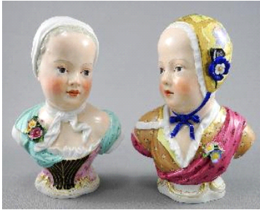
Lot # 290