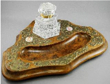
Lot # 195