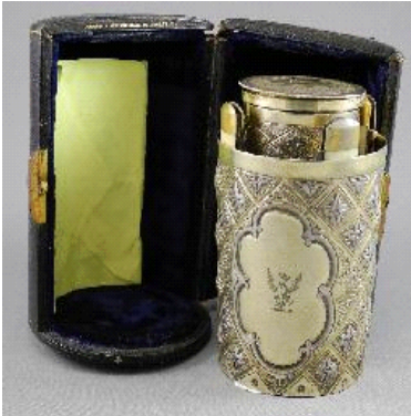
Lot # 212

211 Two cranberry glass items. $15 - $30