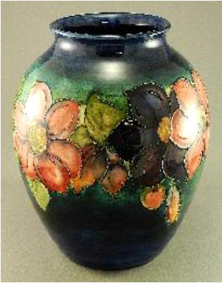
Lot # 240