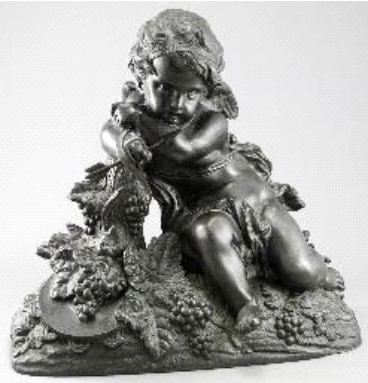
Lot # 214