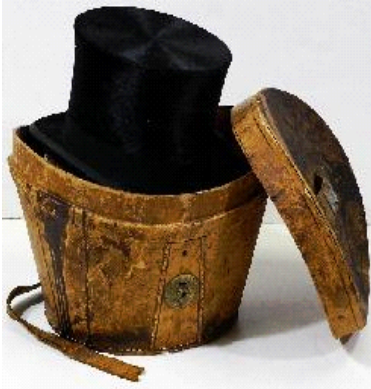
Lot # 184