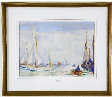
Lot # 255

254 Oil on board bearing initials R.L., 8 1/2" x 12 1/2", "Still Life". $75 - $125