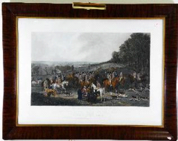
Lot # 264