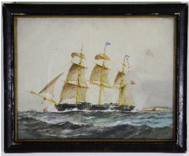
Lot # 271

271 Watercolour signed J. Hardcastle dated 1938, 6 1/2 in. x 9 in., "Sail Ship Off Coast". $75 - $150