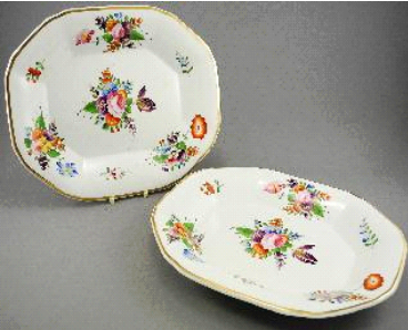
Lot # 209