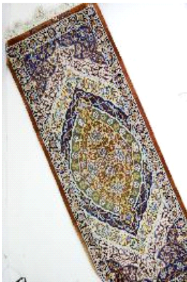
Lot # 1

1 Good quality Indo-Persian silk table runner signed at end, approx.43 in. x 16 in.