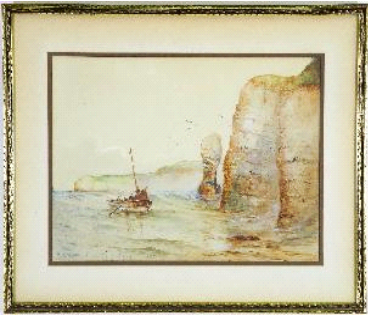
Lot # 105