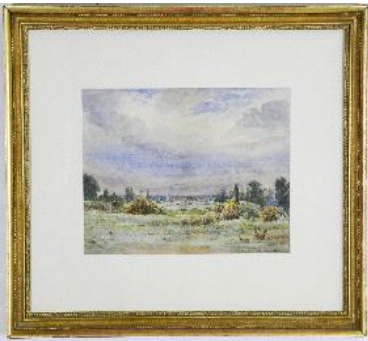
Lot # 111