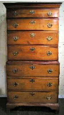
Lot # 205