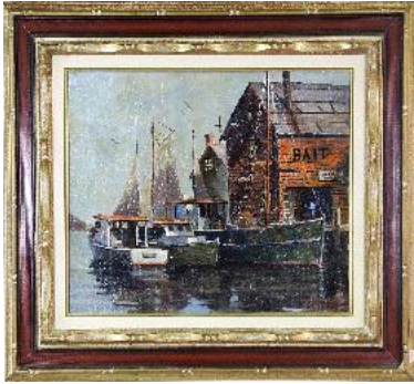
Lot # 91