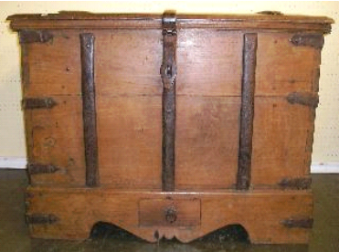
Lot # 244