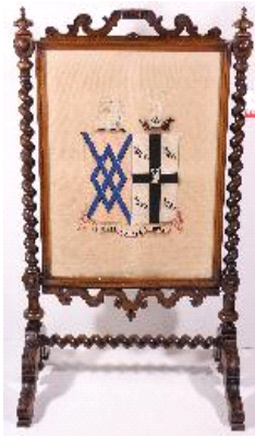
Lot # 246

246 Mid Victorian carved walnut fire screen decorated with the Baron of Cheylesmore coat of arms. $200 - $300