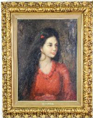
Lot # 220