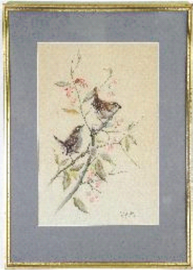
Lot # 45