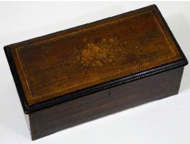
Lot # 178