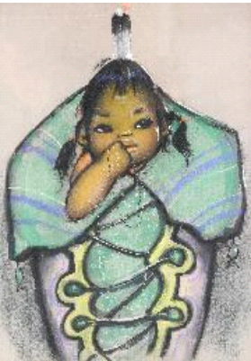
Lot # 35

34 Pastel signed Christofferson, 23 1/2 in. x 17 1/2 in., "Girl with Red Hair". $100 - $150