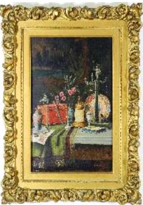
Lot # 13

13 Oil on board signed Brunck, 12 1/2" x 8 1/4", "Stillife".