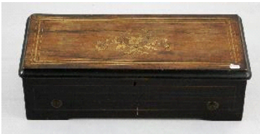
Lot # 172