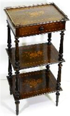
Lot # 275

274 Hanging brass lamp-San Francisco. $50 - $100