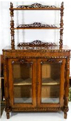
Lot # 277

277 Mid Victorian burl walnut side cabinet.