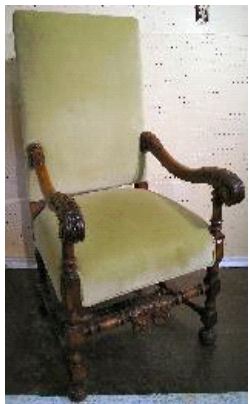
Lot # 279

279 Upholstered carved oak open armchair.