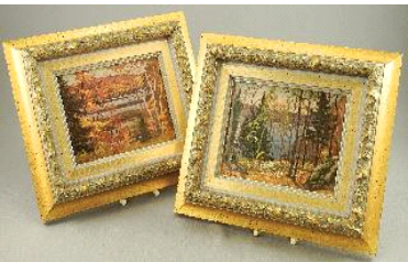
Lot # 19