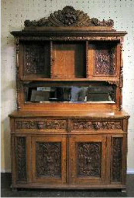
Lot # 142