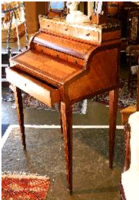
Lot # 232