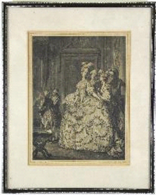
Lot # 156