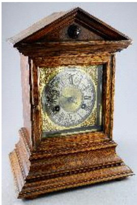
Lot # 217