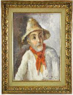
Lot # 140