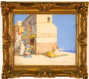
Lot # 125