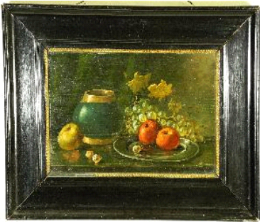
Lot # 254

254 Oil on board bearing initials R.L., 8 1/2" x 12 1/2", "Still Life". $75 - $125