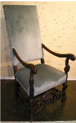
Lot # 278

278 Carved oak upholstered open armchair.