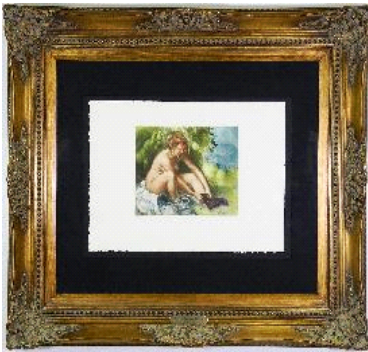
Lot # 103