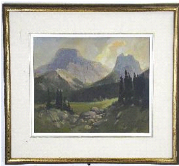
Lot # 54

54 Oil on canvas signed Meredith Evans (RK 79), 14 in. x 18 in. "Mt.Lougheed". $150 - $300