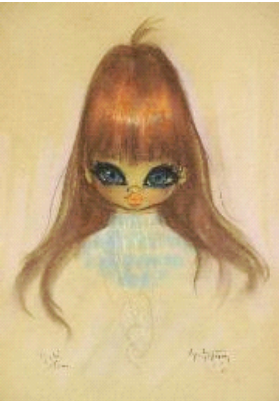
Lot # 34