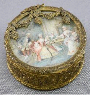
Lot # 190