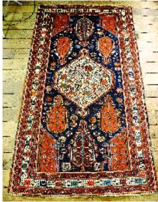
Lot # 281

280 Flight Barr & Barr Worcester "Strawberry Leaf Pattern" china part dinnerware service. $1,000 - $1,500