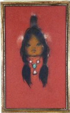
Lot # 43