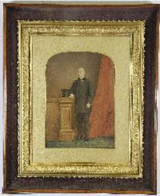
Lot # 272

271 Watercolour signed J. Hardcastle dated 1938, 6 1/2 in. x 9 in., "Sail Ship Off Coast". $75 - $150