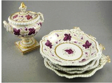
Lot # 280

280 Flight Barr & Barr Worcester "Strawberry Leaf Pattern" china part dinnerware service. $1,000 - $1,500