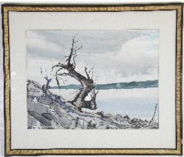
Lot # 206