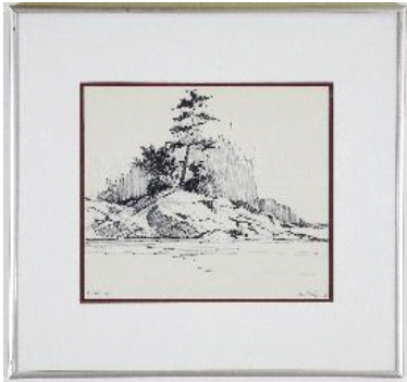
Lot # 93