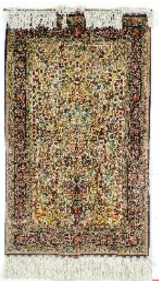
Lot # 180