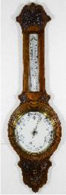
Lot # 242