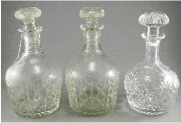
Lot # 169