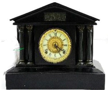
Lot # 117