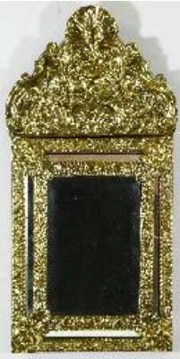
Lot # 263