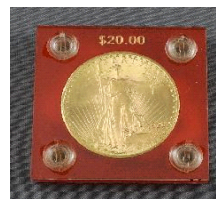
Lot # 769