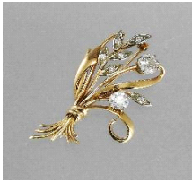
Lot # 418