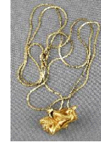
Lot # 471