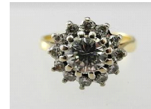
Lot # 434