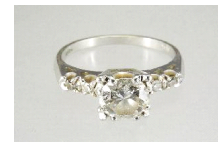
Lot # 513