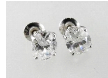
Lot # 412