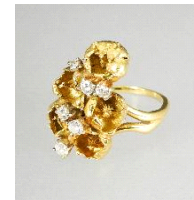
Lot # 435