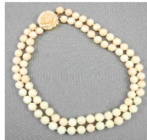
Lot # 440