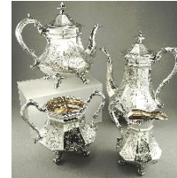
Lot # 445