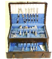
Lot # 449