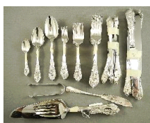
Lot # 761