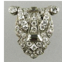
Lot # 433