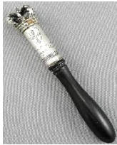
Lot # 483