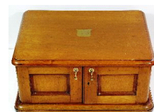
Lot # 725