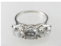
Lot # 411