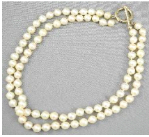
Lot # 454