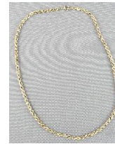
Lot # 500