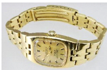
Lot # 821

820 Ladies Cartier "Santos" wrist watch. $700 - $900