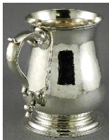
Lot # 426