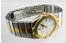
Lot # 818

817 Tiffany Baume & Mercier wrist watch. $400 - $450