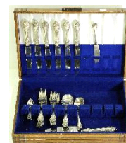
Lot # 604