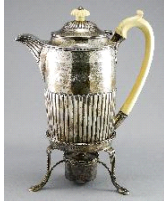
Lot # 402