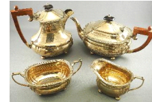
Lot # 591