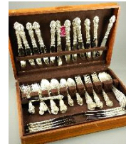
Lot # 444