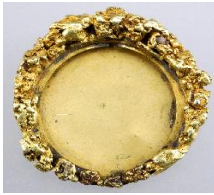
Lot # 773