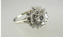
Lot # 419