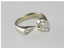
Lot # 459