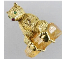
Lot # 431