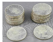
Lot # 764