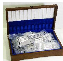
Lot # 763