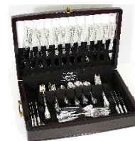
Lot # 641