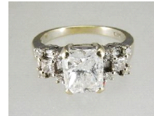
Lot # 413