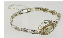
Lot # 805