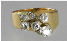
Lot # 458