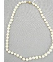
Lot # 475