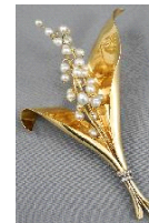
Lot # 417