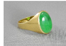
Lot # 416