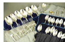
Lot # 633