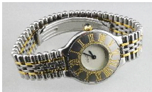
Lot # 820

819 Longines 14kt. white gold and diamond "mystery hand" wrist watch. $500 - $1,000