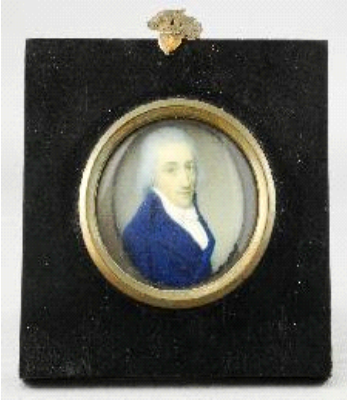
Lot # 247