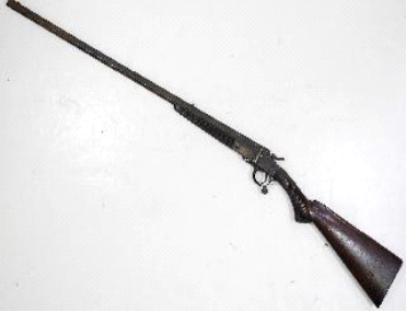
Lot # 106