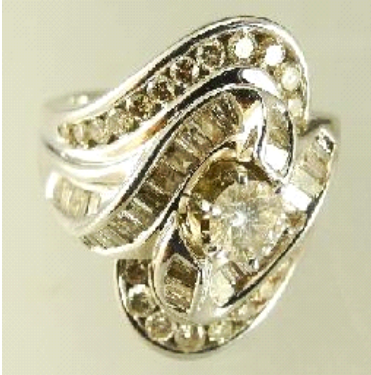
Lot # 27