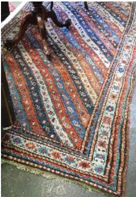
Lot # 237