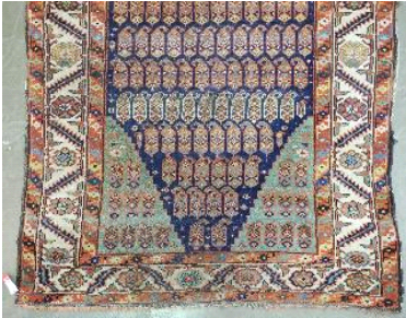
Lot # 116