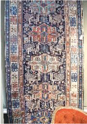
Lot # 239