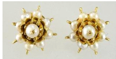
Lot # 22