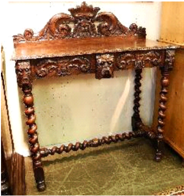
Lot # 187