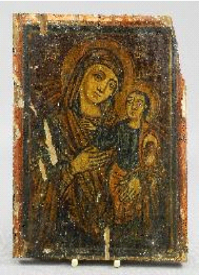
Lot # 278

278 Greek polychrome painted gesso icon, 8 3/4in. x 6 3/4in.