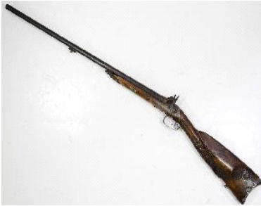
Lot # 103