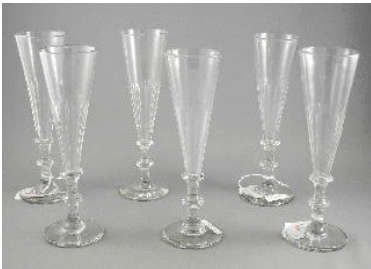
Lot # 280