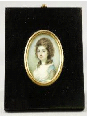
Lot # 249