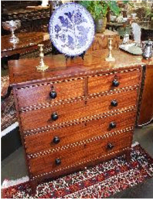
Lot # 243