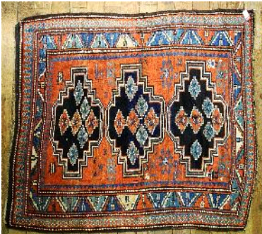
Lot # 274