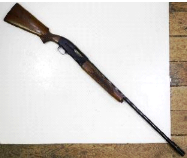
Lot # 114

114 Winchester model 50 twelve gauge shotgun.