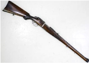
Lot # 109