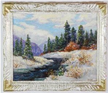
Lot # 45

44 19th. century butternut chest of drawers. $50 - $100