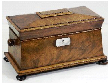
Lot # 265