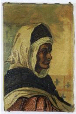
Lot # 135