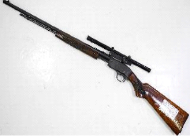
Lot # 107