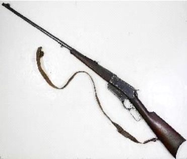
Lot # 105