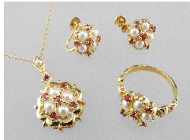
Lot # 21