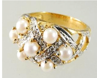
Lot # 20