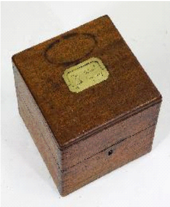
Lot # 204