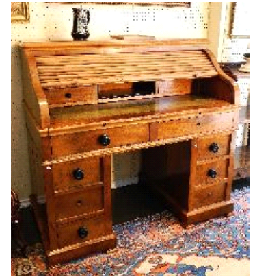
Lot # 310