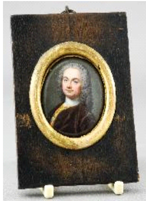
Lot # 251