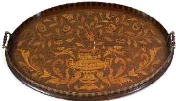
Lot # 98