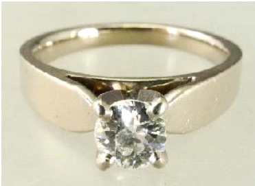
Lot # 28