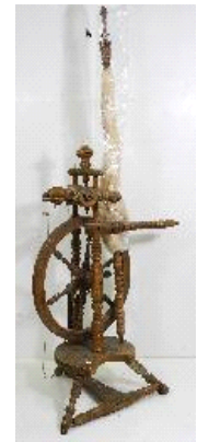
Lot # 80