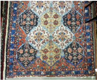
Lot # 93