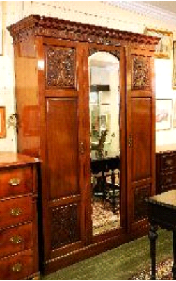
Lot # 172