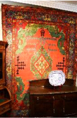
Lot # 227

227 Turkish carpet, approx. 9'4" x 6'9".