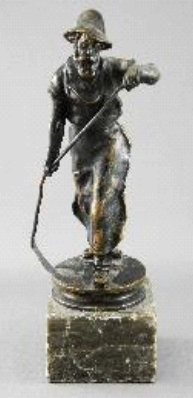
Lot # 279

279 Bronze mounted on stone base, height 7 1/2 in., "Farmer with Scythe".