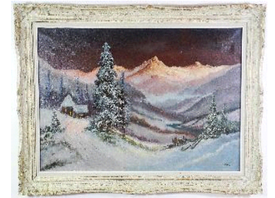
Lot # 79