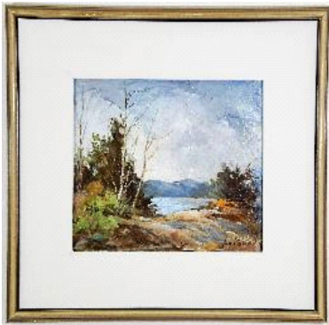
Lot # 139