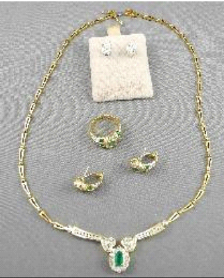
Lot # 33