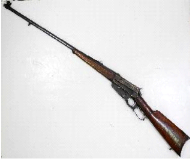
Lot # 104