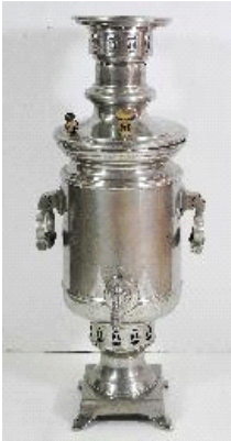
Lot # 117