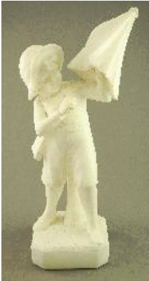
Lot # 246