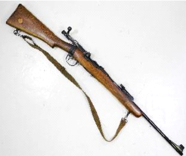
Lot # 110