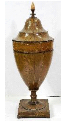
Lot # 311