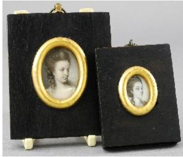
Lot # 250