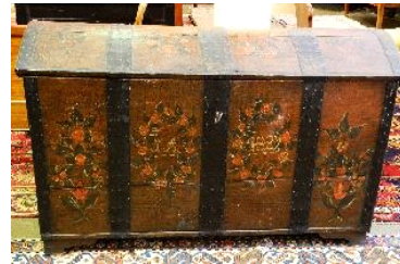
Lot # 76