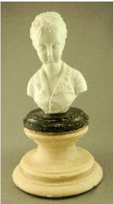
Lot # 298