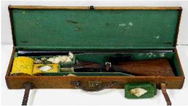
Lot # 108

108 Alex Martin double barrel shotgun in a fitted case.