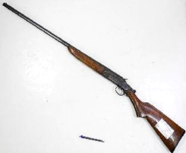
Lot # 111

111 Iver Johnson's 20 gauge Champion shotgun.