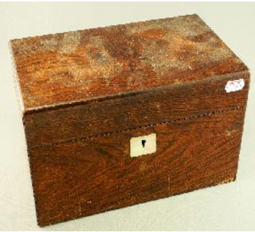
Lot # 213