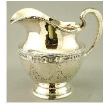
Lot # 430