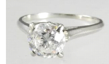
Lot # 414