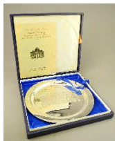
Lot # 685