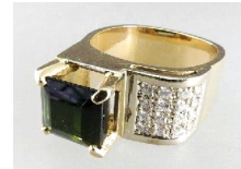
Lot # 452