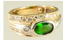
Lot # 503