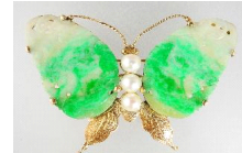
Lot # 500