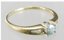
Lot # 492