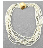
Lot # 472