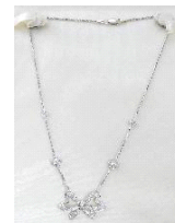
Lot # 475