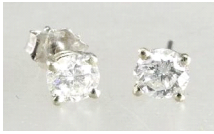
Lot # 419