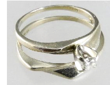
Lot # 535