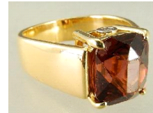
Lot # 433