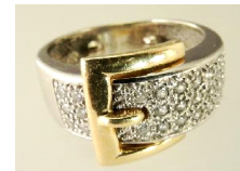
Lot # 540B