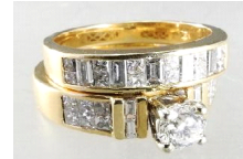
Lot # 431