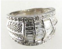
Lot # 420