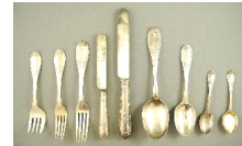
Lot # 448