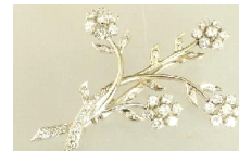
Lot # 453