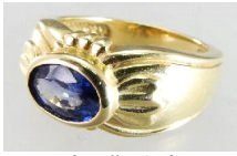
Lot # 510A