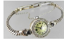
Lot # 499