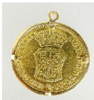
Lot # 439