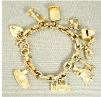
Lot # 437