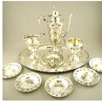
Lot # 401