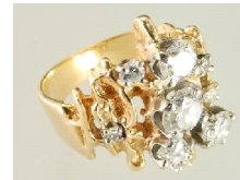
Lot # 418