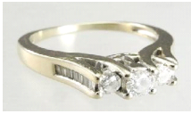
Lot # 436