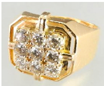
Lot # 411