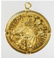
Lot # 440