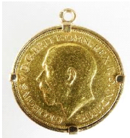
Lot # 438