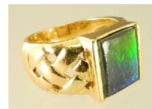
Lot # 505