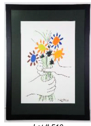
Lot # 510 510 Lithograph after Pablo Picasso, 25" x 18", "Hands with Flowers". $250 - $500