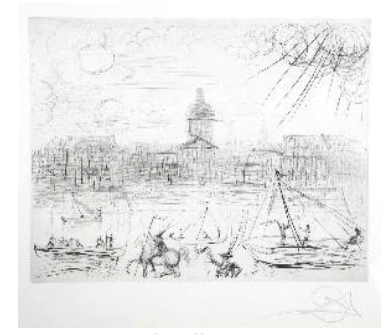
Lot # 569 569 Print signed Dali, 20" x 25", "Academy of France".