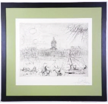
Lot # 694 694 Print signed Dali, 20" x 25", "Academy of France".