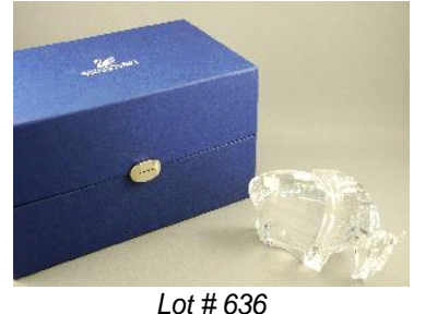
636 Swarovski crystal bison with box, length 6".