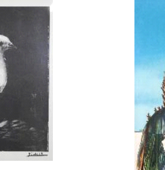
Lot # 568 568 Print after Picasso, 30" x 24", "La Colombe (The Dove)". $200 - $300