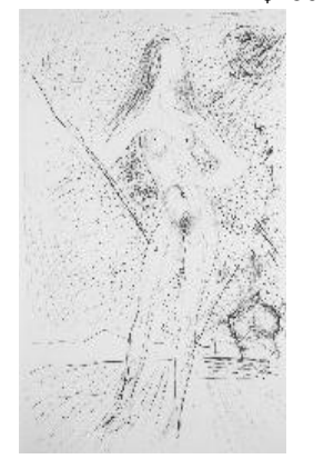
Lot # 549 549 Print signed Dali, 30" x 22", "Venus of the Constellation with Picador". $200 - $300

548 Mixed media signed Amy Ainbinder, 26" x 40", "Screaming Scull". $150 - $250