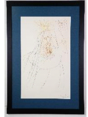
Lot # 508 508 Colour print signed Dali, 24" x 16", "King David".