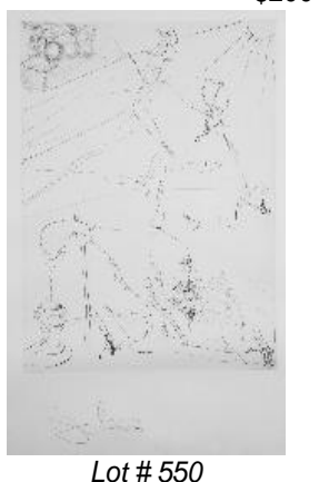
550 Print after Dali, 30" x 22 1/2", "L'alchimiste".

$200 - $300 551 Framed print after J.A. Rixens, 9" x 10", "The Body of Ceaser". $25 - $50 552 Swarovski crystal swan in box, length 3 1/2".