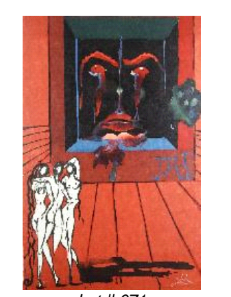
Lot # 671 671 Colour print signed Dali, 22" x 30", "Visions Surrealiste Obsession of the Heart".