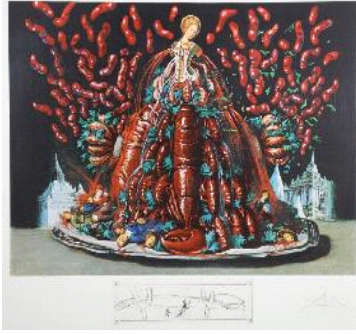
Lot # 572 572 Colour print signed Dali, 29 1/2" x 22", "Les Diners de Les Canibalismes de L'automne Lobster". $200 - $300