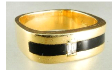
Lot # 437