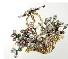
Lot # 417