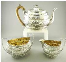
Lot # 403