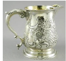
Lot # 404