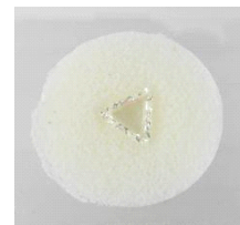
Lot # 479