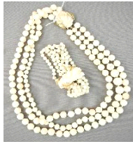
Lot # 438