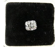
Lot # 412