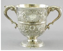
Lot # 402