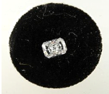
Lot # 419