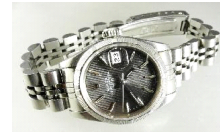
Lot # 618