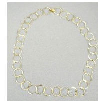
Lot # 596