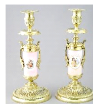
Lot # 501