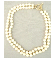
Lot # 460