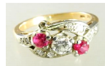
Lot # 511