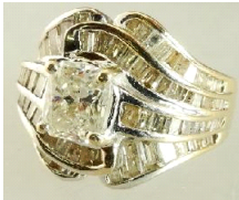
Lot # 420