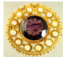
Lot # 414