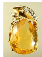
Lot # 416