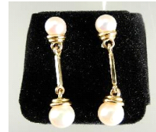
Lot # 432