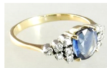
Lot # 474