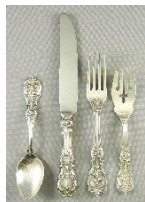
Lot # 470