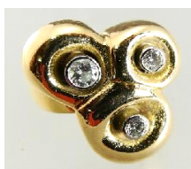
Lot # 493