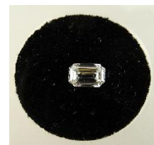
Lot # 476