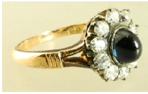
Lot # 559