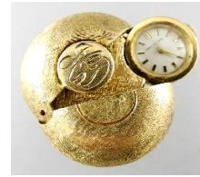
Lot # 617