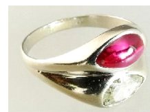
Lot # 552