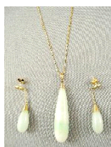
Lot # 491