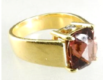
Lot # 439