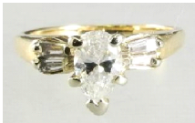
Lot # 440