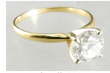
Lot # 411