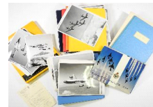
Lot # 452

452 Large collection of aviation photographs including various aerobatic teams.