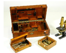
Lot # 451

451 19th. century mahogany cased microscope with optics case marked Andrew Baird-Edinburgh.