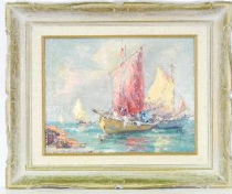
Lot # 467