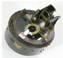
Lot # 411