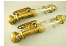
Lot # 421