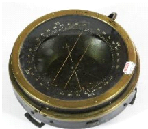
Lot # 410