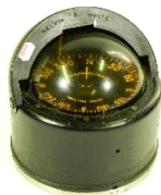
Lot # 440

440 Danforth & White celestial compass CB 1643.