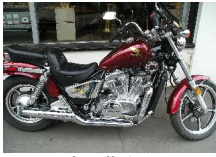
Lot # 401