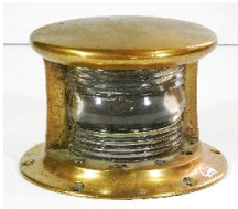
Lot # 408