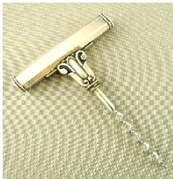
Lot # 406