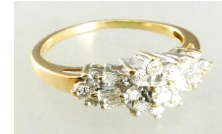
Lot # 442