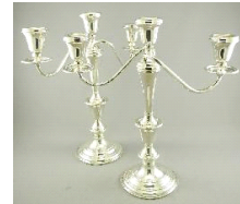
Lot # 410