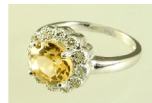
Lot # 509