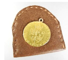
Lot # 747