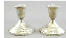
Lot # 440