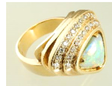
Lot # 413