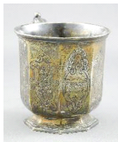
Lot # 436