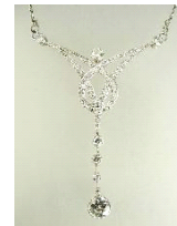
Lot # 412