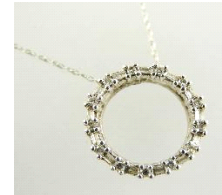
Lot # 447