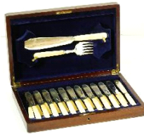
Lot # 435