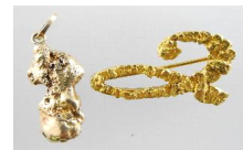
Lot # 478