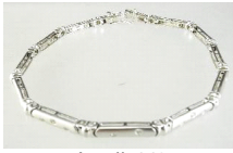
Lot # 448