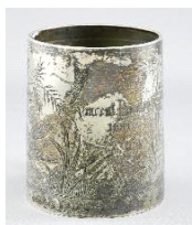
Lot # 485