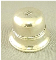
Lot # 418