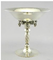
Lot # 405