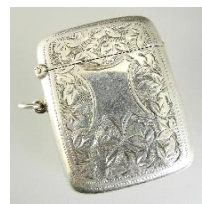
Lot # 549