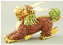
Lot # 404