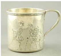
Lot # 573

572 Two sterling coffee spoons and a napkin ring. $40 - $60