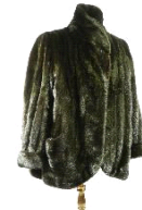
Lot # 421