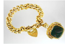
Lot # 411