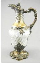
Lot # 433