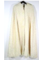
Lot # 428