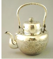
Lot # 403