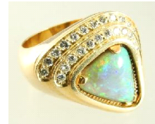
Lot # 414