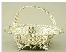
Lot # 489