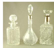
Lot # 511