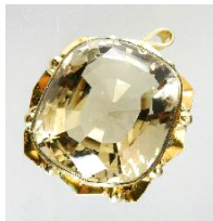
Lot # 419