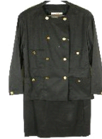
Lot # 425