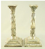
Lot # 434