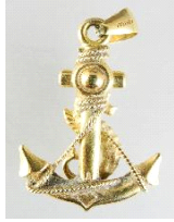
Lot # 415