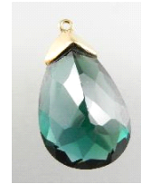
Lot # 443