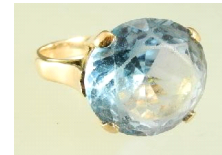
Lot # 445