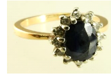
Lot # 441