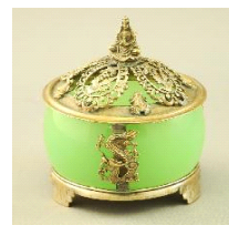
Lot # 550