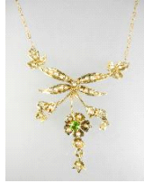
Lot # 416