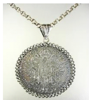
Lot # 538