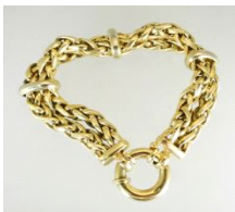
Lot # 475