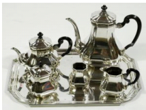
Lot # 423

422 19th century silver plate church sanctuary lamp. $200 - $300