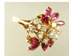
Lot # 539