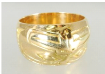
Lot # 477