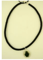
Lot # 497