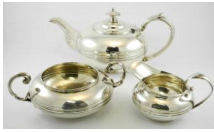
Lot # 401