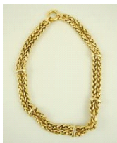
Lot # 474