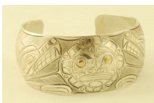
Lot # 476