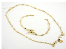
Lot # 598