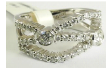
Lot # 434

433 Yellow gold ruby and diamond ring. $200 - $300