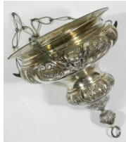
Lot # 422

421 Birks Sterling silver ten piece dresser set. $125 - $175