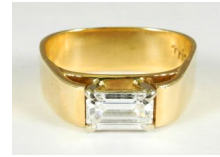
Lot # 412