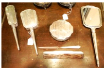
Lot # 429

428 Gorham Sterling silver candelabrum with glass shades. $40 - $60