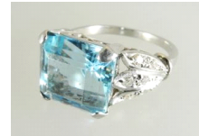
Lot # 414