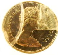
Lot # 719