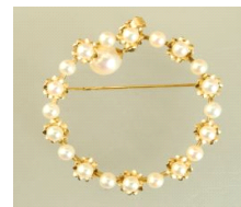
Lot # 455