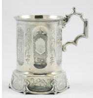
Lot # 402