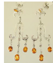
Lot # 416