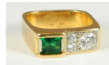
Lot # 460