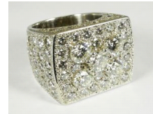
Lot # 415