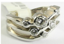
Lot # 471