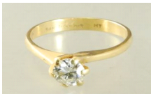
Lot # 453