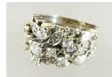
Lot # 457