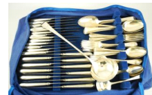
Lot # 441

440 Massive lemon quartz pendant. $50 - $100