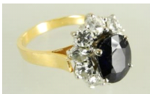
Lot # 454