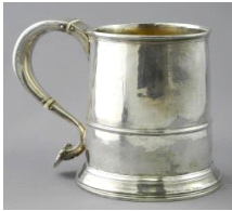
Lot # 405