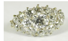
Lot # 418