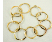
Lot # 571