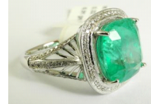
Lot # 413