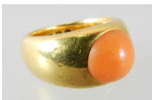
Lot # 472