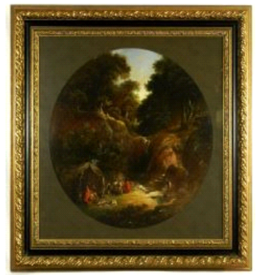
Lot # 29 29 Oil on canvas in manner of William Shayer, 18 3/4"x 18 3/4","Gypsy Encampment". $200 - $300