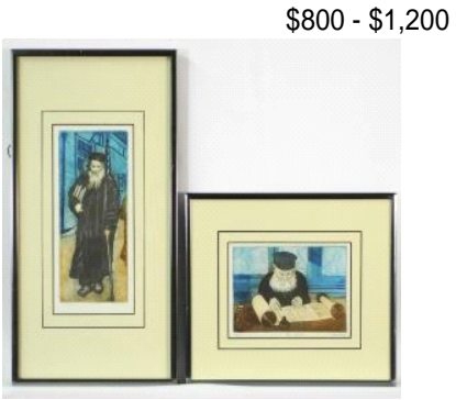
Lot # 110 110 Pair of coloured etchings signed Silverberg, 8" x 3 1/2", "Scholar" and "Scribe".