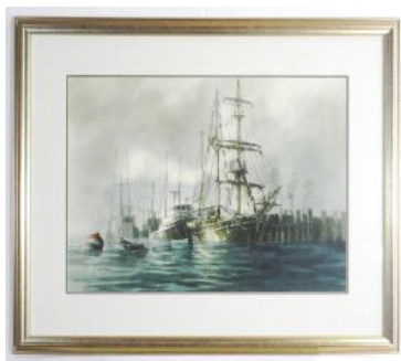
Lot # 90 90 Watercolour signed Heine, 20" x 28", "Our Swan Victoria Harbour".". $750 - $1,500

78 Oil on canvas signed H.(Helmut) Reuter, 17 1/2" x 35", "Seascape- Sail Boat on Sand".