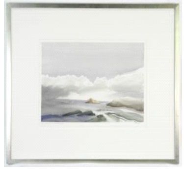
Lot #20 20 Watercolour signed (Toni) Onley d. 16 March 2003, 11" x 15", "Pine Inlet, B.C.".