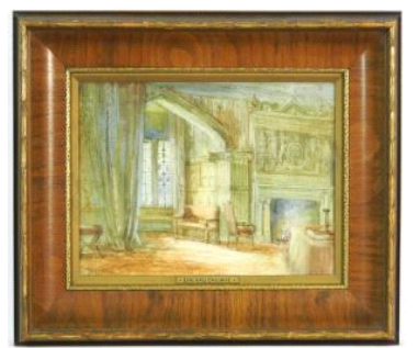
Lot # 120 120 Watercolour signed E.W. Trich, 7 1/2" x 11 3/4", "Lime Hall, Cheshire". $150 - $250