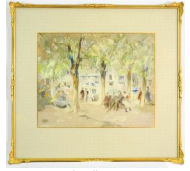
Lot # 114 114 Watercolour signed Edward F. Mcgrath 13" x 17 1/2", "Impressionist Park Scene".