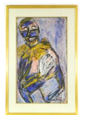
Lot # 96 96 Mixed media on paper indistinctly signed, 28"x18", "Abstract Figure". $100 - $200