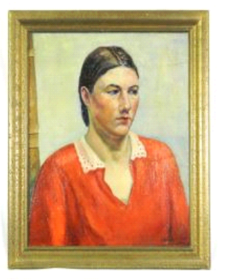
Lot # 81 81 Oil on panel signed G. Snider, "Girl in Red", 23" x 19". $100 - $200