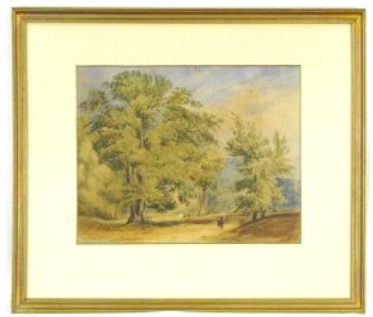
Lot # 146 146 Watercolour signed Copley Fielding, 10" x 14", "Pastoral Landscape". $500 - $1,000