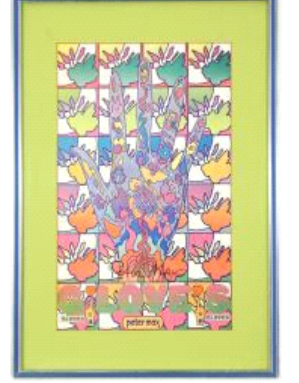
Lot # 149 149 Framed coloured print signed Peter Max 14 1/4" x 9 3/4", "Gloves". $100 - $150