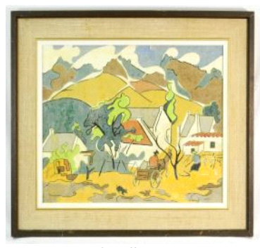
Lot # 115 115 Oil on canvas signed Townsend (William), 15 1/2" x 19 1/2", "Country Scene". $100 - $200