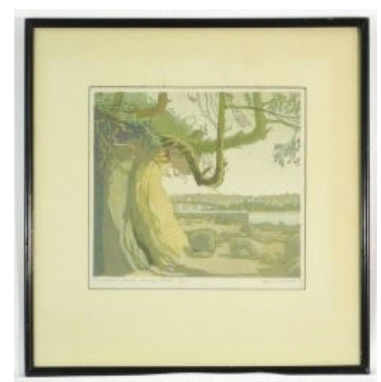
Lot # 103 103 Coloured ltd.ed. print signed Paul Goranson '36 numb.6/60, "Sandstone Banks,Stanley Park". $250 - $500