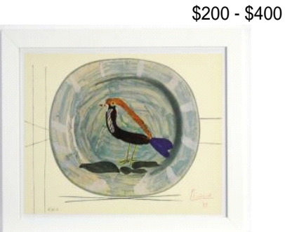
Lot # 154 154 Framed signed Picasso print marked verso Galerie Maeght, Paris, 11" x 15". $200 - $400