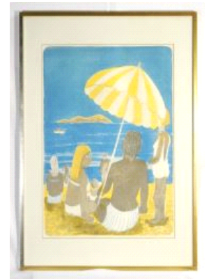
Lot # 9 9 Limited edition print signed John Snow numbered 5/50, 24" x 18", "Beach". $125 - $175