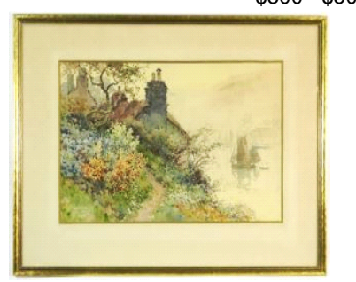
Lot # 48 48 Watercolour signed E.W. Haslehurst, 13" x 20", "Cottage and Lake". $200 - $300