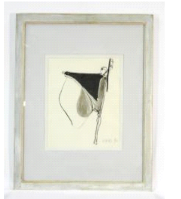
Lot # 87 87 Drawing signed Morris dated 1960, 11 1/2" x 10 1/2", "This Way". $150 - $300