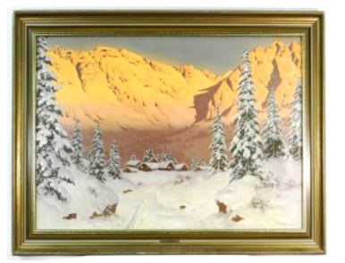
Lot # 28 28 Oil on canvas signed H. Barma, 24" x 36", "Austrian Mountain Scene" $600 - $800