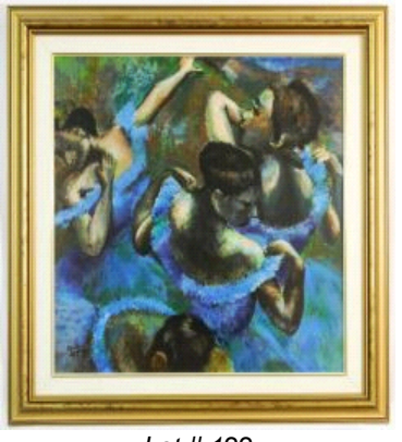
Lot # 122 122 Oil on board signed Giselle Lavoie, 20" x 20", "Dancers". $300 - $500