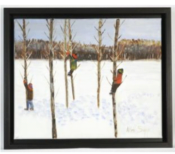
Lot # 22 22 Oil on canvas signed Allen Sapp, 12" x 16", "Climbing Trees".