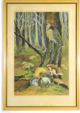
Lot # 69 69 Watercolor signed Isabell Hobbs, 26" x 19", "Bird on Stump with Frog". $100 - $150