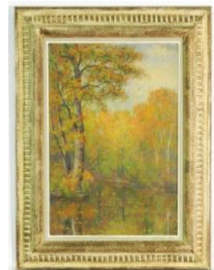
Lot # 105 105 Oil on board signed C.H. Sherman, 15 1/2" x 11 1/2", "Impressionist Woodland Scene".