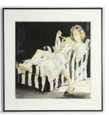
Lot # 107 107 Watercolour signed Giselle Lavoie, 16" x 16", "Woman on Lounge Chair". $150 - $300