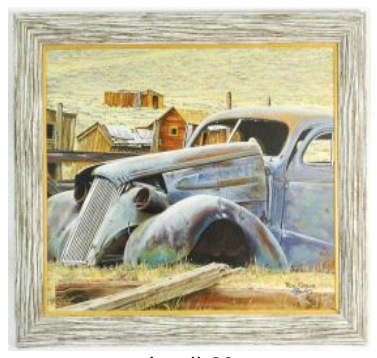
Lot # 63 63 Oil on canvas signed Ron Craig '97, 24" x 20", "Road Hard". $750 - $1,250