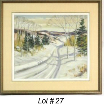
27 Oil on canvas signed S. Berne, 15 1/2" x 19 1/2", "Eastern Townships, QC". $200 - $400