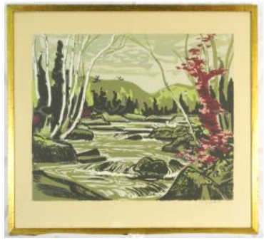
Lot # 51 51 Serigraph signed A.Y.Jackson,19 1/2" x 23 1/2", "The River". $150 - $300