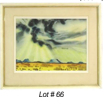
66 Watercolour signed Cheales, 11" x 16 1/2", "South Africa Scenery". $100 - $150