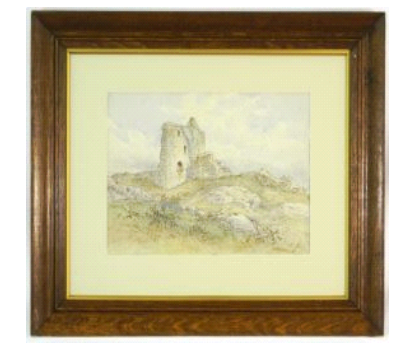
Lot # 131 131 Watercolour signed W.Brown dated 1878, 10" x 13 3/4", "Ruins". $300 - $500