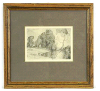
Lot # 17 17 Engraving signed L.L. Fitzgerald, 3 3/4" x 5 3/4", "Moonlit Landscape" $400 - $600