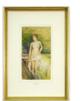
Lot # 4 2 42 Watercolour att. to John Absolon, 9 1/2" x 5 1/2", "Nude by the Lake". $500 - $750