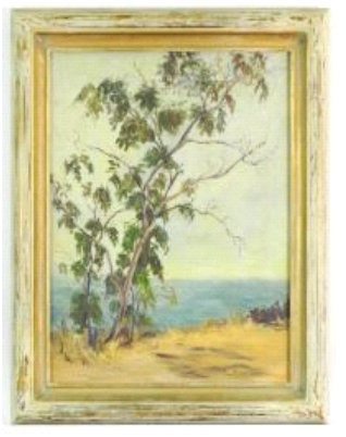
Lot # 139 139 Oil on canvas signed Jeanne Laurence 19 1/4" x 15 1/4", "Coastal Scene".