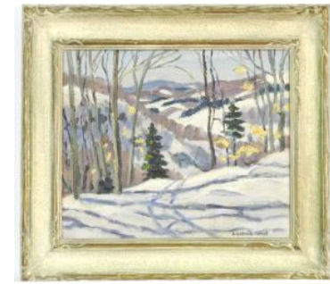
Lot # 15 15 Oil on board signed B. Galbraith-Cornell, 9" x 12", "On The Trail St. Sauveur".