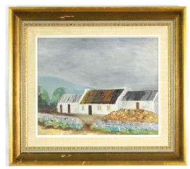
Lot # 104 104 Oil on board signed Miles (John), 10 1/2" x 14 1/2", "Port Noo, Northern Ireland".