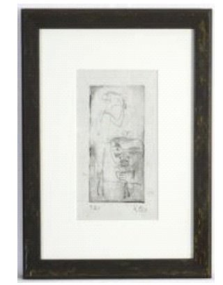
Lot # 68 68 Lithograph signed Klee 9/20, 7 1/2" x 4 1/2", "Abstract Figures". $250 - $500