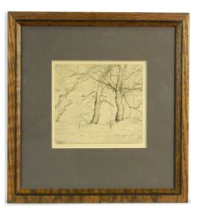
Lot # 18 18 Engraving signed L.L. Fitzgerald '26 4 3/4" x 5 1/2", "Winter Trees". $400 - $600