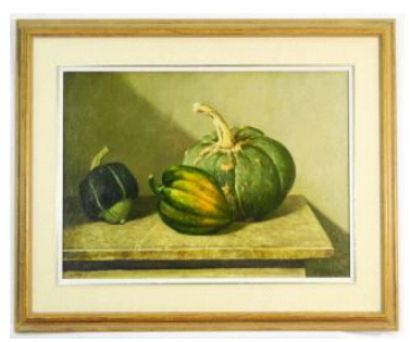
Lot # 5 5 Oil on board signed G. Rock dated 1987, 16" x 24", "The Hubbard Squash and Others".