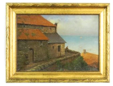
Lot # 14 14 Oil on canvas signed A.M. Fleming 1897, 9 1/2" x 15 1/2", "Coastal Scene".