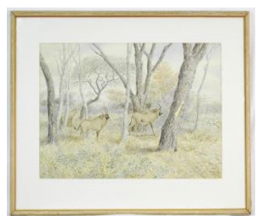
Lot # 136 136 Watercolour signed (Jeffrey) Huntly 15" x 22", "Roan Antelopes". $750 - $1,250