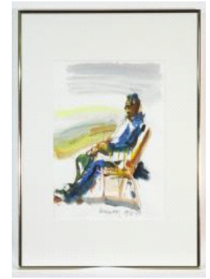
Lot # 85 85 Watercolour signed Gordaneer dated 19/11/03, 13 1/4" x 10 1/4", "Man in Chair".

Lot # 84 84 Watercolour signed Owen Goward, 11" x 17 3/4", "Gary Oak in Garden". $175 - $225