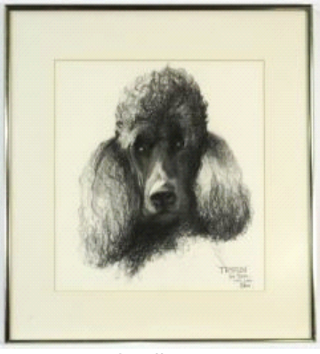
Lot # 125 125 Charcoal drawing by Myfanwy Pavelic dedicated for Tessa, 13" x 13", "Tamson".