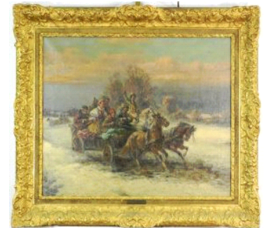
Lot # 30 30 Oil on canvas signed L.Viorsky, 20" x 26", "Winter Carriage Ride". $300 - $500