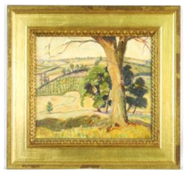
Lot #25 25 Oil on board signed J.M., 8 1/4" x 10", "Eastern Canadian Landscape- Tree with Rolling Hills". $2,000 - $3,000