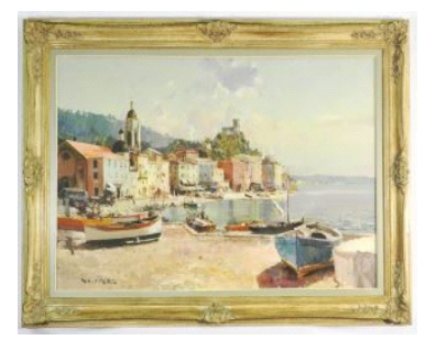
Lot # 144 144 Oil on canvas signed Neippere, 24" x 36", "Portofino Italy". $250 - $500