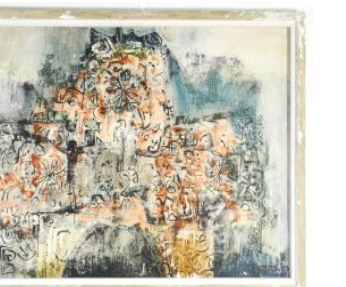
Lot # 116 116 Mixed medium signed Flemming Jorgensen dated '63, 23" x 32", "Cathedral". $250 - $500