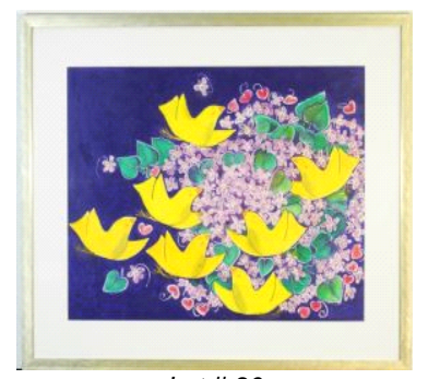
Lot # 86 86 Pastel attributed to Wendy Picken, 18 1/2" x 24", "Untitled- Yellow Birds". $350 - $450