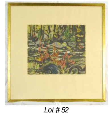
52 Serigraph signed A.Y.Jackson, 19 1/2" x 21 1/4", "Summer-Algoma". $150 - $300