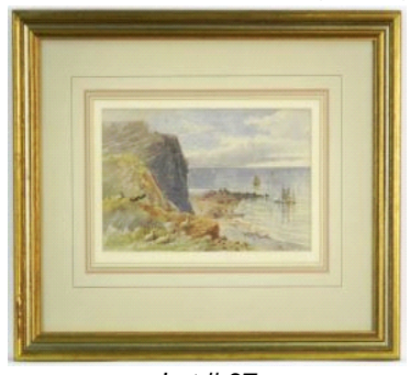
Lot # 37 37 Watercolour signed W.N.Cresswell dated 1885, 5 1/2" x 9", "Coastal Landscape with Sailboats".