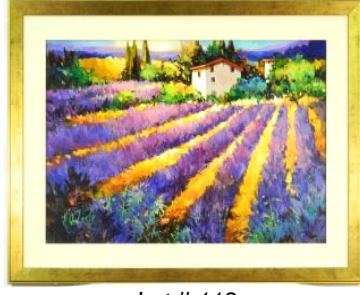
Lot # 118 118 Acrylic on canvas signed N. O' Toole, 19 3/4" x 29 1/2", "Lavender Fields of Tuscany".