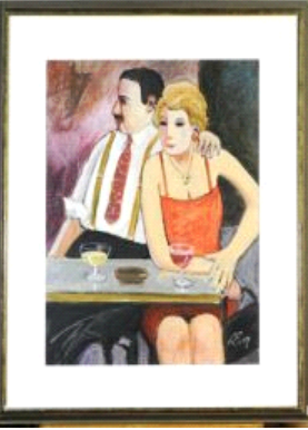
Lot # 75 75 Mixed media signed Evoy, 27" x 21", "Cocktails".