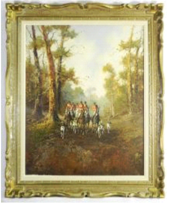
Lot # 108 108 Oil on canvas indistinctly signed, 30" x 26", "Riders in Red".