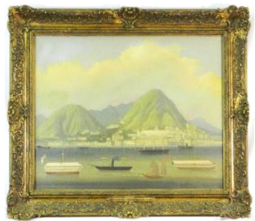
Lot # 47 47 Unsigned oil on canvas, 17 3/4" x 23 1/2", "The Hongs". $300 - $500