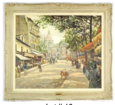
Lot # 16 16 Oil on board signed J. Giunta, 28" x 35", "Mont-Martre Paris '56". $400 - $600