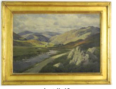
Lot # 43 43 Oil on canvas signed Geo. Melvin Rennie, 10" x 14", "Mountain Scene". $100 - $200