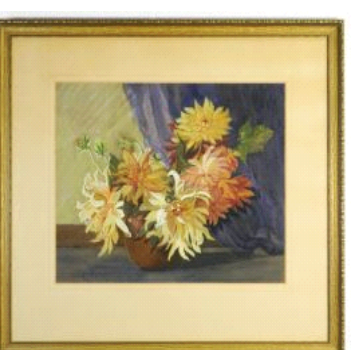
Lot # 113 113 Watercolour signed Isabell Hobbs, 17" x 21 1/2", "Flowers in a Bowl". $100 - $150