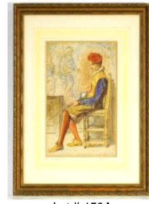
Lot # 150A 150A Watercolour att. to Edwin A. Abbey R.A., 9 3/4" x 6 1/2", "Mercutio". $250 - $500