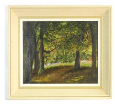
Lot # 142 142 Oil on board signed Rowland Hill, 10 1/2" x 13 1/2", "In The Cave Hill Estate".