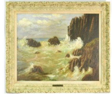
Lot # 117 117 Oil on board attr. to Arthur Ambrose McEvoy, 17 1/2" x 23 1/2", "Land's End, Cornwall".