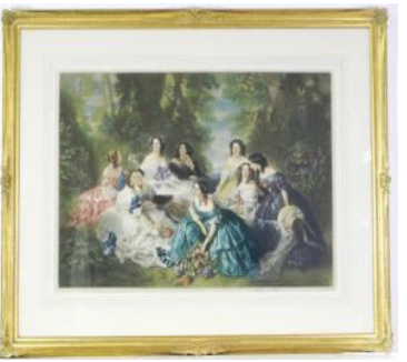
Lot # 64 64 Coloured print signed Arthur L. Cox, 19" x26", "The Empress Eugenie and Her Maids of Honour". $100 - $200