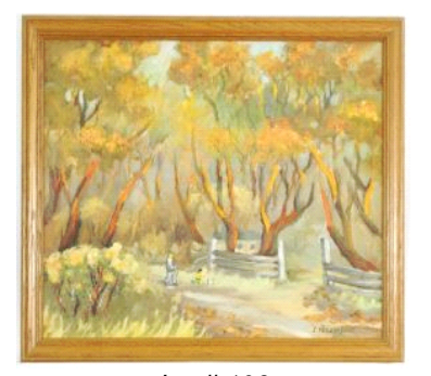
Lot # 106 106 Oil on canvas signed S.Petley-Jones, 15 1/2" x 19 1/2","Autumn Landscape- Walking the Dog". $100 - $150