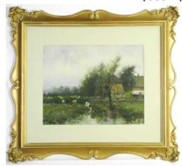
Lot # 31 31 Watercolour signed Alme Meyvis, 12" x 17", "Cows Watering". $250 - $500