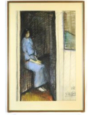
Lot # 74 74 Oil pastel signed J. Wilkinson 8.8.65, 27 1/2" x 20", "Lady Waiting". $100 - $200