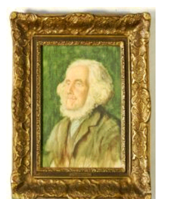
Lot #26 26 Watercolour attr. to M.A. Suzor- Cote, 12" x 8 1/2", "Portrait of a Bearded Man".