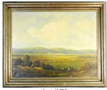
Lot # 70 70 Large oil on canvas signed Ernst Pfaender dated 1944, 27" x 39", "European Farm Landscape".