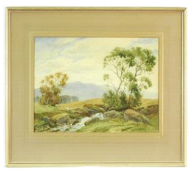
Lot # 55 55 Watercolour signed Percy Lancaster, 9 1/2" x 13 1/2", Landscape with Stream".