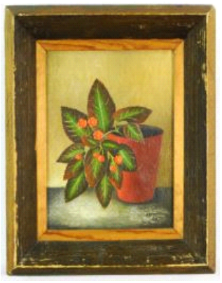
Lot # 99 99 Oil on canvas signed Papsdorf '59, 10" x 8", "Still Life".