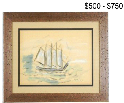
Lot # 56 56 Gouache signed Marin dated '36, 8 3/4" x 13", "In Full Sail". $2,500 - $3,500