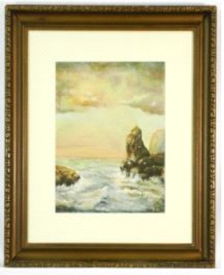
Lot # 133 133 Oil on art board signed P. Graham dated 1872, 12 1/4" x 9 3/4", "Sea Birds on Rocky Shore" $1,000 - $1,500