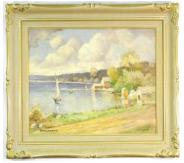
Lot # 8 8 Oil on canvas signed Frank Panabaker, 17 1'2" x 23 1/2", "At Tobermory". $2,500 - $3,500