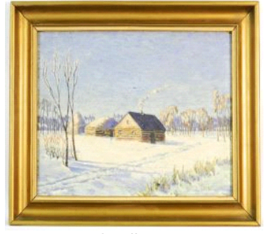
Lot # 126 126 Oil on board unsigned, 10 1/2" x 14" "Winter Farm Scene". $100 - $200