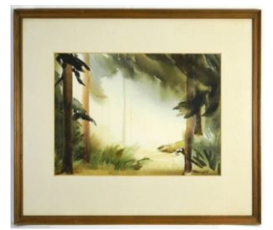
Lot # 119 119 Watercolour signed Stephanie Steele dated '68, 13 1/2" x 20","Woodpath". $100 - $150