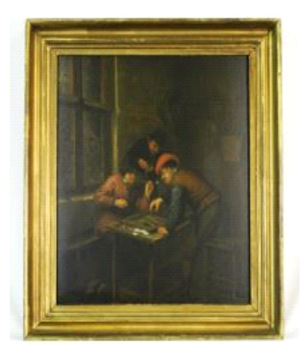
Lot # 44 44 Oil on panel in the manner of A. van Ostade, 13 3/4" x 11 3/4", "Playing Backgammon in Tavern". $3,000 - $5,000