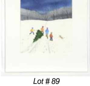
89 Framed watercolour signed Ann Blades "Taking the Christmas Tree Home" d. 1982 15" x 11 1/4". $100 - $200