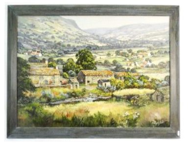
Lot # 112 112 Oil on canvas signed N. Gringefield, 19" x 29", "Countryside". $300 - $500