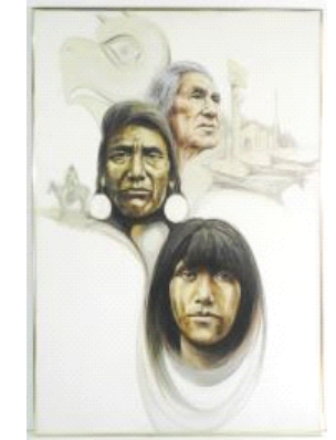
Lot # 54 54 Oil on canvas signed Ygartua (Paul) 1984, First Nations, 35 1/2 x 47 1/2 $200 - $400