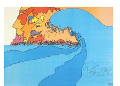
Lot # 148 148 Framed coloured print signed Peter Max, 21 1/2" x 33" "City Wave". $300 - $500