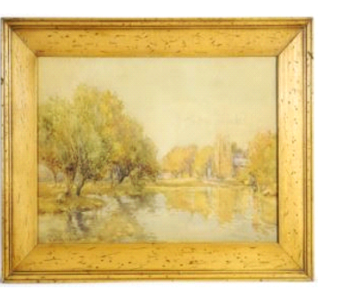
Lot # 121 121 Watercolour signed J.W. Milliken, 9 1/2" x 13 1/2", "Abbey by the Lake". $100 - $150