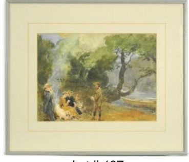
Lot # 137 137 Watercolour signed John Absolon, 6 1/2" x 9 3/4", "Picnic by the River". $150 - $300