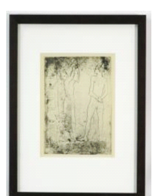
Lot # 72 72 Early lithograph signed in image Picasso dated 1905, "Harlequin and Washer Woman". $250 - $350