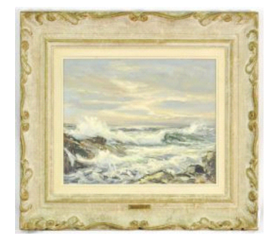
Lot # 138 138 Oil on masonite signed J.Giunta, 12" x 16", "The Surf and the Ocean, Atlantic Coast".