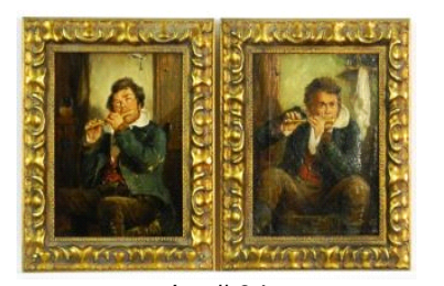
Lot # 34 34 Pair of oils on canvas in the manner of Nicol Erskine, 9 1/8" x 7 1/8", "Musicians".