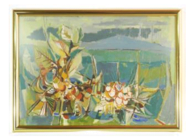
Lot # 129 129 Oil on board signed J. Korner. 13" x 1/2", "Abstract Still Life by Water". $100 - $150