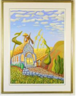
Lot # 135 135 Oil painting signed B J Hewett, 11/98, 29 1/2" x 23 1/2", "Sunny Sunday".