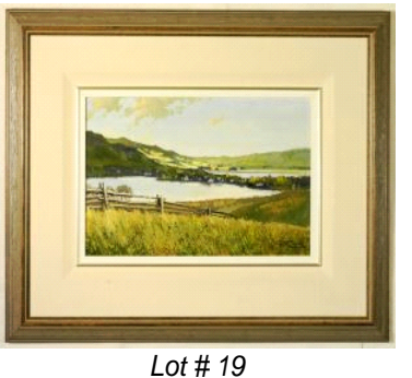
19 Oil on board signed G. Rock, 9" x 14", "The Home Ranch- Douglas Lake". $200 - $400