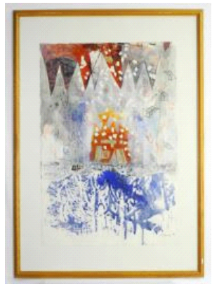
Lot # 109 109 Series of 6 mixed media on paper landscapes, "Whistler Series", 22 1/2" x 29 1/2".