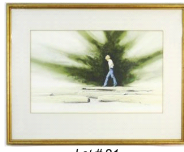
Lot # 21 21 Watercolour signed Keith Hiscock 26" x 14", "Log Walk".