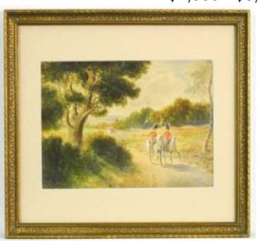
Lot # 41 41 Watercolour signed C. Clark '97, 6" x 9", "Royal Horse Guard". $400 - $600