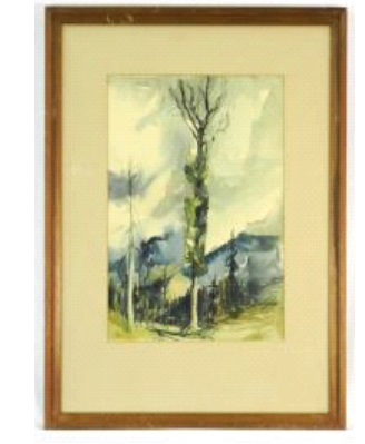
Lot # 80 80 Watercolour signed Sylvia McIntosh dated '55, 14 1/4" x 10 1/4", "Cottonwood".