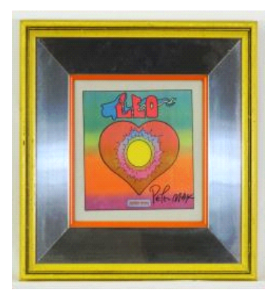
Lot # 151 151 Framed coloured print signed Peter Max, 7 1/4" x 7 1/4", "Leo". $150 - $250