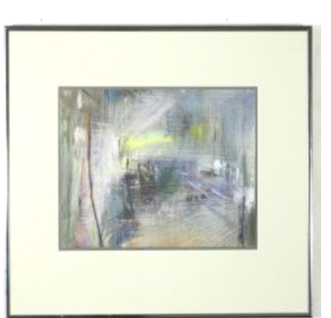
Lot # 88 88 Pastel signed Brad Passuti '87, 6" x 9", "Light Study'.