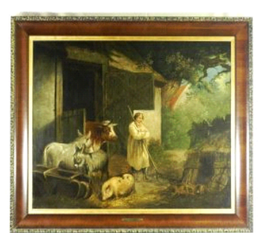
Lot # 49 49 Oil on canvas att. to George Morland, 27" x 35 1/2", "Barnyard Scene. $500 - $750