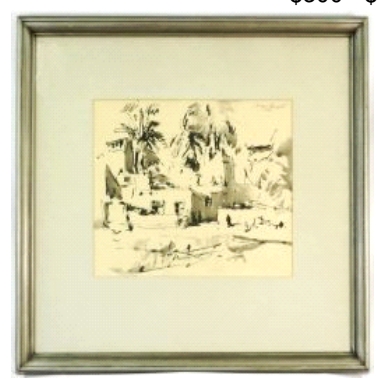
Lot # 60 60 Ink and wash signed Sergei Bongart dated on back 1970, 13" x 16", Karnak-Egypt". $1,000 - $1,500