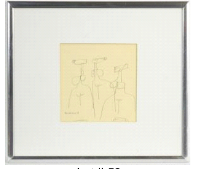
Lot # 58 58 Ink drawing signed (Herbert) Siebner 4" x 4 3/8", "Femmes". $100 - $150