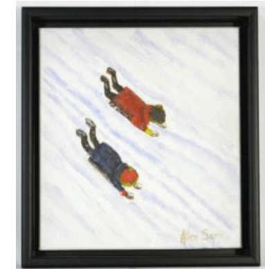
Lot # 23 23 Oil on canvas signed Allen Sapp, 12" x 12", "Tobogganing".