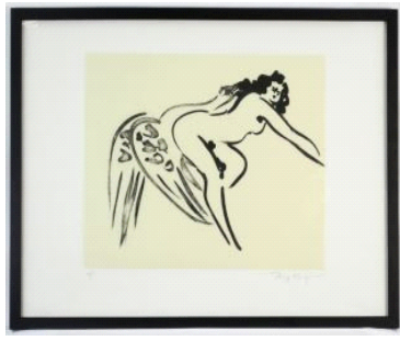
Lot # 94 94 Limited edition print signed (Reuben) Nakian numbered 2/11, "Leda and the Swan".