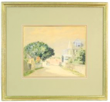
Lot # 147 147 Watercolour signed E.J. Read, 10 1/4" x 13 1/2", "Nassau, Bahamas" $300 - $500