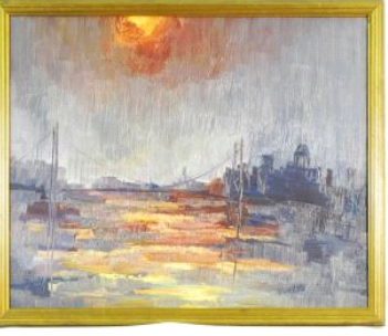
Lot # 102 102 Oil on board signed Rene Brugger, 17 1/4" x 23 1/4", "City Skyline". $300 - $400