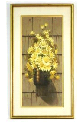
Lot # 97 97 Oil on canvas signed V.Santos dated '82, 24" x 12", "Bouquet of Golden Daisies".