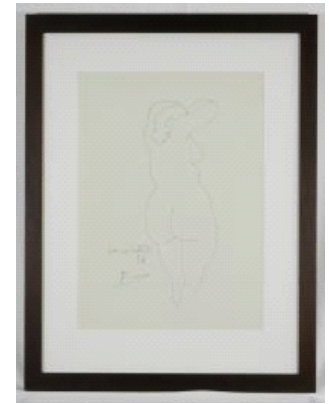
Lot # 73 73 Engraving signed Picasso dated '56, 17" x 14", "Clos du Nu". $350 - $450