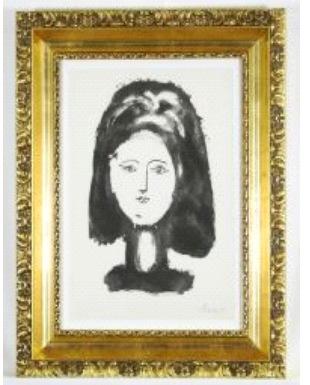
Lot # 71 71 Etching signed Picasso, 15" x 11", "Buste de Femme de Forc". $750 - $1,250