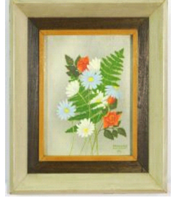
Lot # 100 100 Oil on canvas signed Papsdorf '66, 10" x 8", "Still Life".