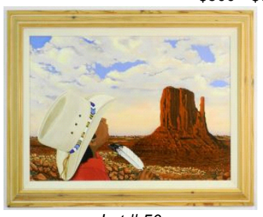
Lot # 50 50 Oil on canvas signed Ron Craig '94, 19" x 29", "Desert Sky". $750 - $1,000