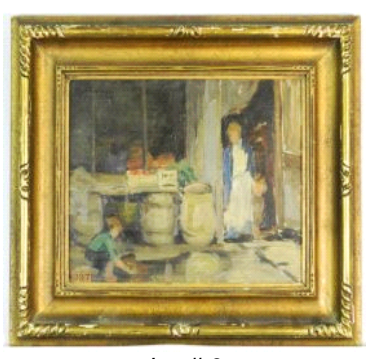
Lot # 3 3 Oil on panel signed Marion Long, 8 3/4" x 10 3/8", "The Ward".