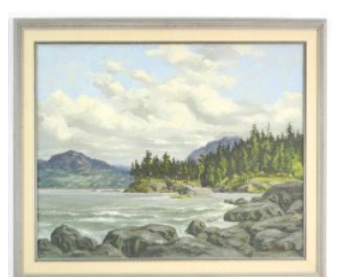
Lot # 127 127 Oil on canvas signed N. Denkman, 22" x 30", "Coastal Landscape".