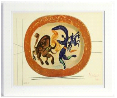
Lot # 153 153 Framed signed Picasso print marked verso Galerie Maeght, Paris, 11" x 15".