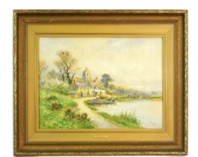
Lot # 59 59 Watercolour signed Stuart Lloyd, 20 1/2" x 30 1/2", "Country Scene". $300 - $500