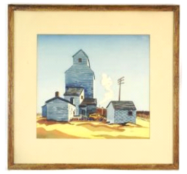
Lot # 1 1 Watercolour signed R.(Robert Newton) Hurley, 13 1/4" x 15 3/4", "Grain Elevators-Car".