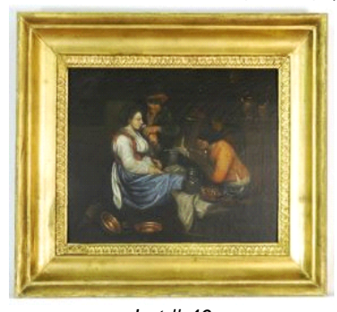
Lot # 46 46 Oil on panel in the manner of I. van Ostade, 6 1/2" x 8 3/4", "Tavern Scene".