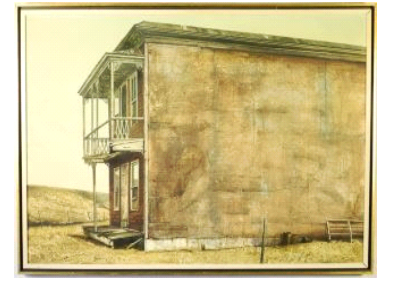
Lot # 4 4 Oil on board signed G. Rock 1969, 24" x 36", "St. Augustine".