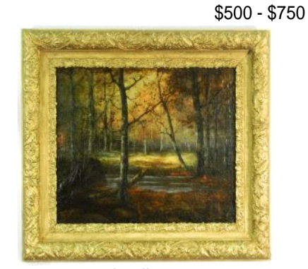
Lot # 143 143 Oil on canvas signed AAH Mikkelson, 15 1/4" x 19 1/2", "Woodland Scene". $100 - $200