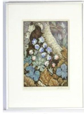
Lot # 123 123 Limited edition woodcut signed B. Rennie numbered 9/100, "Hepatica". $100 - $150