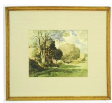
Lot # 79 79 Watercolour signed A.W. Rich, 9" x 12 1/2", "English Country Scene". $100 - $200