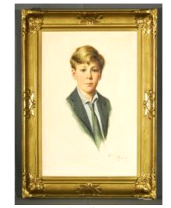
Lot # 98 98 Oil Painting on canvas signed Austin Shaw, 23" x 17", "Portrait of a Boy". $100 - $150