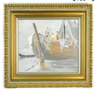
Lot # 130 130 Watercolour signed Montague, 15 1/2" x 19 1/2", "European Fishermen".