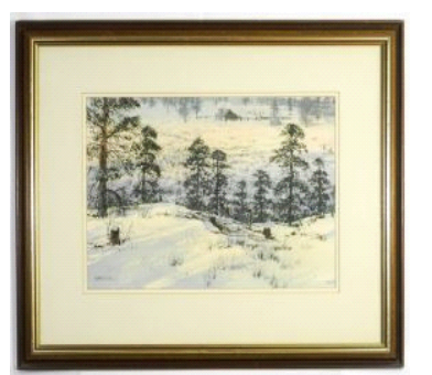
Lot # 65 65 Watercolour signed Marke K. Simmons, 14" x 20", "Winter Landscape with Cabin". $300 - $500