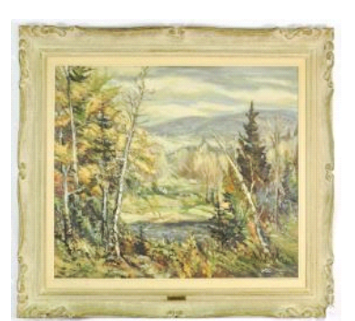
Lot # 10 10 Oil on masonite signed J.Giunta, 24" x 30", "Laurentian Fall Landscape". $150 - $300