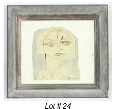
Lot #24 24 Mixed media signed Siebner (Herbert) 8" x 10", "Timeless Face". $500 - $750