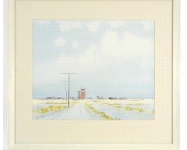
Lot # 2 2 Watercolour signed R.N.Hurley dated '62, 12" x 16", "Grain Elevators- Dusting of Snow".