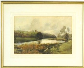
Lot # 39 39 Watercolour signed J.(John) Gray dated 1906, 8 5/8" x 14 5/8", "British Landscape".