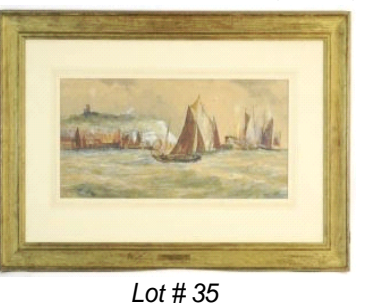
35 Watercolour highlighted with gouache signed HM, 8" x 16 1/2", "Grimsby Fishing Fleet". $100 - $150