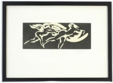
Lot # 95 95 Engraving signed (Reuben) Nakian, "Fleeing Nude".