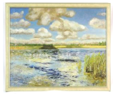
Lot # 93 93 Oil on board signed W.Pigott, 17 1/2" x 23 1/2", "Swan Lake". $150 - $250