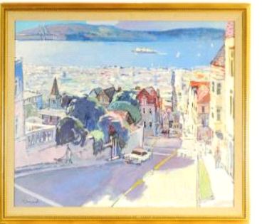
Lot # 156 156 Oil on canvas signed R. Maynard, 24 1/12 x 32", "San Francisco Cityscape". $250 - $500