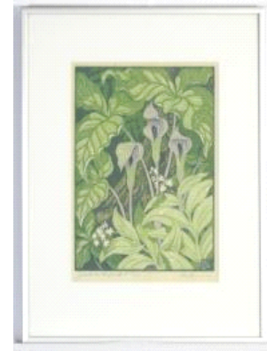
Lot # 124 124 Limited edition woodcut signed B. Rennie numbered 23/100, "Jack in the pulpit". $100 - $150