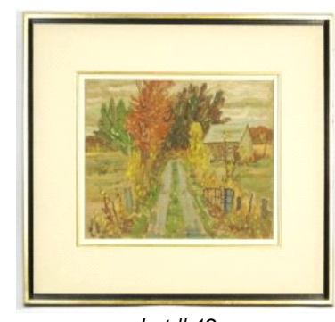
Lot # 12 12 Oil on masonite signed R.C.Bourque, dated 1979, 10" x 13", "Road to Ontario Farmhouse".