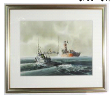
Lot # 91 91 Watercolour signed Heine, 20" x 28", "Goodwin Sands Lightship". $500 - $1,000