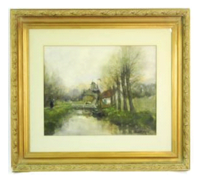
Lot # 53 53 Watercolour signed Alme Meyvis, 12 3/4" x 17 1/4", "Dutch Farm Scene". $150 - $250