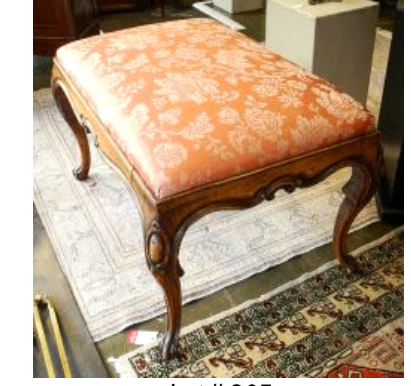
Lot # 205 205 Victorian carved mahogany footstool with cabriole legs.