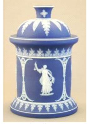
Lot # 182 182 Jasper Ware blue covered jar, 6".