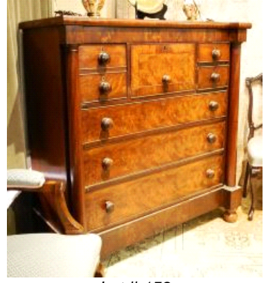
Lot # 158 158 Victorian mahogany chest of drawers. $150 - $250