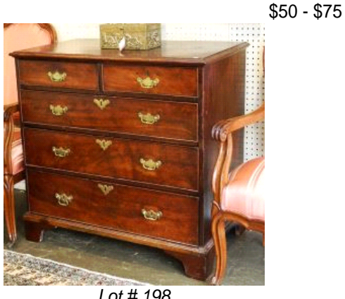
Lot # 198 198 Georgian mahogany chest of drawers.

Lot # 197 197 Chinese brass dragon decorated cigar box, 9 1/8".