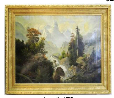
Lot # 178 178 Unsigned oil on canvas, 26" x 35", "Landscape-Mountain Waterfall".

Lot # 177 177 Oil on canvas signed C.R.Ricketts, 19 1/2" x 29", "Sail Ship in Storm". $200 - $400