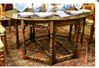
Lot # 88 88 19th. century oak drop leaf gate leg dining room table. $100 - $150 89 Set of six Victorian dining chairs. $100 - $150 90 Pair of Oriental grey soapstone dogs of foo. $25 - $50 91 Pair of Oriental white stone dogs of foo. $20 - $40