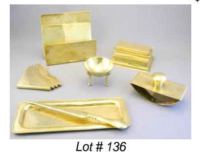
136 Chinese decorated 10 piece brass desk set. $100 - $200