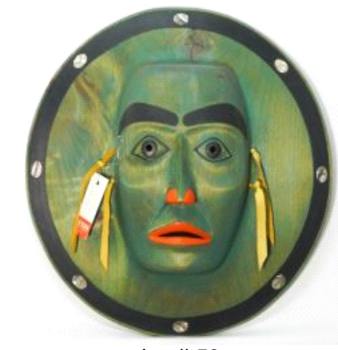
Lot # 58 58 Tsimshian painted wood moon mask dated 11/87 signed Rocky O'Obrien, 14".