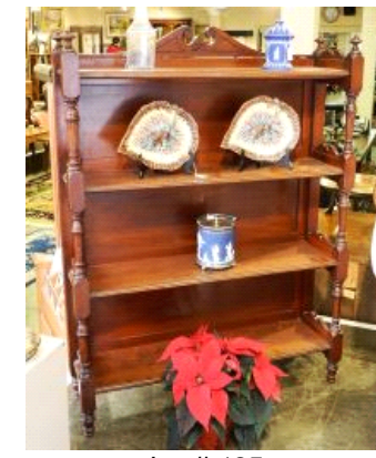
Lot # 185 185 Victorian mahogany book shelf.