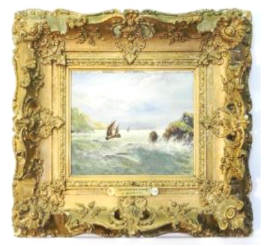
Lot # 194 194 Oil on board signed J.Brett, 8 1/2" x 11", "Ships on a Stormy Coastal Sea".