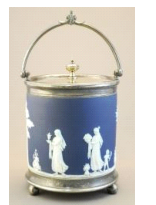
Lot # 184 184 Wedgwood Jasper Ware biscuit barrel, 6". $75 - $125