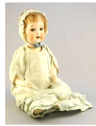
Lot # 68

68 Antique German bisque head, composition body doll in blue dress, 13 1/2"