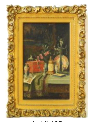
Lot # 165 165 Oil on board signed Brunck, 12" x 8", "Still Life-Desk Top".