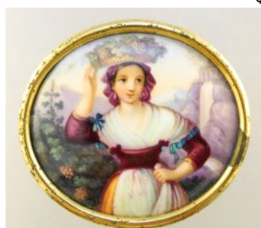
Lot # 72

72 Portrait miniature, 2" wide, "Balancing basket on her head".