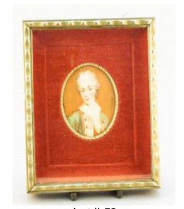
Lot # 52

52 Portrait miniature signed Cosway, 4 3/4" x 5 1/2", "Green Dress".