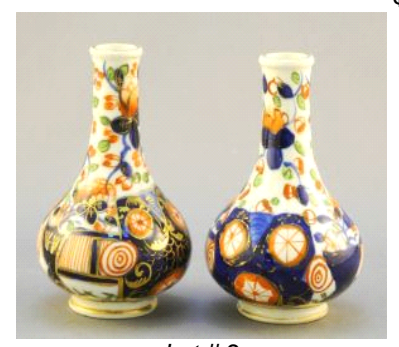
Lot #2 2 Pair of Derby miniature porcelain Imari vases, C1785, 3 1/2".