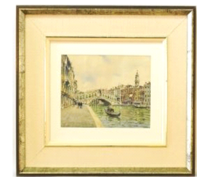
Lot # 138

138 Watercolour signed V. Zanetti 7" x 9", "Venice". -$100 - $150