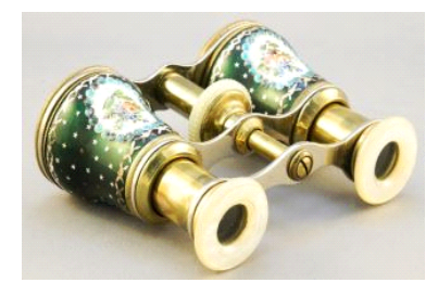
Lot # 117

117 Fine French enameled opera glasses with green field.