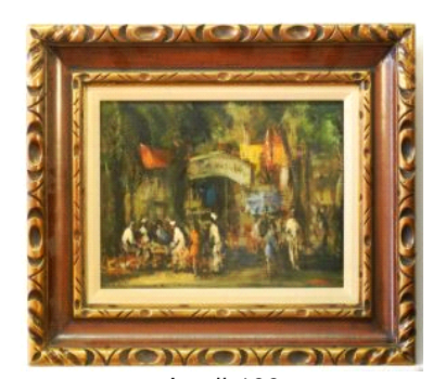
Lot # 166 166 Oil on canvas indistinctly signed Jaupy?, 9 1/3" x 13", "Ville Franche".