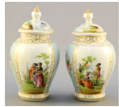
Lot # 29

29 Pair of Dresden covered urns C.1892 Grossbaum & Sons, 5 1/4".