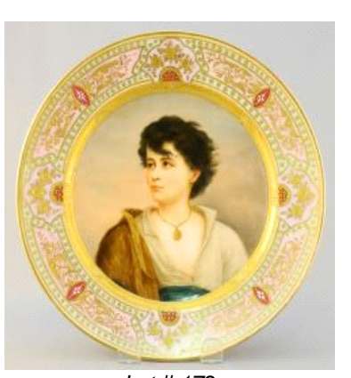
Lot # 172 172 Royal Vienna decorative plate signed Mathers. $50 - $100