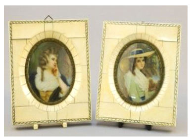
Lot # 60

60 Pair of miniature portraits in elaborate frames, 5 3/8 " frames.