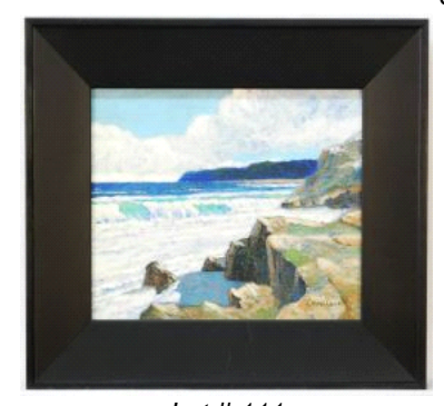
Lot # 111

111 Acrylic on canvas signed Chris MacClure, 8" x 10", "The Coast".