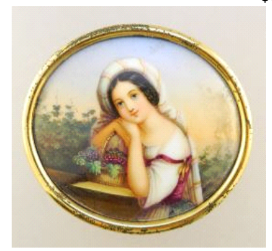
Lot # 73 73 Portrait miniature, 2"- "White Dress".

72 Portrait miniature, 2" wide, "Balancing basket on her head".