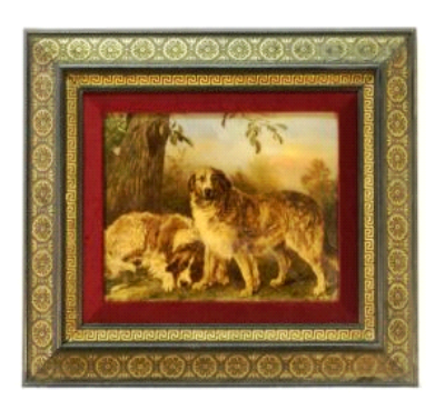
Lot # 139

139 Antique crystolium reverse painting on glass, 8" x 10", "Dogs".