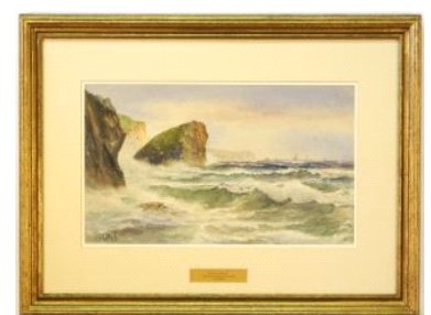
Lot # 147

147 Watercolour signed J.C Uren, 10" x 18", "The Lion Rock - Cornwall".