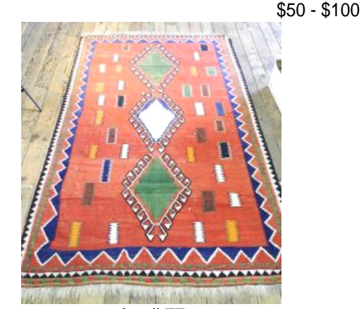
Lot # 77

76 Set of 8 Victorian mahogany dining chairs.