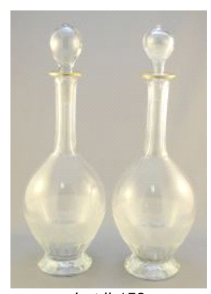
Lot # 158

158 Pair of antique blown and cut crystal decanters with gilt rims, 12 1/4".