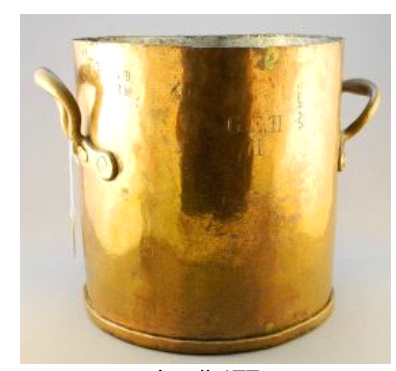
Lot # 177

177 Georgian two handled copper pot, 9 3/4".