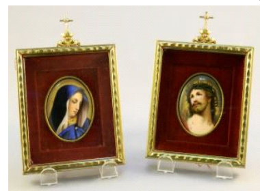
Lot # 116

116 Pair of portrait miniatures, with crucifix detailed brass frame, 2 1/2 "Mary and Jesus".