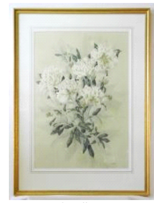
Lot # 31