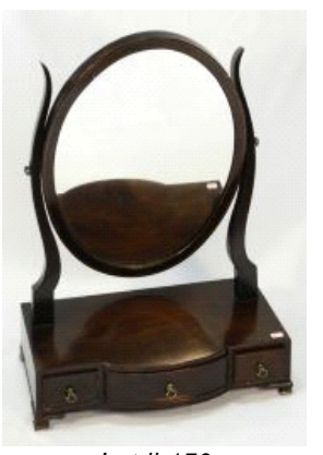
Lot # 150