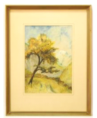
Lot # 100

100 Watercolour signed possibly G. Olafson, 12" x 9"."Trees & Mountain"