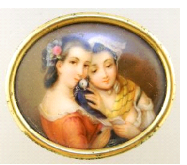
Lot # 71 71 Portrait miniature, 1 3/4", "Two Women with a dove and a pigeon".