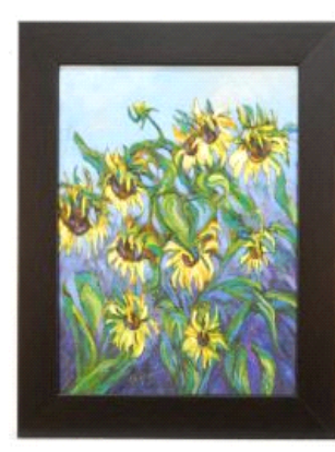
Lot # 35

35 Acrylic on canvas signed (Marilyn) Hurst, 14" x 11", "Sunflowers".