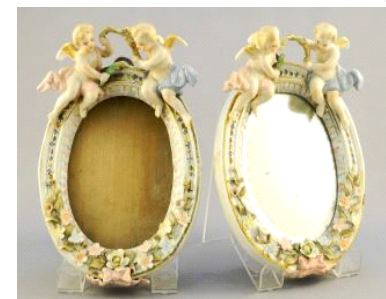
Lot # 118

118 Pair of miniature Meissen table mirrors, 6 1/2". $100 - $200