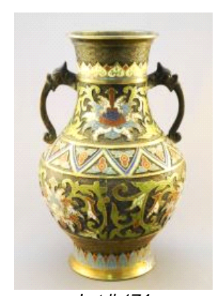
Lot # 174 174 Chinese champleve two handled vase, 11 3/4". $50 - $100