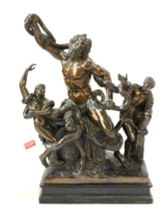
Lot # 184

184 Bronzed metal copy of Laucoon and his sons, 19" wide.