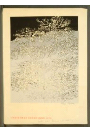
Lot # 94