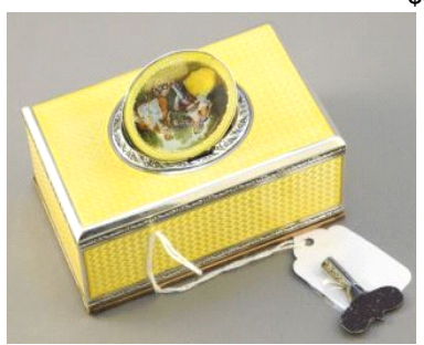
Lot # 70

70 Austrian enamel music box with key, "Singing Birds".