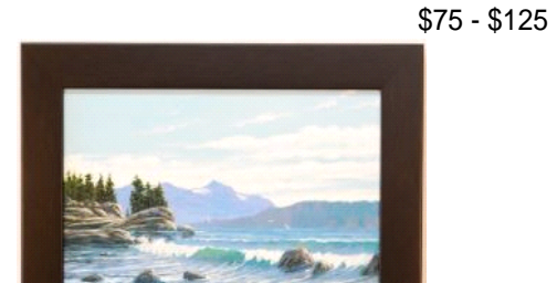
Lot # 10

9 Lot of lace, embroidered bead work collars, Christian Dior belt, etc.