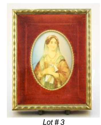
3 Portrait miniature signed Dressel, 4 3/4" x 5 1/2", "Holding Papers". $75 - $125

around top & cranberry open salt with spoon.