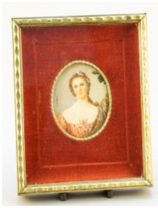
Lot # 54

54 Portrait miniature signed Nattier, 4 3/4" x 5 1/2", "Pink Dress".