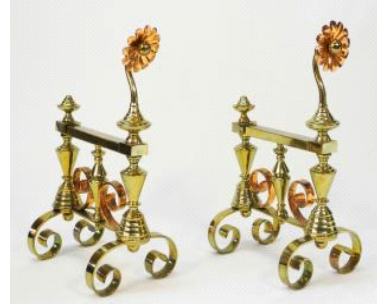
Lot # 178

178 Pair of antique English copper and brass andirons.