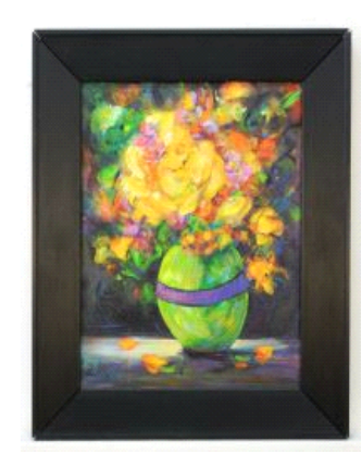
Lot # 167 167 Acrylic on canvas signed (Marilyn) Hurst, 14" x 11", "Primary Colours". $100 - $150

9 Lot of lace, embroidered bead work collars, Christian Dior belt, etc.