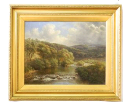
Lot # 161

161 Oil on canvas signed inverso F.Foot, 15 1/2" x 21 1/2", "On the river Dart - Devon".