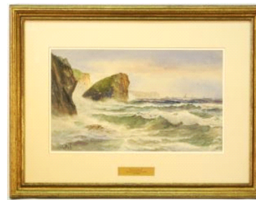
Lot # 194

194 Watercolour signed J.C Uren, 10" x 18", "The Lion Rock - Cornwall".