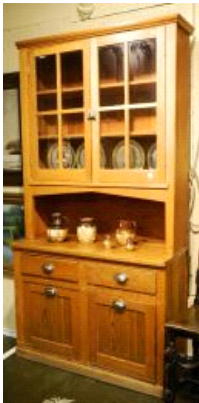
Lot # 3