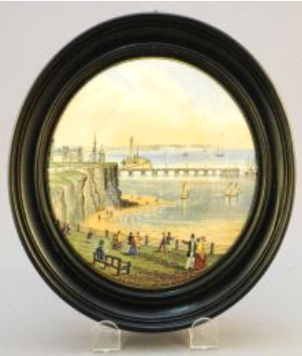
Lot # 228

228 Framed pot lid - "The New Jetty and Pier, Margate", 5 1/4".