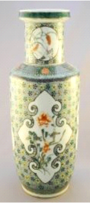
Lot # 234