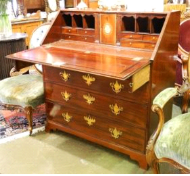
Lot # 190

189 Ornate three piece French pink field Sevres clock set with garnitures, 15". $750 - $1,250