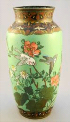
Lot # 236