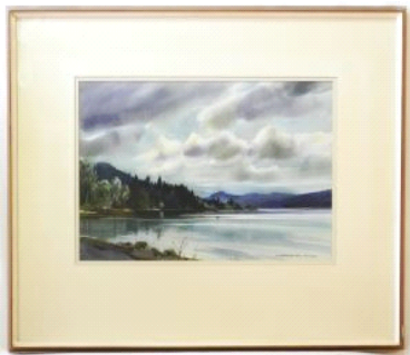
Lot # 217

216 Austrian charger with gypsy girl decoration. $20 - $40