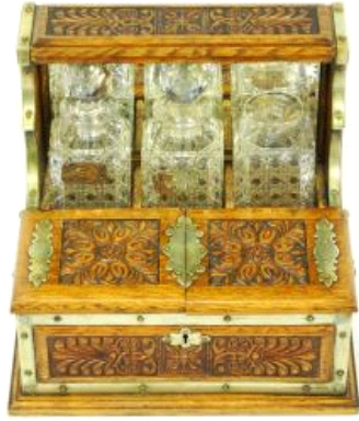
Lot # 121