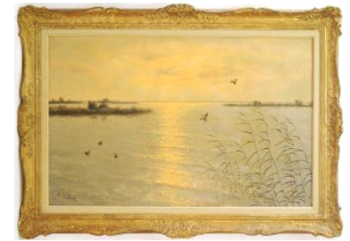
Lot # 201

201 Oil on canvas signed H.Schelfman, 24" x 20", "Sunrise".