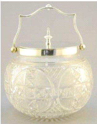
Lot # 23

23 Cut crystal biscuit barrel with plated mounts and lid, 6". $75 - $125