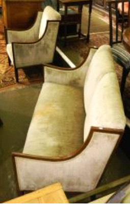
Lot # 120

120 Victorian inlaid mahogany settee with matching armchair.