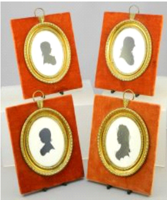
Lot # 232

232 Set of four silhouette portraits in excellent frames, 3 1/2" portraits.