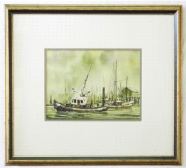
Lot # 226