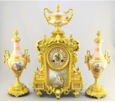
Lot # 189

188 Pair of framed paintings on silk signed possibly C.Zane, 16" x 9", "Vases of Flowers". $75 - $125