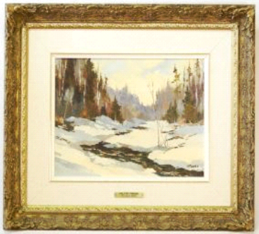
Lot # 227

227 Oil on board signed W. Pranke, 12" x 16", "Snow Scene".