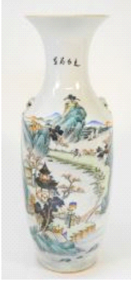
Lot # 171

170 Asian carpet, approximately 10" x 14". $750 - $1,250