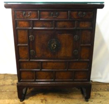
Lot # 248

248 Elm and Zelkova Jang Yi dynasty chest.