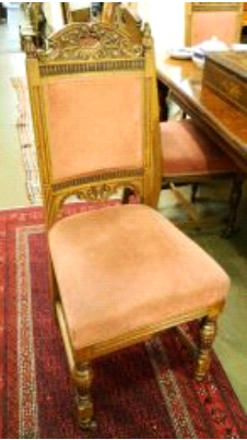
Lot # 53