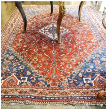
Lot # 246

245 Victorian burr walnut tea caddy. $50 - $100