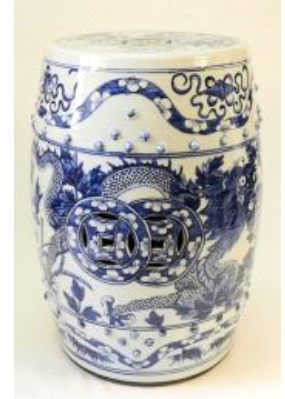
Lot # 198

198 Chinese blue and white dragon decorated garden seat, 18 1/4".