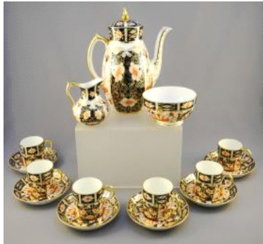
Lot # 122

122 Royal Crown Derby china part tea set.