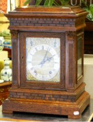
Lot # 178

177 Lot of R. Morley & Co set of four plates. $10 - $20