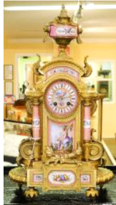
Lot # 128

128 19th century French gilded mantle clock with painted porcelain panels, 20 1/2".