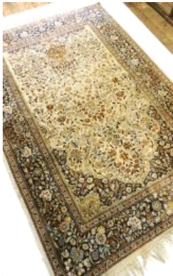
Lot # 4

4 Silk "Tee of Life" rug, approximately 4' x 6'.