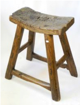
Lot # 239

238 Antique pair of painted iron Lion entry figures with scrapers. $150 - $250