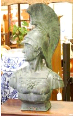
Lot # 203