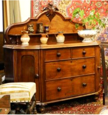
Lot # 183

182 Lot of Antique salt glazed and other pitchers, etc. $25 - $50