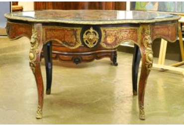
Lot # 247

247 19th century French boule shaped top centre table with glass top.