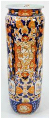
Lot # 240

240 Imari porcelain umbrella stand, 23 1/2". $200 - $400