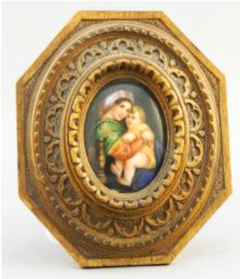
Lot # 153

152 Oriental Blanc de Chine figurine, 5 1/4" tall. $50 - $75