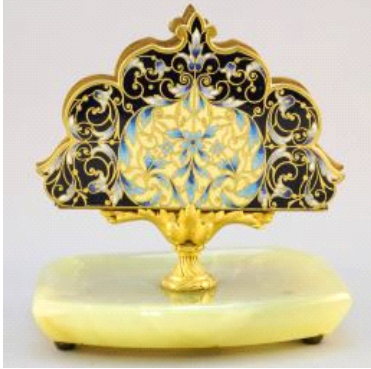
Lot # 210

210 Champleve letter rack on an onyx base, 5" high.