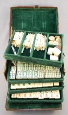
Lot # 118

118 1920's MahJong set in leather case marked Van Foong Ziang.