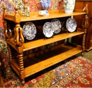
Lot # 176

175 Victorian carved mahogany oval framed wall mirror. $100 - $150