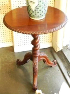
Lot # 237