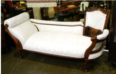
Lot # 208