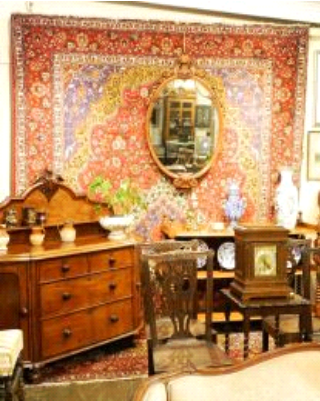
Lot # 170

169 Antique Queen Victoria Golden Jubilee glass plate. $25 - $50