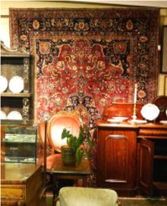
Lot # 101

100 Print Napoleon Maillart - Judgment of Paris. $30 - $40