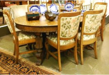
Lot # 119

119 Oak table with leaves and six chairs.