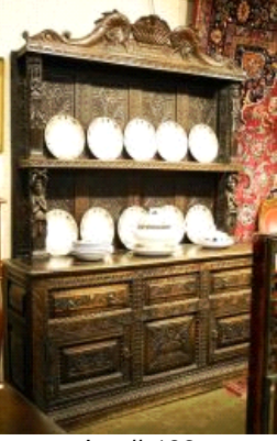
Lot # 139

138 19th century Spode china dinner service with family crest. $25 - $50