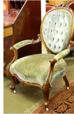
Lot # 191

191 Pair of Victorian Lady's and Gentleman's parlour chairs.