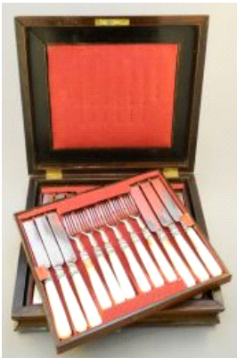
Lot # 25

24 Porcelain fairing - Lovers. $10 - $15