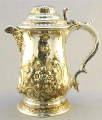
Lot # 211

211 Engraved and embossed Sheffield plated Martin Hall & Co. ewer, C1860 $150 - $250