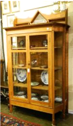
Lot # 21

21 Arts & Crafts oak display cabinet. $100 - $150 22 Pair of oil on canvases, "Country Roads". $25 - $50