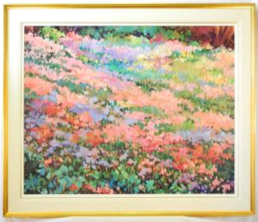
Lot # 95

94 Oil on canvas unsigned, 18" x 24", "Dutch Coastal Scene". $40 - $60