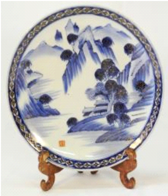
Lot # 97

96 Unsigned watercolour . "Mountain Stream". $10 - $20