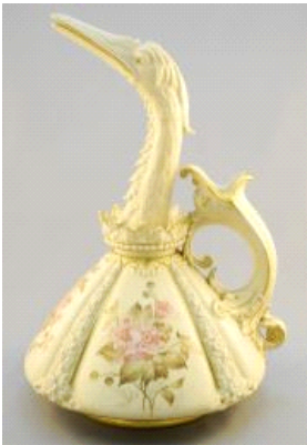
Lot # 244

244 Worcester porcelain Grotesque Stork ewer, 12" in height, (damaged lace). $200 - $400