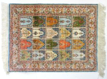
Lot # 205

205 Silk rug, approximately 2'6" x 3'6".