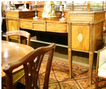
Lot # 130