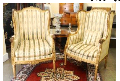
Lot # 135 135 Pair of Louis XVI Giltwood Wingback Armchairs.