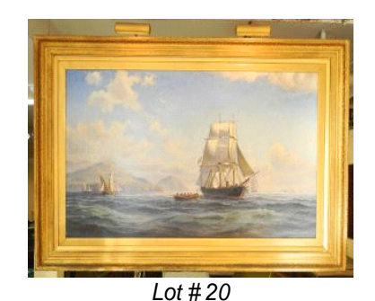
20 Oil on Canvas signed E.A. Dickinson 1887, 38 3/8" x 63 1/2", "Italian Coastal Scene".