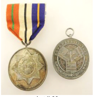
Lot # 83 83 Guangxu Period Silver Shanghai Jubilee Medal & Shanghai Volunteer Corps Long Service Medal.