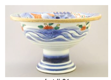
Lot # 61 41 Japanese Imari Porcelain Center Bowl 5 1/8" x 9 1/4" Diameter.