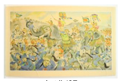
Lot # 127 127 Watercolour on Silk signed Ho Hoang Dai (Hoang dai Ho), 19 x 36 1/2", "Battle with Elephants". $1,000 - $1,500