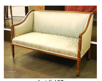
Lot # 109 109 Louis XVI Style Inlaid Mahogany Settee, 51"W.