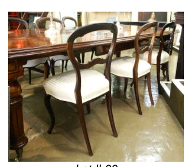
Lot # 66 66 6 Victorian Rosewood Dining Chairs, 33 1/4"H.