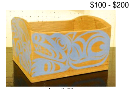
Lot # 52 52 Coast Salish Kerfed Bentwood Box signed W. J. Good, 8 1/8" x 14 1/8" x 12 1/8".