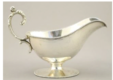
Lot # 99 99 Birks Sterling Gravy / Sauce Boat, 168 Grams.