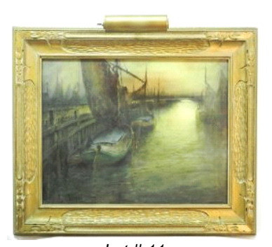
Lot # 11 11 Watercolour signed E. (Emile) Morel, 19 1/4" x 27", "Dutch Harbour Scene" $150 - $250