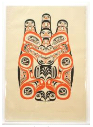
Lot # 34 34 Haida Serigraph signed Bill Reid '73 25 3/4" x 19 7/8", "Haida Grizzly-Huaji".