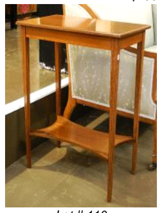
Lot # 110 110 Edwardian Inlaid Mahogany Side Table 28 3/8" x 22" x 13 1/8".