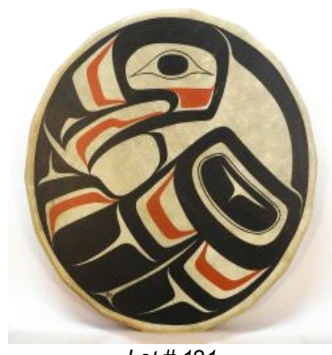
Lot # 121 121 Northwest Coast Drum Monogrammed S. 2016, 20 1/2" Diameter x 2 7/8", "Raven Design". $250 - $350