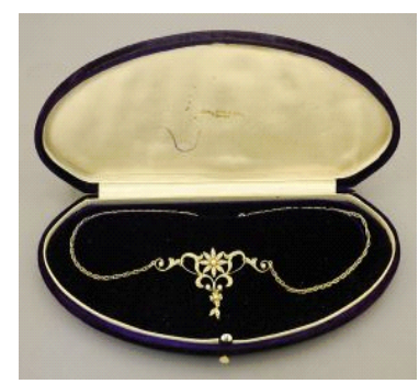
Lot # 39 39 14K (marked) Yellow Gold Edwardian Lavalier, 17"L, 9.7 Grams.