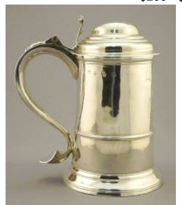
Lot # 97 97 George II 1753 Newcastle Silver Tankard by John Langlands I, 7 3/8" x 5 1/8" x 7 1/4", 803 Gra