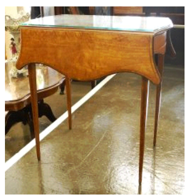
Lot # 129 129 Shraton Pembroke Table signed H. Samuel, London, 27 1/8" x 28 3/4" x 17 1/2".