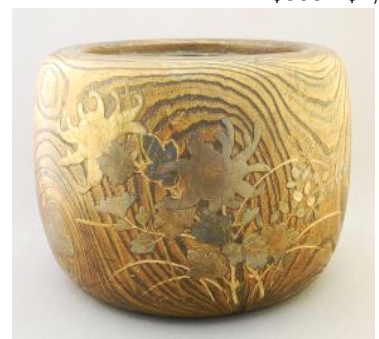
Lot # 86 86 Japanese Lacquered Elm Hibachi, 7 5/8" x 11 1/2".