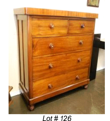
126 19th C. Mahogany Chest of Drawers, 49"H.