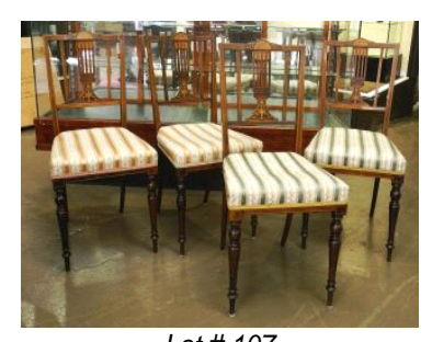
Lot # 107 107 Set of 4 Edwardian Inlaid Rosewood Dining Chairs.