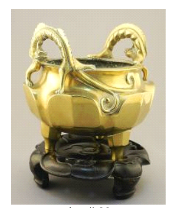
Lot # 89 89 Chinese Brass Censer with Xuande Mark, 7 1/4" x 8 3/4" x 8", 2946 Grams, Includes Stand (chi