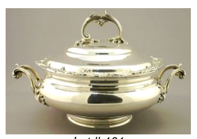
Lot # 101 101 French First Standard Silver Covered Serving Dish, 6 1/8" x 11 1/2" x 8 1/4", 1069 Grams.