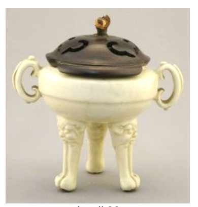
Lot #22 22 Creamy White Glazed Chinese Porcelain Tripod Censer with Wood Cover, 4 1/2"H.