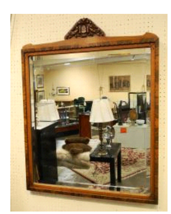
Lot # 74 74 Carved Mahogany Over Mantle Mirror, 43 1/4" x 37 1/4".