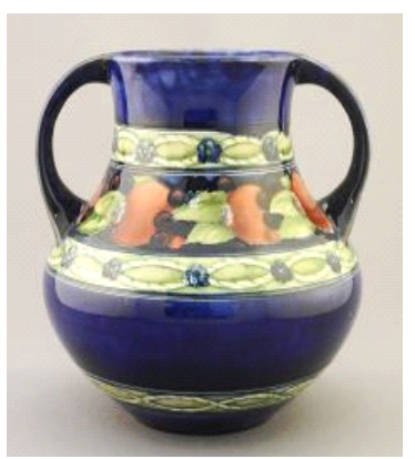
Lot # 16 16 Moorcroft Banded Pomegranate Handled Vase, 7 7/8" x 7 1/2" x 7". $400 - $600