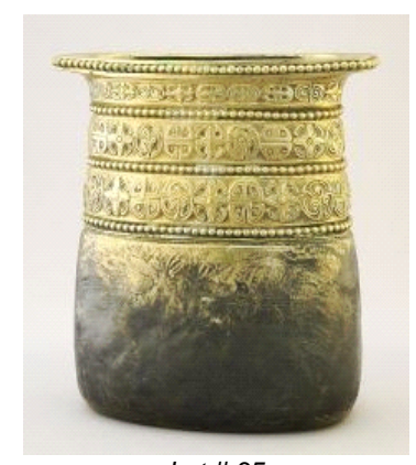
Lot # 35 35 Gustav Gurschner Bronze Vase, Celtic Design, Impressed J144, 6"H. $400 - $600