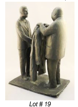
19 Bronze Sculpture Monogrammed & Dated WM (William McElcheran), 12 7/8" x 10 1/8" x 6 1/4".