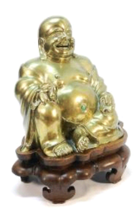
Lot # 145 145 Chinese Brass Figure of the Buddha with Wood Base, TH 19 7/8" x 18" x 13 3/4".