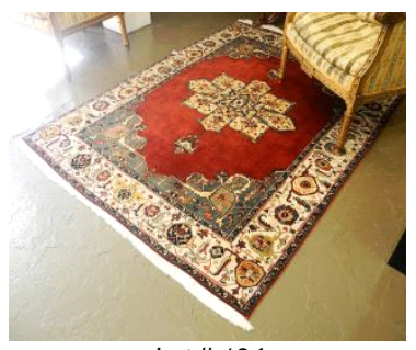
Lot # 134 134 Handknotted Turkish Carpet, Approximately 5' x 6'8".