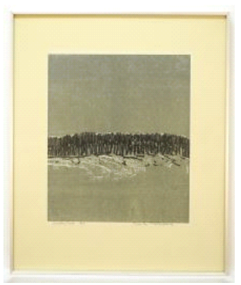
Lot # 144 144 Woodblock Print signed Naoko Matsubara, 15 1/2" x 14 1/4", "Winter Pond A/P".