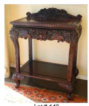
Lot # 140 140 Japanese Lacquered Wood Side Table, 35 3/4" x 30 3/4" x 18 3/4". $300 - $400