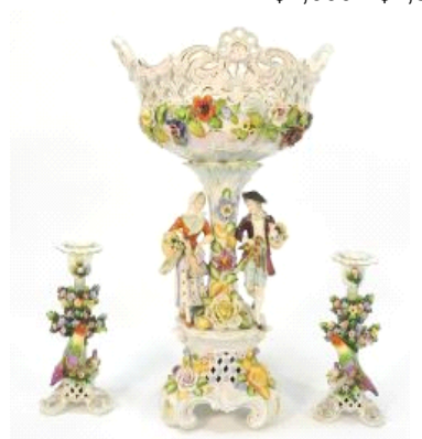
Lot # 131 131 German Porcelain Center Piece and a Pair of Gold Anchor Mark Candlesticks.