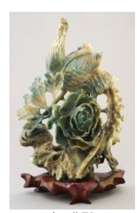
Lot # 70 70 Chinese Mottled Green Hardstone Carving on Stand, 9 1/4"H. $400 - $600