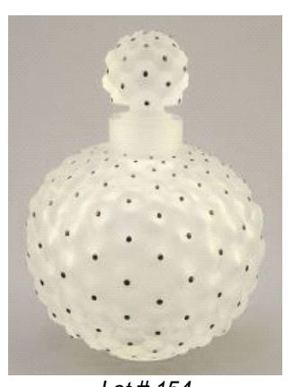
Lot # 154 154 Cristal Lalique Paris Cactus Perfume Bottle, 4 7/8"H.