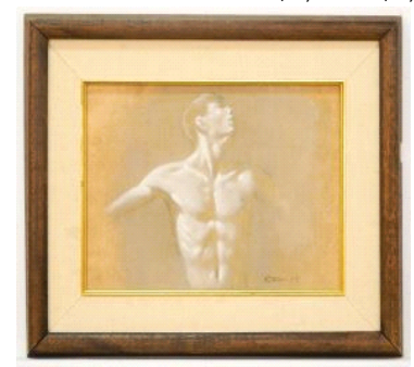
Lot # 6 6 Paper on Wood signed R. (Robert) Bliss, 8 1/2" x 11 1/2", "Resurrection Study".