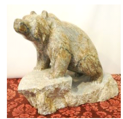
Lot # 123 123 Stone Sculpture signed C. (Cathryn) Jenkins, 15 1/4" x 20" x 10 1/2", "Bear".