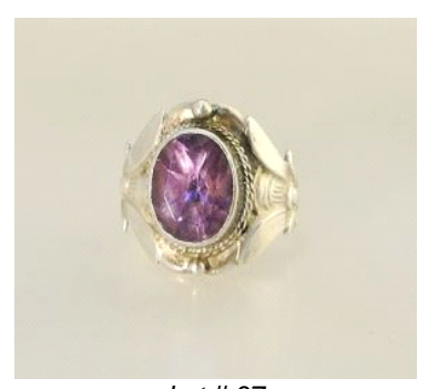
Lot # 37 37 Jensen Style 925 (marked) Silver & Amethyst Ring with Box, Size 8 1/4, 5.8 Grams.