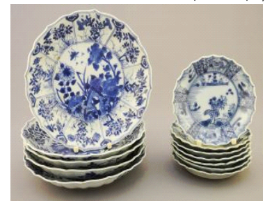
Lot # 50 50 Collection of 12 Kangxi Blue & White Porcelain Dishes, 6 1/8" Diameter (damage & restoration note