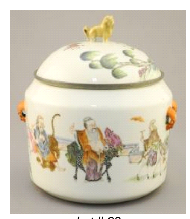
Lot # 88 19th C. Chinese Famille Rose Porcelain Covered Bowl with Metal Rim, 6 3/8"H.