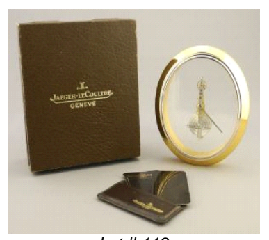
Lot # 119 119 Jaeger LeCoultre 566 Bar Clock, 5 3/8" x 4 5/8" x 1 5/8" with Box & Int. Guarantee.