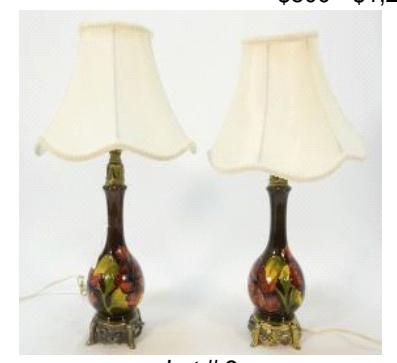
Lot #2 2 Pair of Moorcroft Hibiscus Table Lamps, 19 1/4"H. $300 - $400