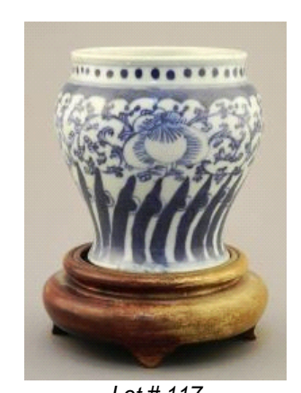
Lot # 117 117 Chinese Blue & White Porcelain Vase, 4"H.