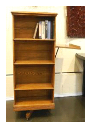
Lot # 55 55 Antique Oak Revolving Bookcase. $500 - $1,000