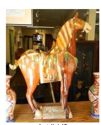
Lot # 149 149 Chinese Tang Style Sarcai Glazed Pottery Horse, 42 1/2" x 38" x 13". $300 - $400