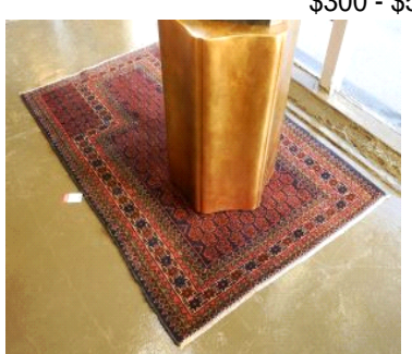
Lot # 137 137 Handknotted Persian Prayer Mat, Approximately 4'7" x 3'.