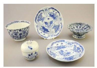
Lot # 25 25 Collection of Chinese & Japanese Blue & White Porcelain Dishes. $200 - $300