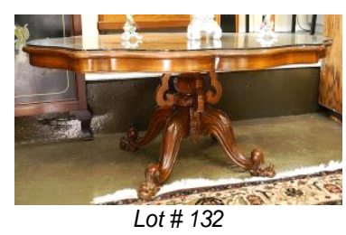
132 Marquetry Inlaid Loo Table, Height Reduced, 20" x 54" x 31 3/4".