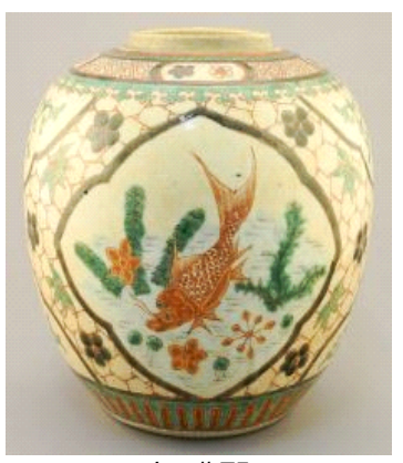
Lot # 75 75 Chinese Porcelain Jar with Underglaze Blue Artemisia Leaf, 8 3/8"H.