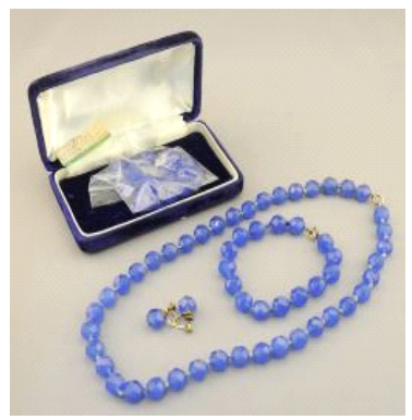
Lot # 45 45 Chinese Art Deco Blue Glass Demi-Parure, Necklace 20"L.