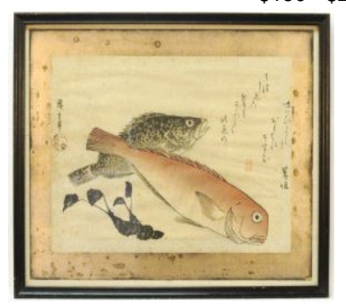
Lot # 12 12 Woodblock Print by Hiroshige, 9 3/4" x 13 1/8", "Shoal of Fishes". $200 - $400