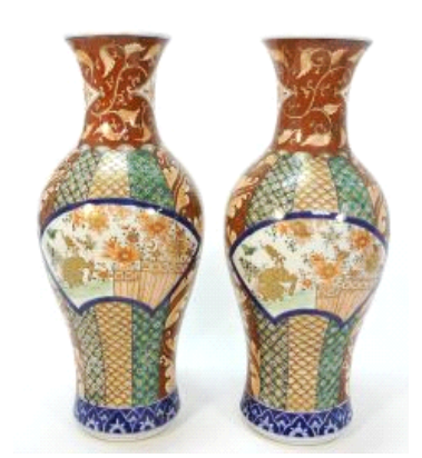
Lot # 148 148 Pair of Japanese Imari Porcelain Baluster Vases (one rim restored). $300 - $400