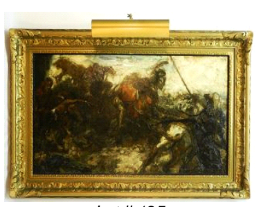
Lot # 125 125 Oil on Canvas signed J. (Johannes Hendricus) Jurres, 22 1/4" x 40 1/2" "The Coming of Don Quixote $800 - $1,000