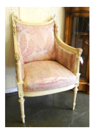
Lot # 9 9 Louis XVI Cream Painted Bergere Chair, 36 5/8" x 25 1/2" x 25".