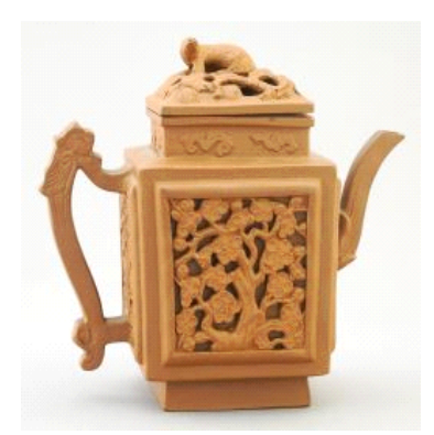
Lot # 113 113 Chinese Yixing Ware Double Walled Teapot, 5" x 3 1/8" x 5 1/2". $300 - $500