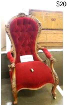
Lot # 26 26 Victorian Mahogany Armchair with BADA Seal, 42"H.