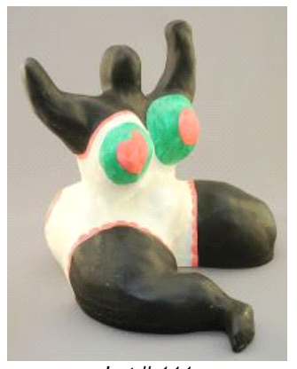
Lot # 111 111 Polyester Figure impressed Niki de Saint Phalle, 10 1/8 x 13 1/2 x 12", "Femme Assise - Nana", #46 $12,500 - $17,500