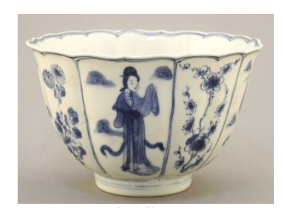
Lot #81 81 Ming Porcelain Bowl with Chenghua Mark, 2 7/8" x 5" Diameter (crack noted).