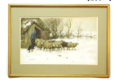
Lot # 139 139 Watercolour signed (Frans Pieter) ter Meulen, 13 1/8" x 24 1/2", "The Flock".