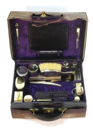
Lot # 90 90 Goldsmiths & Silversmiths Co. Hallmarked Silver Dressing Case, 5 3/8" x 13 1/8" x 9".