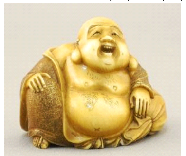
Lot # 112 112 Ivory Netsuke, 1 1/2"W x 1 1/8"H, NO EXPORT.