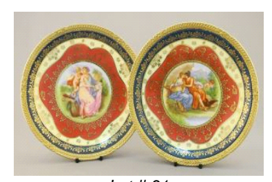
Lot # 31 31 Pair of Royal Vienna Style Cabinet Plates, 8 1/2" Diameter.