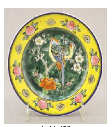
Lot # 150 150 Chinese Famille Rose Porcelain Dish, 6 5/8" Diameter. $100 - $150