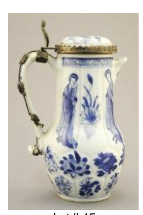
Lot # 15 15 Kangxi Porcelain Covered Pitcher with Dutch Silver Mounts, 5 1/2"H. $400 - $600