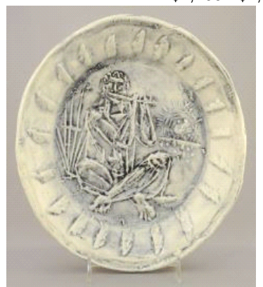
Lot # 156 156 Pablo Picasso - Madoura Plein Feu Originale de Picasso Dish, Jouer de Flute, 1 3/8 x 9 5/8"