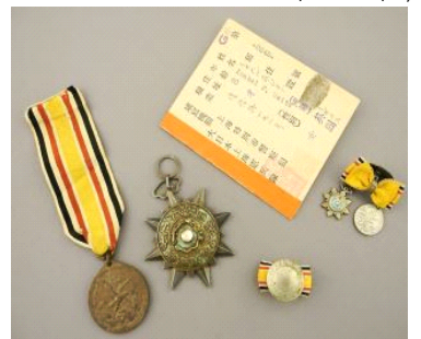
Lot # 84

84 2 Medals with Matching Miniature/ Dress Medals on Single German Chinese Campaign Ribbon.