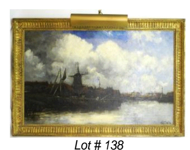
138 Oil on Canvas signed J. (Jan) Van Couver (Hermanus Koekkoek), 23 3/8" x 41", "Harbour Scene".