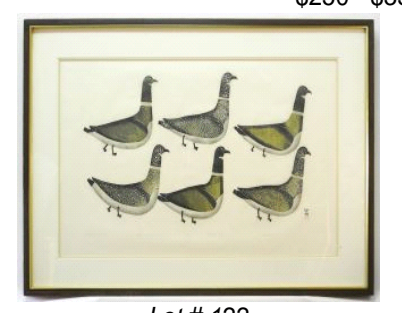
Lot # 122 122 Stone Cut & Stencil signed Etidlooie 17 3/4" x 27 3/4", "Marching Birds", #20/50.