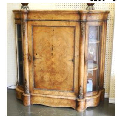
Lot # 4 4 Victorian Burr Walnut Credenza, 41 5/8" x 50" x 16 7/8".