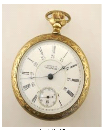
Lot # 43 43 American Waltham Gold Plated Pocket Watch, 2 1/8" Diameter. $200 - $300