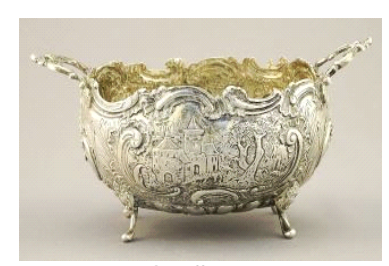
Lot # 100 100 Continental Silver Bowl, 3 1/4" x 6 1/2" x 4", 216 Grams.