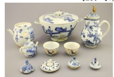
Lot # 100A 100A Study Group of Damaged Chinese Blue & White Ceramics.