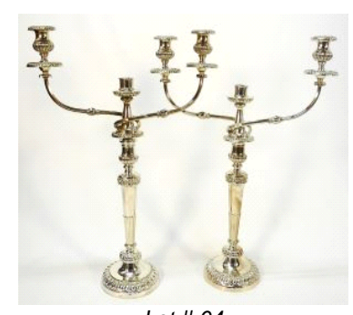
Lot # 64 64 Pair of Matthew Bolton Old Sheffield Plate Convertible Candelabra, 22 1/2 " x 17 1/4" x 6".