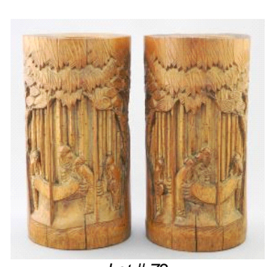
Lot # 72 72 Pair of Chinese Bamboo Brush Pots, 7 1/4"H.