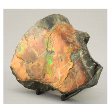
Lot # 41 41 Polished Ammolite, 7/8" x 5 3/8" x 4". $800 - $1,000