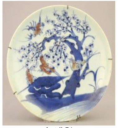
Lot # 51 51 Chinese Blue & White Porcelain Dish with Underglaze Red, 10 3/8" Diam.