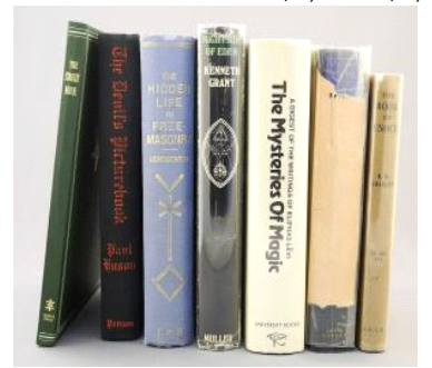
Lot # 102 102 Collection of Masonic / Occult / Esoteric Books.