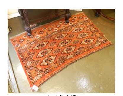
Lot # 142 142 Turkomen Pile Woven Textile, Approx. 2'9" x 4'5".