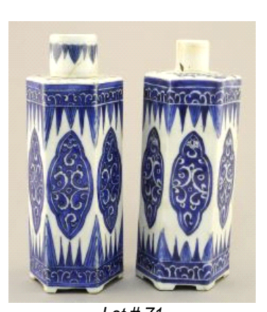
Lot # 71 71 Pair of Hexagonal Chinese Blue & White Bottles with One Cup (as found).