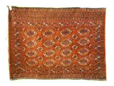
Lot # 53 53 Unusual Turkomen Pile Textile with Continuous Backing, Approx. 6'8" x 4", Kermes Tone Motifs.