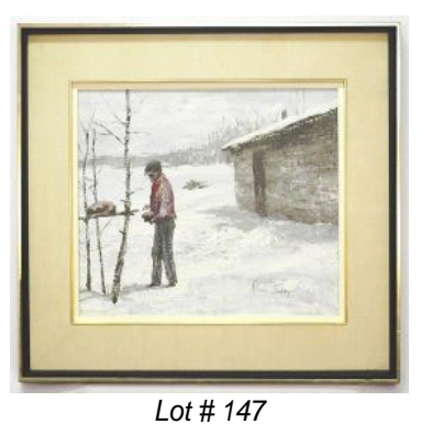
147 Acrylic on Canvas Signed Allen Sapp, 16"x 20", "Man is Getting Meat", Dated 1972 Verso. $2,000 - $3,000