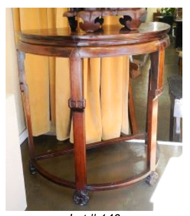
Lot # 146 146 Chinese Rosewood Demilune Table, 33 3/4"H.