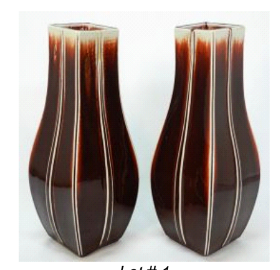
Lot # 1 1 Pair of Chinese Langyao Glaze Porcelain Quadrangular Baluster Vases, 17 1/4"H.