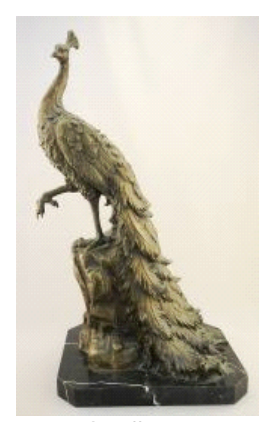
Lot # 136 136 Bronze Sculpture, Unsigned, 19 1/2" x 13" x 8 1/4", "Peacock".