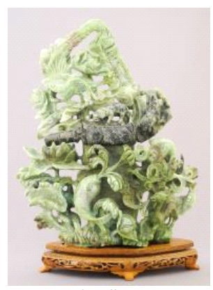
Lot # 77 77 Chinese Green Hardstone Carving on Stand, 12"H.