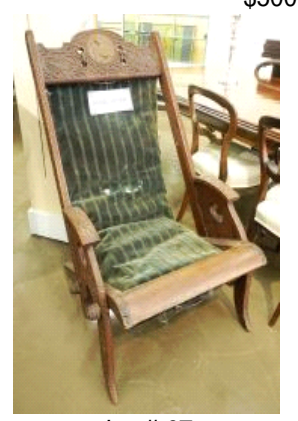
Lot # 67 67 Indian Carved Teak Lounge Chair with Cushion.