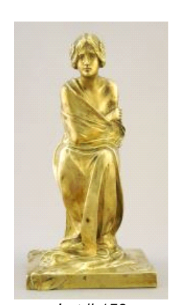
Lot # 153 153 Gilt Bronze Figure signed M. (Maurice) Bouval, 7 1/2" x 4 1/4" x 4", "La Pensive".