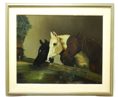
Lot # 32 32 Unsigned Oil on Canvas, 19 1/2" x 26 3/4", "Horses Watering". $200 - $400