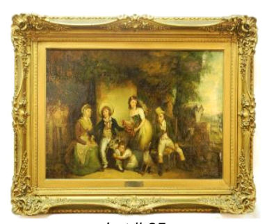
Lot # 85 85 Oil on Canvas signed W.R. Bigg, 15 1/2" x 23 1/2", "Preparing a Farewell". $500 - $1,000