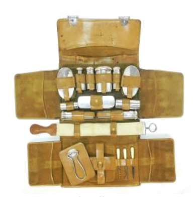
Lot # 98 98 Goldsmiths & Silversmiths Co. Hallmarked Silver Gents Dressing Case, 9 1/2" x 15" x 3".