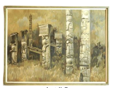
Lot # 5 5 Oil on Board signed verso Nell Bradshaw, 29 1/2" x 44 1/2", "The People Have all Gone Away"

The next scheduled Specialty Auctions are: TopNotch - Feb 27 2024 Fine Art - Mar 05 2024 Collectable - Mar 12 2024 Ethno World - Mar 19 2024