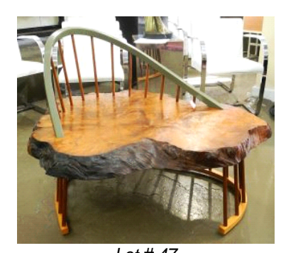
Lot # 47 47 West Coast Windsor Chair: Red Cedar / Yellow Cedar / Pacific Yew, 33" x 52" x 40 1/2".