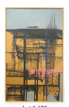
Lot # 130 130 Acrylic on Masonite signed Maxwell Bates, 35 1/2" x 23 3/4" Drip Painting.