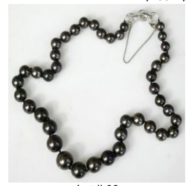
Lot # 38 18 1/2"L Strand of Graduated Black South Sea Pearls & Earrings with Appraisal.