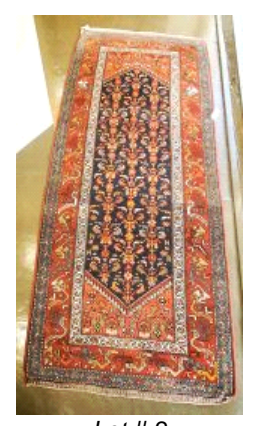
Lot # 8 8 Handknotted Persian Runner Approximately 7'6" x 3'6".