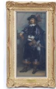
10 Pastel signed A. (Marc-Aurele De Foy Aurele De Foy) Suzor-Cote, 14 1/2 x 7 1/2" "Cavalier".