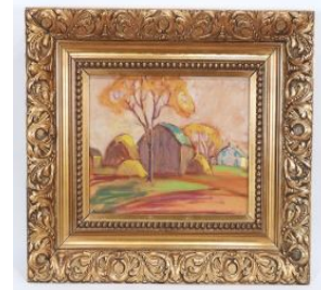
11 Oil on Board signed A.J. (Alfred Joseph) Casson, 8 3/8 x 10 3/8" "Norwal" (w/literature).