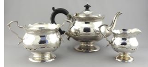
39 Mappin & Webb Arts & Crafts Style Hallmarked Silver 3 Piece Tea Set, 10 1/4"L, TW 1056g. $1,800 - $2,250