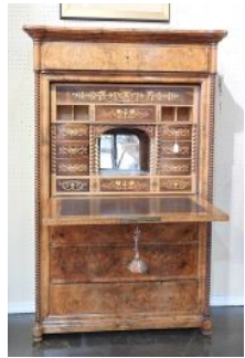
154 Northern European Burr Walnut Secrétaire a Abattant with Marquetry Interior, 63 1/4x44 3/4x20 $1,200 - $2,000