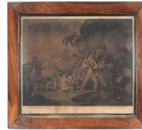
67 "The Death of Captain James Cook" Engraving After George Carter, 17 x 23 1/2". $1,500 - $2,500