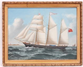
80 Pair of Gouache on Paper signed R. (Reuben) Chappell of Goole, 14 1/2 x 20 3/4", "Samuel Holland.. $2,000 - $4,000