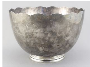
159 Irish Hallmarked Silver Bowl, 4 3/4 x 7 7/8" Diameter, 700g $1,200 - $1,800