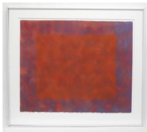
82 Enamel on Paper signed (Claude) Tousignant-03, 22 1/4 x 29 3/4" "Poeme Aeroscolair" (Rouge) $1,200 - $1,800