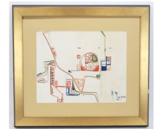
153 Watercolour signed Alex Janvier '64, 13 1/4 x 18", "Abstract". $1,500 - $3,000