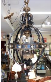
36 Italian Renaissance Revival Globular Eighteen Light Stair Lantern, 48"h. $1,000 - $2,000