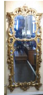
139 Early 19th C. Continental Rococo Giltwood Looking Glass, 77 1/2 x 35 1/2 x 2". $1,500 - $3,000