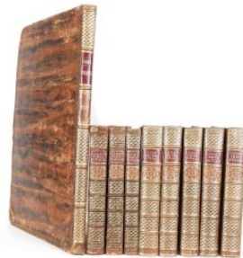
66 Complete Set of 1st Edition Cook's Voyages, 8 Volumes & Folio, John Barrymore Bookplate. $10,000 - $20,000