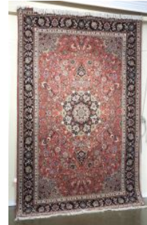
166 Hand Knotted Persian Carpet Approximately 6'9" x 10'6". $1,000 - $2,000