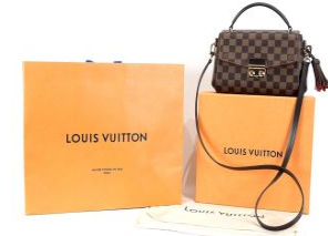
75 Louis Vuitton Croisette Damier Ebene Handbag with Original Box/Soft Bag/Receipt Copy. $1,800 - $2,250