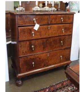
198 William & Mary Book Matched Burl Walnut Chest of Drawers C.1680-1690, 36 1/2 x 39 x 21 1/2". $3,000 - $5,000