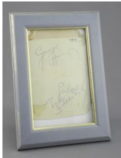
38 Beatles Autograph Signature Collection Acquired Heathrow October 23, 1963. $4,000 - $5,500