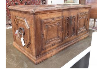
169 Mid 16th C. German Oak Lock Box/ Coffin with Key. $1,500 - $1,800