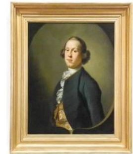
196 Oil on Canvas signed R. (Richard) Phelps 1758, 30 x 25", "Portrait of a Young Gent". $2,000 - $3,000