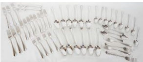
60 Harlequin set 48 Pieces of Georgian Silver Bright Cut Flatware, 2398 g. $4,500 - $6,000