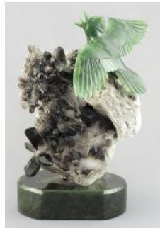
83 Jade & Amethyst Sculpture signed (Lyle) Sopel E815, 10 1/4 x 8 1/2 x 6" "Bird in Flight". $1,000 - $2,000