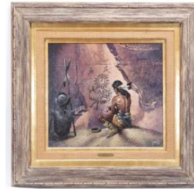
190 Oil on Board signed (Don) Crook '82, 20 x 24" "The Legend Keeper". $2,000 - $4,000