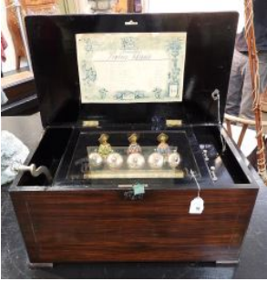
56 Charles & Jacques Ullman No. 7112 8 Air Music Box with Mandarin Automatons. $1,500 - $2,500