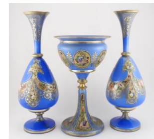
12 3 Piece 19th C. Continental Gilt Glass Garniture, 10 7/8 & 13 1/2"h.