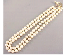
Lot # 489