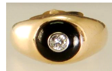
Lot # 454