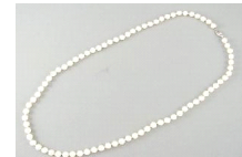
Lot # 439