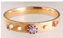
Lot # 460