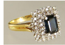
Lot # 450