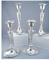
Lot # 421