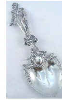
Lot # 431