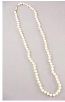
Lot # 443