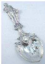
Lot # 427