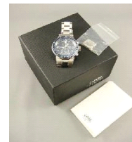
Lot # 497