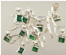
Lot # 483