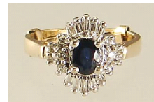
Lot # 494