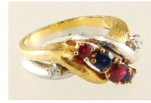
Lot # 449