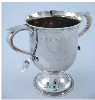
Lot # 424