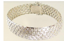
Lot # 419