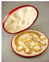
Lot # 410