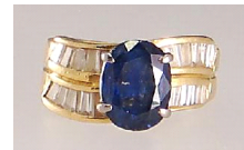
Lot # 492