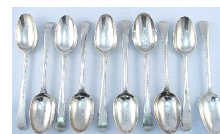
Lot # 475