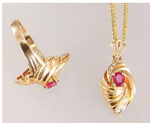
Lot # 482