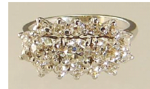
Lot # 416