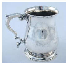
Lot # 461