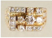
Lot # 455