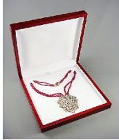
Lot # 481