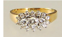
Lot # 412