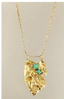
Lot # 446