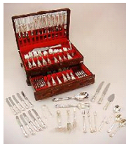
Lot # 633