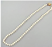
Lot # 445