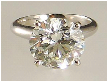
Lot # 408