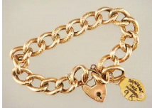
Lot # 405