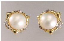
Lot # 484