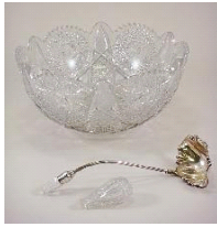
Lot # 630