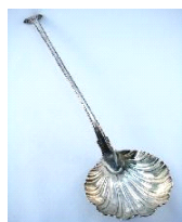
Lot # 510