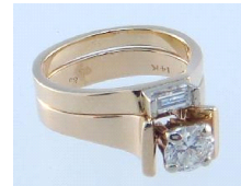
Lot # 453