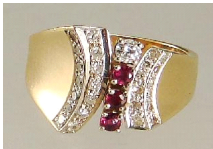
Lot # 457