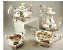
Lot # 466