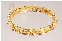
Lot # 459