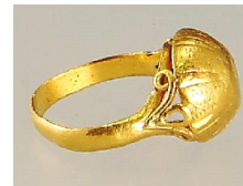
Lot # 452