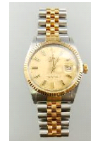
Lot # 420