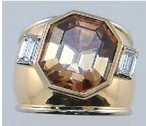
Lot # 456