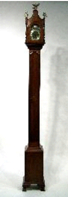
Lot # 394