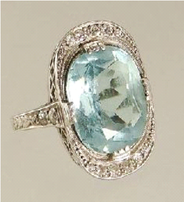
Lot # 123