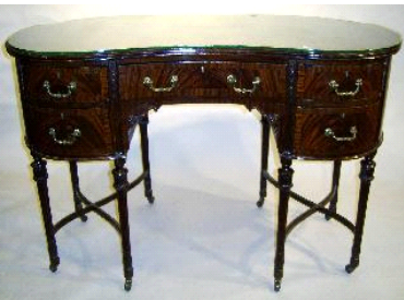
Lot # 337

337 Kidney shaped cross banded mahogany vanity table. $750 - $1,250