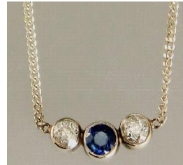
Lot # 113