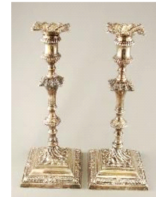
Lot # 315

314 18th century Adams salt glazed pitcher with hallmarked silver lid. $500 - $700