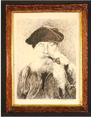
Lot # 61