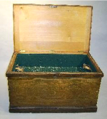
Lot # 14