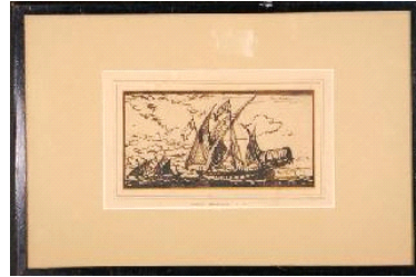
Lot # 330