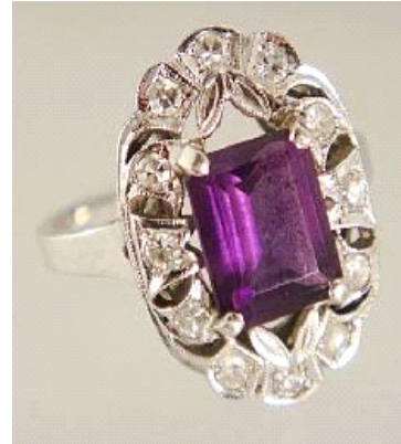
Lot # 118

116 Platinum tourmaline and diamond ring. $1,500 - $2,000