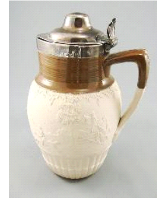
Lot # 314

121 "Mixtec" 18k gold turquoise inlaid brooch. $500 - $700