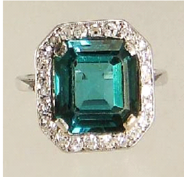
Lot # 116

116 Platinum tourmaline and diamond ring. $1,500 - $2,000