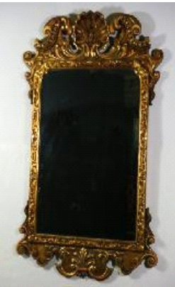
Lot # 399