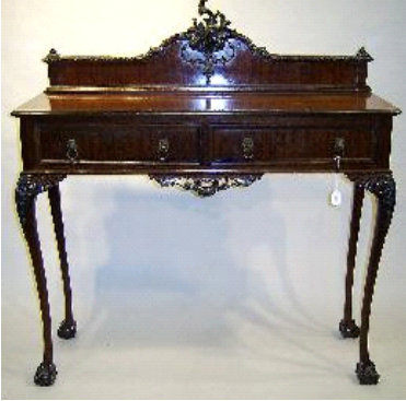
Lot # 294

293 Georgian inlaid mahogany tea caddy. $200 - $300