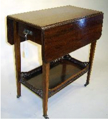
Lot # 357

356 Unusual 19th. century tea caddy with lion figured top. $50 - $75