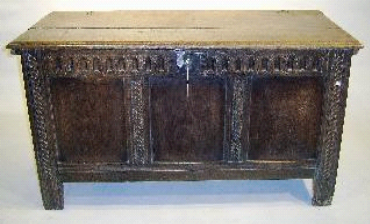
Lot # 308