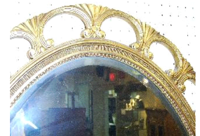
Lot # 321

320 Cross banded walnut chest on stand in William and Mary style. $400 - $600