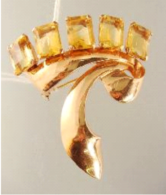
Lot # 103

102 19th century 18k yellow gold pocket watch Ulysse Nardin, Locle, with a chain. $500 - $800