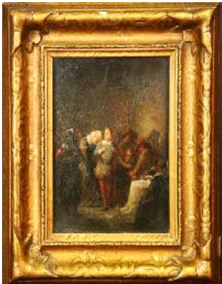
Lot # 392