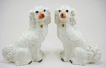
Lot # 350

349 Staffordshire china figure of a whippet with hare, height 11 inches. $75 - $100