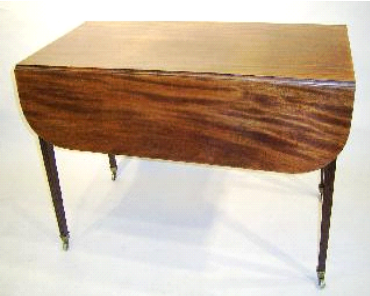
Lot # 397