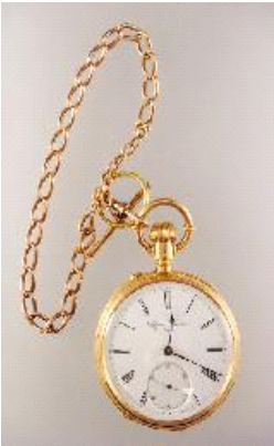
Lot # 102

101 Lady's 14kt. gold diamond and emerald dinner ring. $400 - $600