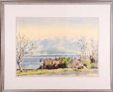
Lot # 182