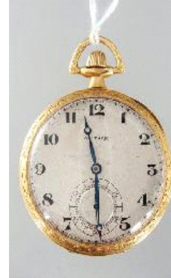
Lot # 111