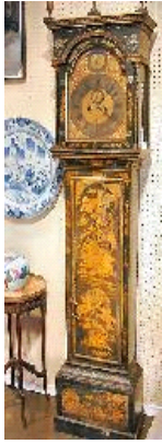
Lot # 323