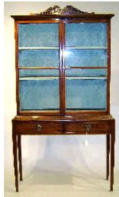
Lot # 331