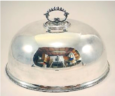
Lot # 360

359 Oil painting on board indistinctly signed, 12 in. x 18 1/2in., "European Street Scene". $100 - $150