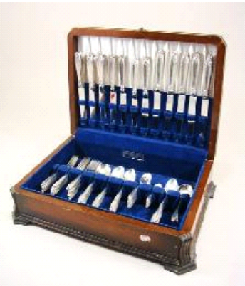
Lot # 237