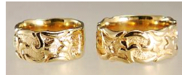
Lot # 120

119 14kt yellow gold diamond and sapphire ring. $50 - $100