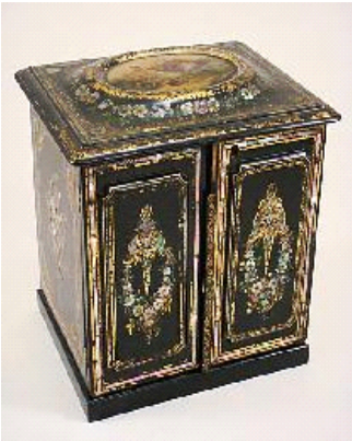
Lot # 335

334 Early 19th century porcelain figurine of a man with whippet, 12" in height. $200 - $400