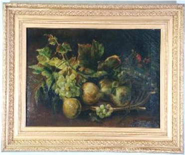
Lot # 89

88 Directoire mahogany upholstered side chair. $50 - $100