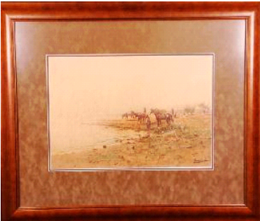
Lot # 68