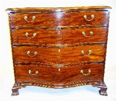
Lot # 400