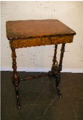
Lot # 340

339 Karabagh long rug, approx. 10'6" x 4'4". $200 - $300