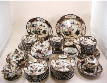
Lot # 257