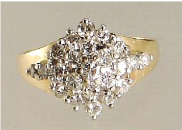
Lot # 107

106 Russo Scurro branch coral necklace. $100 - $150