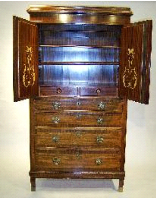
Lot # 268