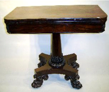
Lot # 398