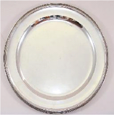
Lot # 313