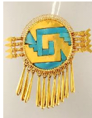
Lot # 121

117 Art Deco platinum and diamond clip brooch, 13.8 grams, 4.01 cts. $4,000 - $6,000