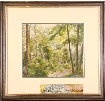
Lot # 147

146 Framed watercolour signed L.(Lorna) J.Dall, 13 1/2 in. x 20 1/2 in., "Abandoned". $50 - $100