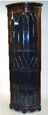
Lot # 354

353 Late Georgian mahogany open armchair. $150 - $250