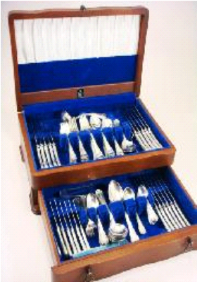
Lot # 279

278 Five Continental silver spoons. $50 - $75