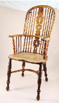
Lot # 395