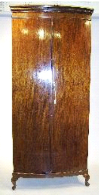
Lot # 210