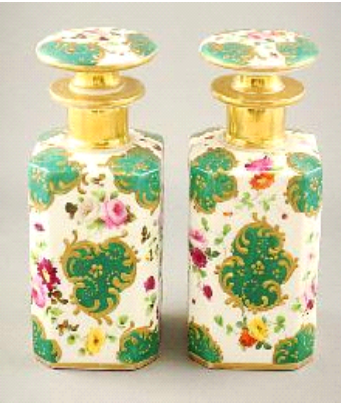
Lot # 377