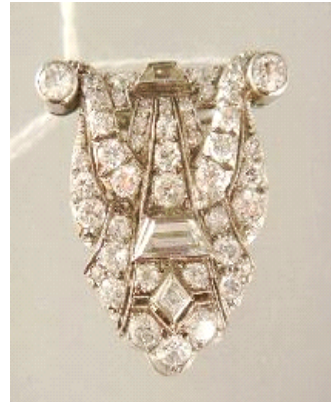
Lot # 117

120 Custom set of 10kt yellow gold wedding bands. $250 - $500