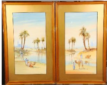
Lot # 324