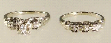
Lot # 108

107 14kt yellow gold and diamond dinner ring with original receipt. $400 - $600