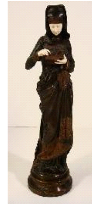
Lot # 766

766 Bronze and ivory statue marked A. Carrier-Belleuse, 20" in height, "Liseuse".