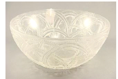
Lot # 751