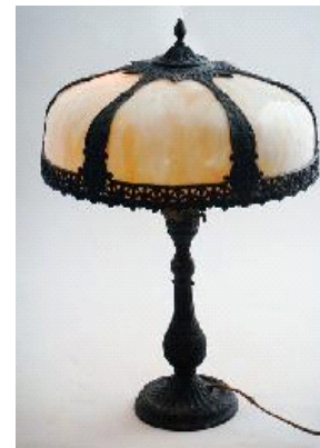
Lot # 744