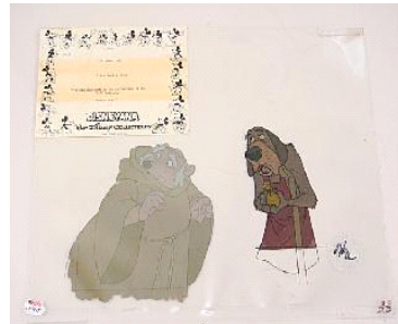
Lot # 477

477 Two Walt Disney "cels" used in the 1973 feature Robin Hood-"Friar Tuck an Otto", 12" x 15".