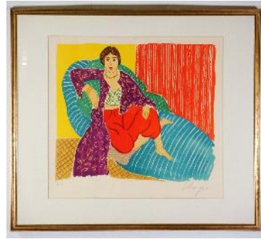
Lot # 701