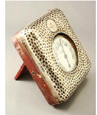
Lot # 749