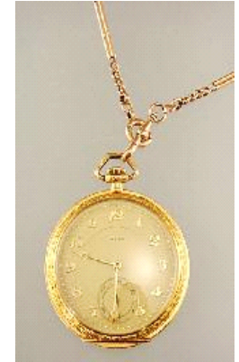
Lot # 543