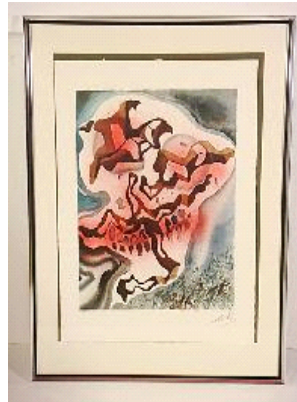
Lot # 738

737 Limited edition print signed J. Shadbolt numbered 7/150, "Woodland Scene after Emily Carr". $75 - $125