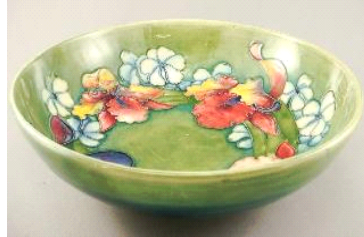
Lot # 620