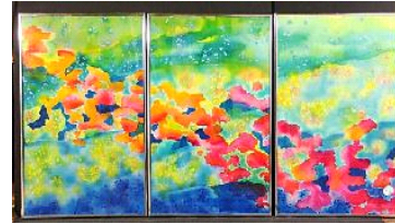
Lot # 482