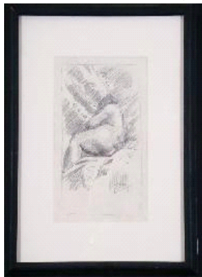
Lot # 759

759 Pencil drawing signed Zorn, 7 1/2"x 4 1/2", "Nude Study-Modellstude".