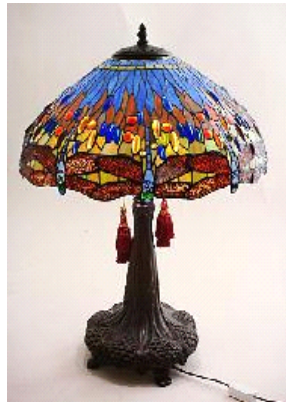
Lot # 705