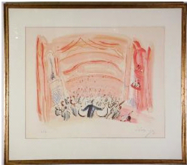
Lot # 506