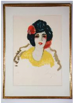
Lot # 507