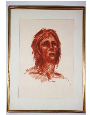
Lot # 511

510 Ltd.ed. lithograph after Matisse signed Elmyr (de Hory), 32/175, "Femme dans les Feuillages". $150 - $300