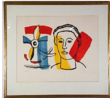
Lot # 508