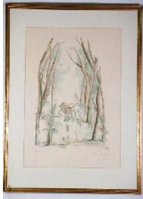
Lot # 699