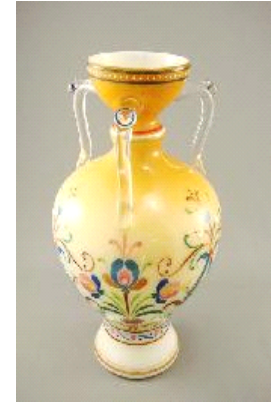
Lot # 684