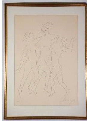
Lot # 528