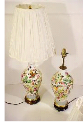
Lot # 765

765 Two hand painted ceramic base table lamps.