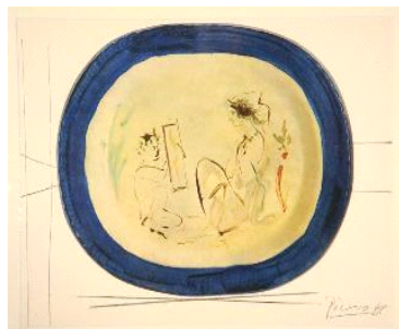
Lot # 662