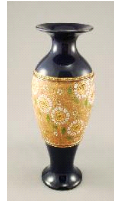
Lot # 742