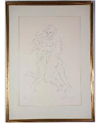
Lot # 640