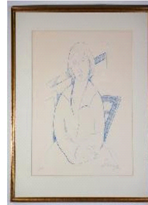
Lot # 509

741 Pair of walnut and rosewood sliding bookends, 13 1/2". $50 - $75