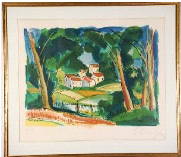
Lot # 616