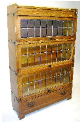
Lot # 764

764 Oak Arts & Crafts leaded glass stacking bookcase. .