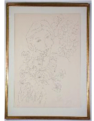
Lot # 510

509 Limited edition lithograph after Modigliani signed Elmyr (de Hory) 32/175, "Portrait en Bleu". $150 - $300