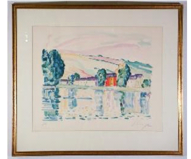
Lot # 717