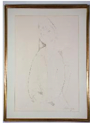
Lot # 529