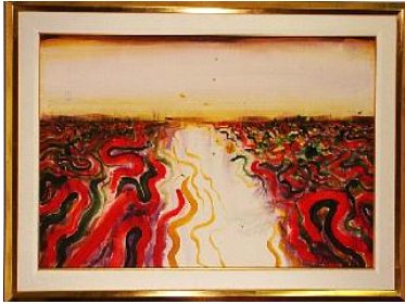
Lot # 363

363 Oil on masonite signed J. Shadbolt, 26" x 40", 1963, "Landscape Tapestry". $4,000 - $6,000