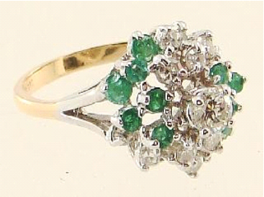
Lot # 136

135 Black pearl necklace with case. $200 - $300