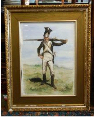
Lot # 301