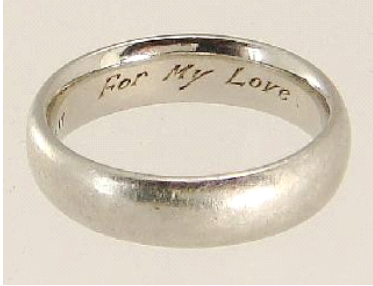
Lot # 127