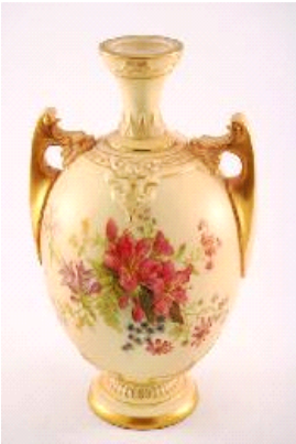
Lot # 286