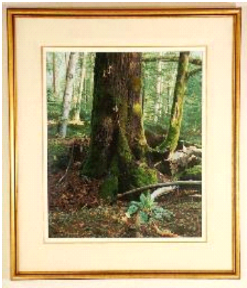
Lot # 158