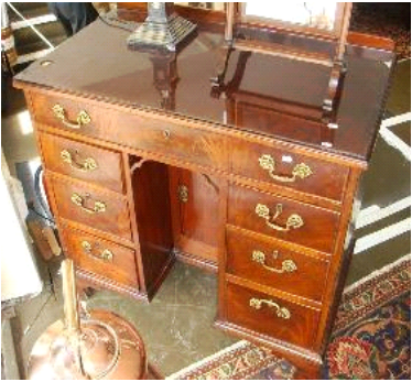
Lot # 320

319 Classical style silver plated candle stick with Corinthum column made into tablelamp,ht.34". $50 - $100