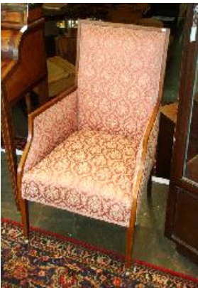
Lot # 355

354 Royal Worcester cobalt blue oval comport, c. 1906. $100 - $150