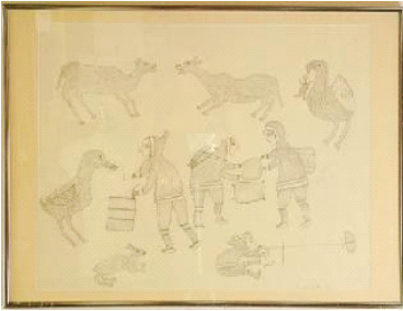
Lot # 42