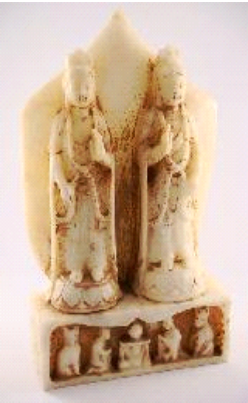
Lot # 39

39 Hand painted plaque decorated with figures and animals. $400 - $600