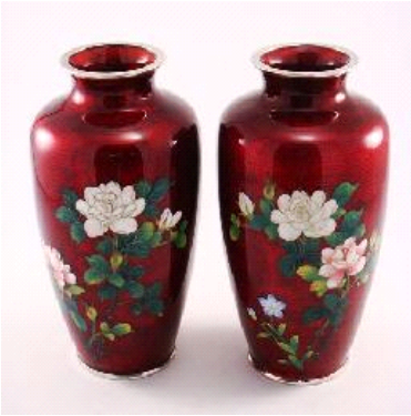
Lot # 65