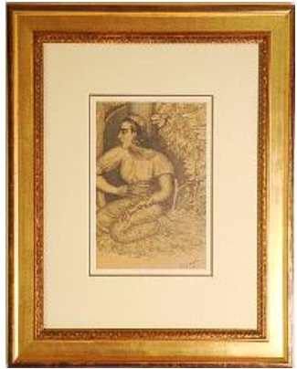
Lot # 303