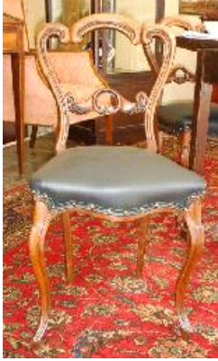
Lot # 330