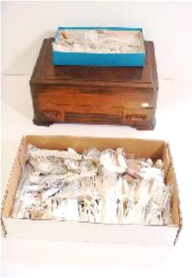
Lot # 80A

80 English sterling silver four piece dresser set. $50 - $75