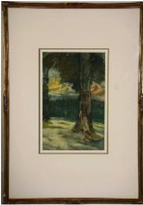
Lot # 360