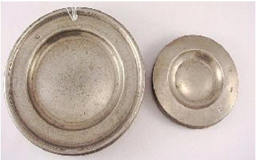
Lot # 306