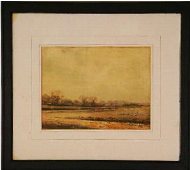
Lot # 299