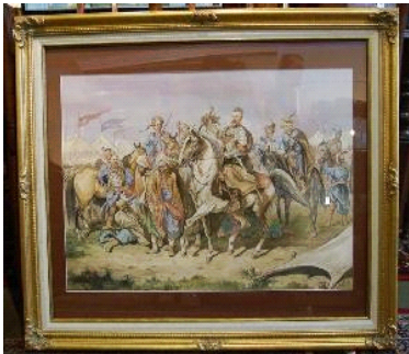
Lot # 190