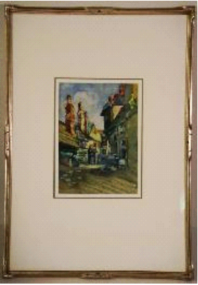
Lot # 361