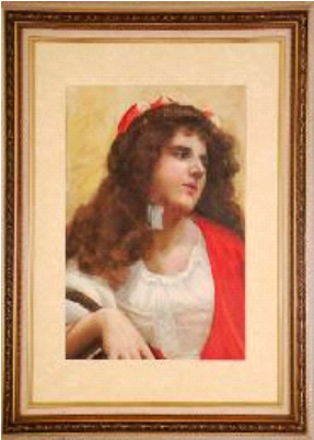
Lot # 290