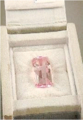
Lot # 140

139 Sevres hand painted porcelain dresser box, length 2 1/4 inches. $50 - $100