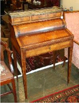
Lot # 364

363 Oil on masonite signed J. Shadbolt, 26" x 40", 1963, "Landscape Tapestry". $4,000 - $6,000