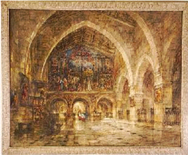
Lot # 298