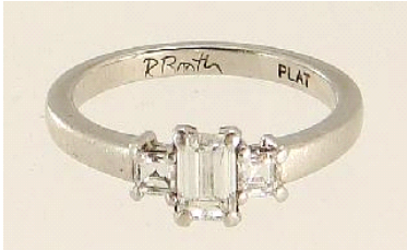
Lot # 126