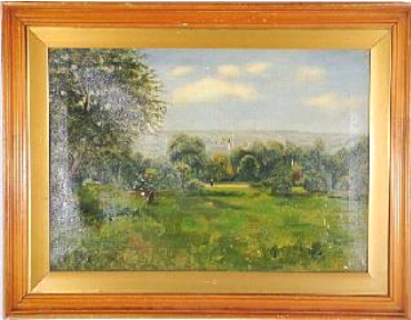
Lot # 247

246 Edwardian inlaid mahogany armoire. $800 - $1,200