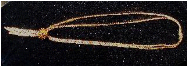
Lot # 129