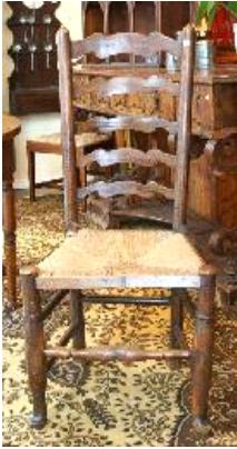
Lot # 312