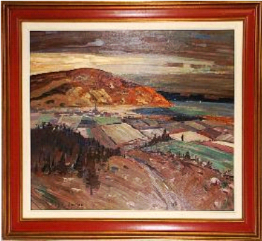
Lot # 362