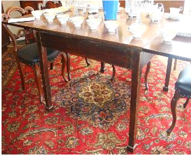
Lot # 329