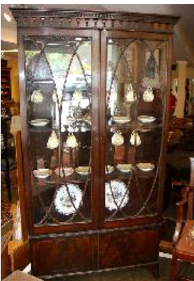
Lot # 357

356 Georgian mahogany Chippendale style armchair with needlework seat. $100 - $150