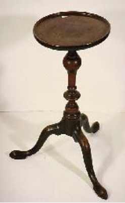
Lot # 322

321 Victorian brass copper kettle, 11 1/4" in height. $50 - $100