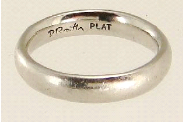
Lot # 128