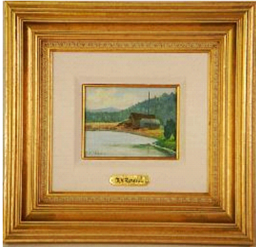
Lot # 332