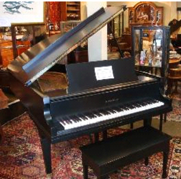
Lot # 272