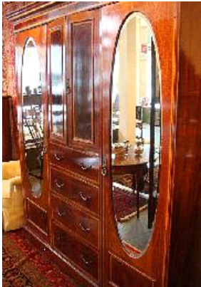
Lot # 246

245 Inuit soapstone carving of a hunter signed with syllables and number 3-20820, ht. 6 1/2in. $200 - $300