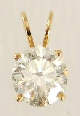
Lot # 132