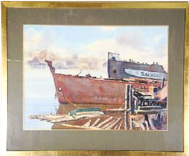
Lot # 203