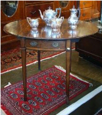
Lot # 255

254 Pair of framed hand painted cards, "Chinese Junks". $75 - $125