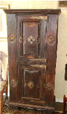
Lot # 252

251 Coloured plate design signed in pencil Picasso, '49. $300 - $400