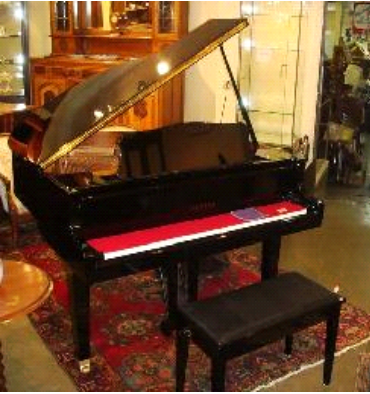
Lot # 1