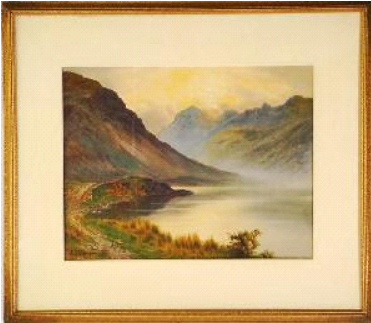
Lot # 248

247 Oil painting on canvas signed Yeend King, 13 1/2in. x 20 1/2in., "View of Country". $250 - $500