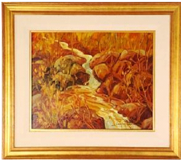
Lot # 345

344 Set of three oil paintings on board signed R.Hone, 6in. x 12 1/4in., "English Hunting Scenes". $150 - $300