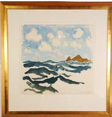
Lot # 258

257 Edwardian inlaid rocking chair. $50 - $100