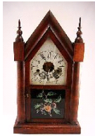
Lot # 426