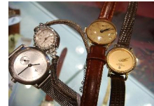
Lot # 458