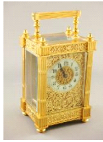
Lot # 446