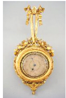
Lot # 405