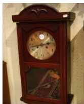
Lot # 417