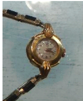
Lot # 466