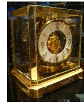
Lot # 443