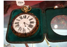
Lot # 455