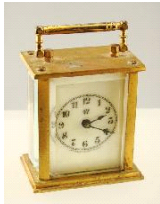
Lot # 448