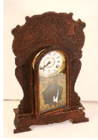
Lot # 438