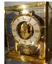
Lot # 423