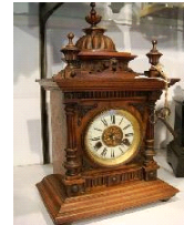
Lot # 435