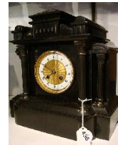
Lot # 436