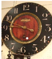
Lot # 415