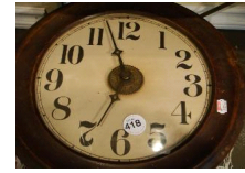
Lot # 418