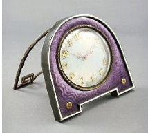
Lot # 447