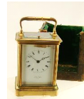
Lot # 445