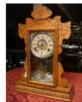
Lot # 437