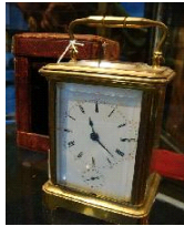
Lot # 449