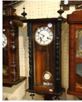
Lot # 413