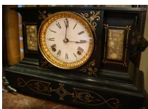
Lot # 429