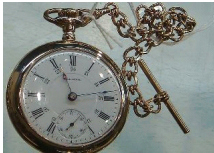
Lot # 464