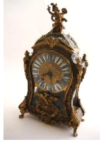
Lot # 401