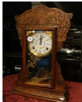
Lot # 439