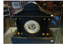
Lot # 451