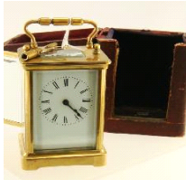
Lot # 450