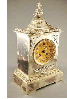
Lot # 442