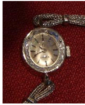
Lot # 462