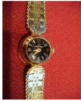
Lot # 460