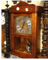
Lot # 412