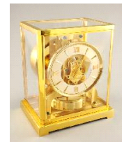
Lot # 423