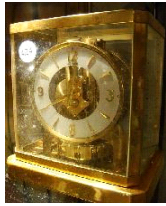
Lot # 424