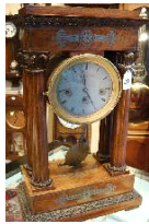
Lot # 403