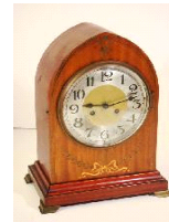
Lot # 454