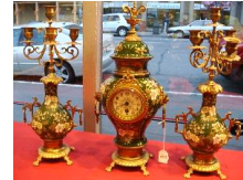
Lot # 452