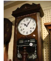
Lot # 408