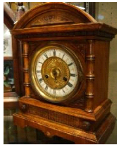
Lot # 427