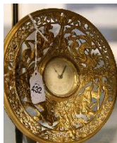
Lot # 432