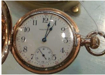
Lot # 463