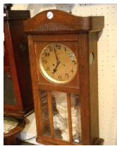
Lot # 414