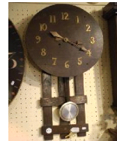
Lot # 411