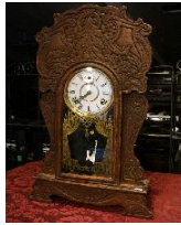
Lot # 438