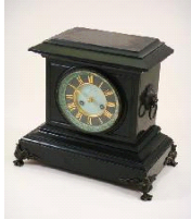
Lot # 402