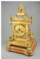
Lot # 404