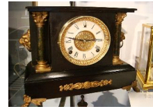
Lot # 434