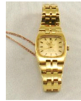
Lot # 469