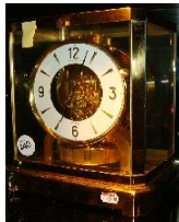
Lot # 440