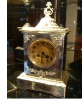
Lot # 442