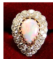
Lot # 455