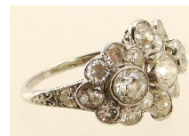
Lot # 476

475 14K cluster style natural sapphire & diamond pendant. $175 - $225