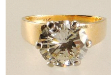
Lot # 418