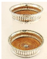
Lot # 468

467 Georgian silver two handled cup, Hester Bateman, 1828/9, 6 1/2" in height. $1,000 - $2,000