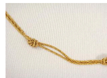
Lot # 472

471 Double strand pearl necklace with 18kt yellow gold and tourmaline 100 pearls, 7-7.5mm. $1,500 - $2,500