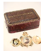
Lot # 528