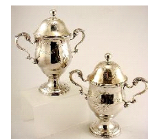
Lot # 445