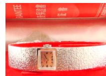
Lot # 531