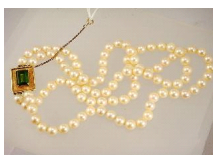
Lot # 471

470 Birks sterling silver ring box. $150 - $250