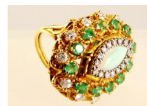
Lot # 460