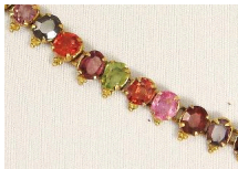
Lot # 493

492 Lady's late 19th./early 20th. cen. gold and pearl bracelet in original box. $300 - $500