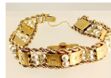
Lot # 502

501 18k yellow gold amethyst diamond ring, centre stone 10.59ct, with consignors appraisal. $1,200 - $1,400