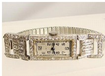
Lot # 538