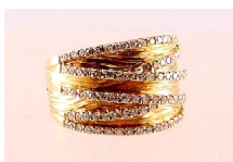
Lot # 434