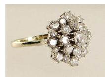
Lot # 454