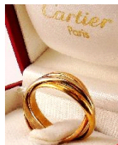
Lot # 433