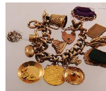
Lot # 473

472 Tiffany & Co 18kt rope knot chain. $900 - $1,100