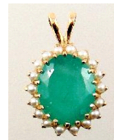
Lot # 503

502 14k & saltwater pearl watch bracelet (44g). $1,200 - $1,500