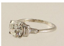
Lot # 469

469 Platinum and diamond ring, centre stone measuring 1.37 ct., clarity SI-1, colour I-J. $5,000 - $7,000