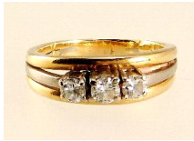
Lot # 571