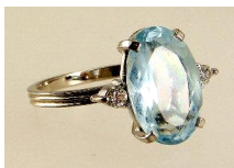
Lot # 451