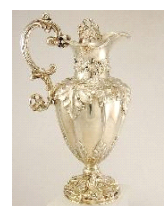
Lot # 443