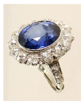
Lot # 448