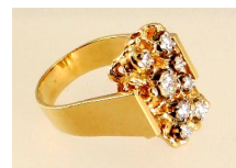
Lot # 440