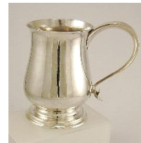
Lot # 424