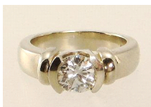
Lot # 437