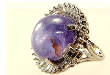
Lot # 419