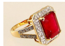
Lot # 477

476 Platinum and diamond ring. $1,500 - $2,000