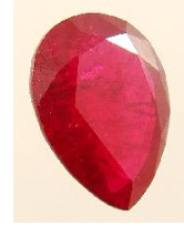
Lot # 417