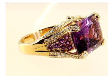
Lot # 501

500 Gold coin bracelet, 7 ten guilder- coins, 1875-1925. $500 - $1,000