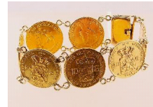
Lot # 500

499 Custom 18kt diamond and tourmaline ring. $1,000 - $1,200