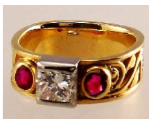
Lot # 431