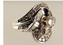
Lot # 525