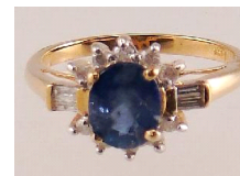
Lot # 567