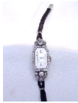
Lot # 535