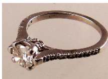
Lot # 522