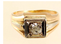
Lot # 526