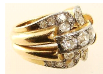
Lot # 458