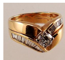
Lot # 456