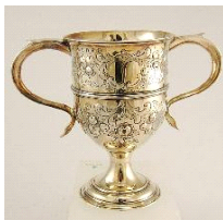
Lot # 467

466 Georgian silver teapot, London, 1807/ 1808, probably Thos. Jenkinson, 10 inches in length. $250 - $500