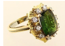
Lot # 499

498 Long single strand of cultured pearls, diamond set clasp. $500 - $700