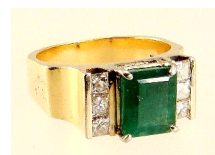
Lot # 439