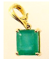
Lot # 504

503 14k pendant set with oval facettted natural emerald and 18 pearls. $750 - $1,250