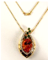
Lot # 495

494 Ammolite 14k gold pendant. $400 - $600