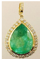
Lot # 416