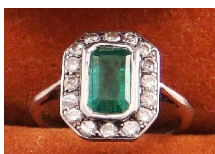
Lot # 432