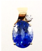
Lot # 507