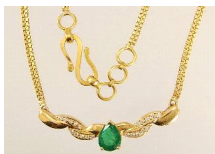
Lot # 497

496 10k white gold and diamond bangle. $300 - $500