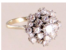
Lot # 454