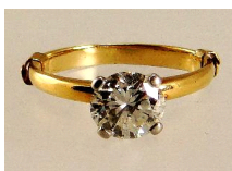
Lot # 447